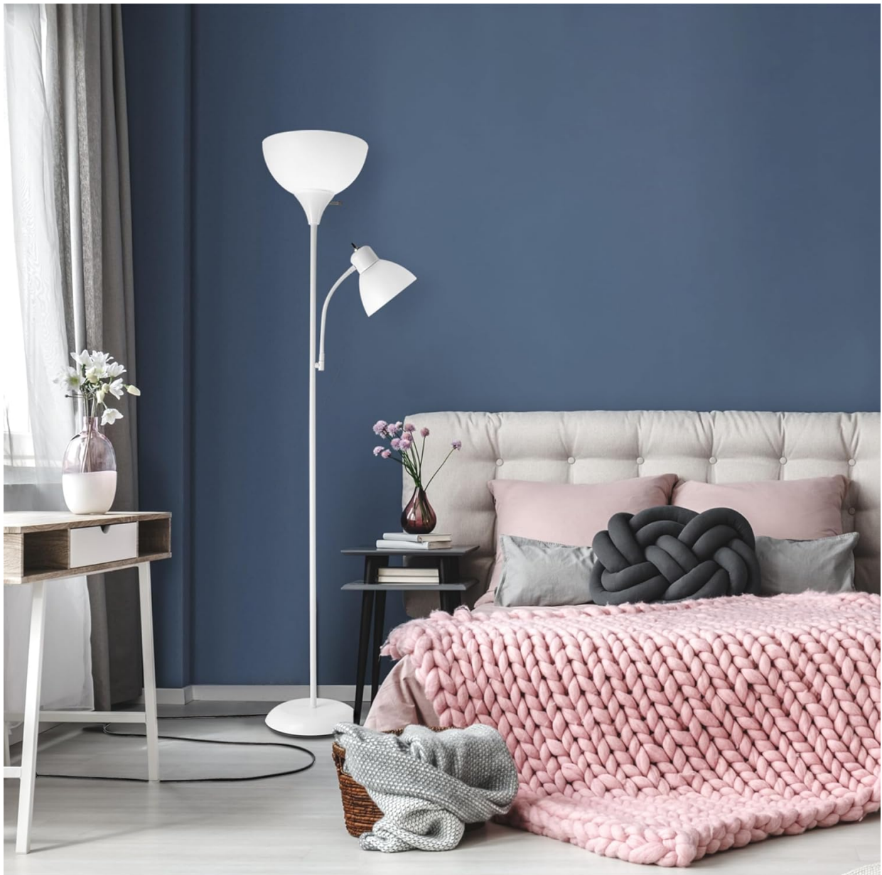
Image: A fully assembled Globe Electric 72-inch Torchiere Floor Lamp with adjustable reading light, featuring a matte white finish and frosted shades, positioned in a modern bedroom setting.

Connect the lamp pole sections by screwing them clockwise. As you connect each section, gently pull the power cord through the pole to prevent tangling and ensure a snug fit. Ensure all connections are secure.