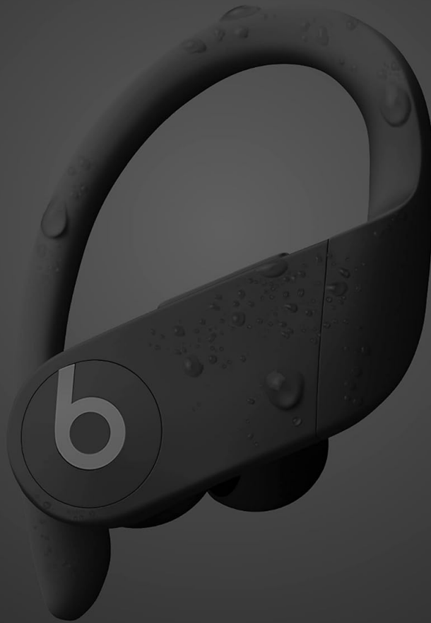
Image: A Powerbeats Pro earbud with visible water droplets, demonstrating its sweat and water-resistant capabilities.

WITH ADJUSTABLE, SECURE-FIT EARHOOKS FOR ADDED COMFORT AND STABILITY.