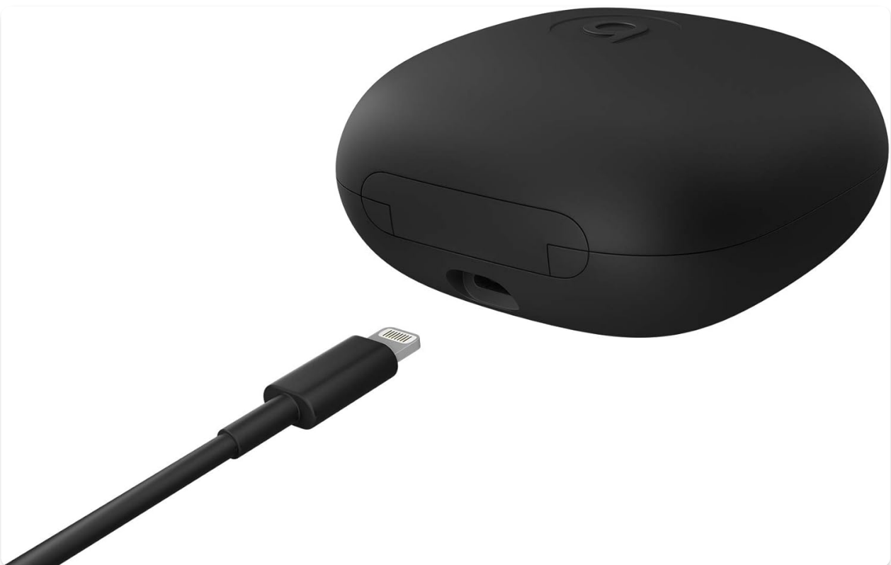
Image: The Powerbeats Pro charging case connected to its Lightning charging cable.