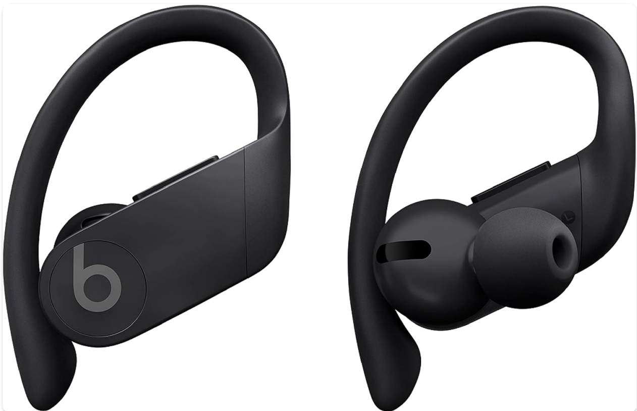
Image: The Beats Powerbeats Pro Wireless Earbuds, showcasing their sleek, ergonomic design.

Welcome to the user manual for your Beats Powerbeats Pro Wireless Earbuds. These high-performance, totally wireless earphones are designed to revolutionize your listening experience, especially during workouts. Featuring the Apple H1 headphone chip, Class 1 Bluetooth, and a sweat and water-resistant design, Powerbeats Pro offers exceptional sound quality, comfort, and durability. This manual provides essential information on setup, operation, maintenance, and troubleshooting to help you get the most out of your earbuds.