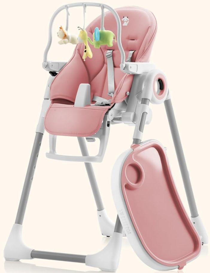
Image 2.1: Detail of the 5-point safety harness and rear wheels, highlighting the chair's safety features.