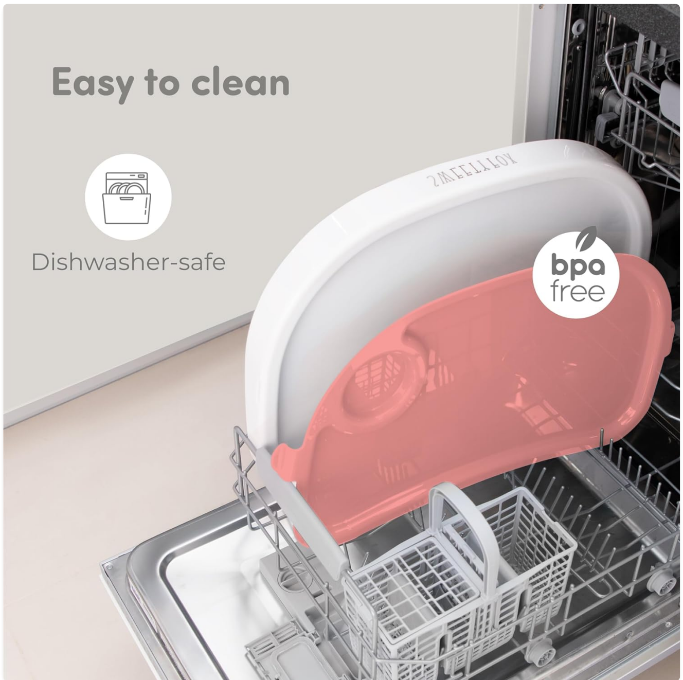
Image 6.1: The high chair's tray is dishwasher-safe, simplifying the cleaning process.