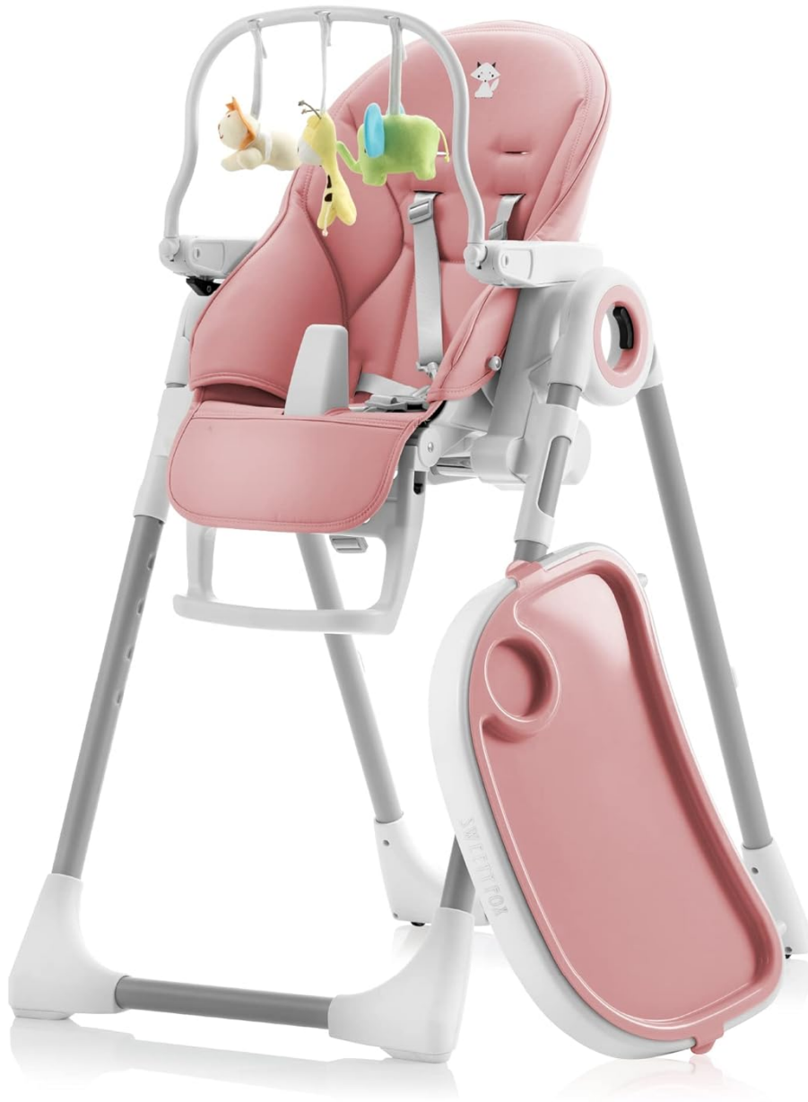
Image 1.1: The Sweety Fox Baby High Chair in Pink, showcasing its overall design and included toy arch.