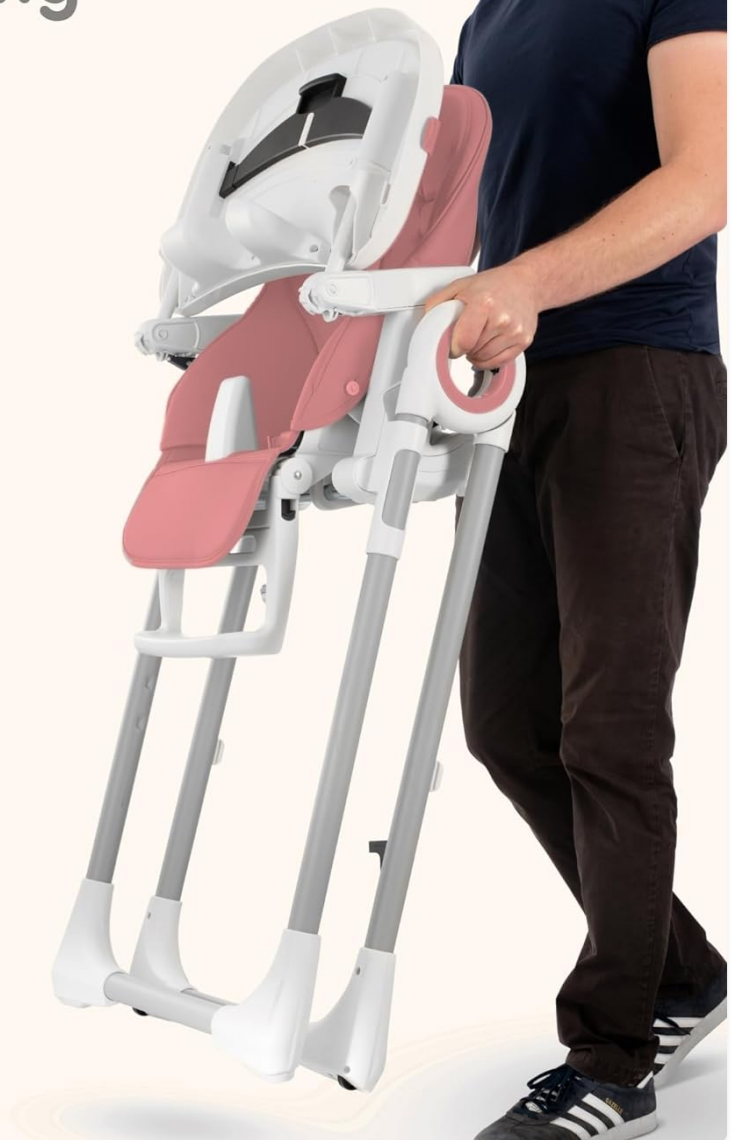
Image 5.3: Demonstration of the high chair's effortless folding mechanism for compact storage.