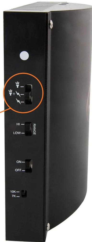
Image: A SportDOG In-Ground Fence Transmitter with a highlighted switch, indicating that if your transmitter has this switch, it is NOT compatible with this Rechargeable Add-A-Dog Collar (SDF-CR).

:: If your transmitter has this switch, it is NOT compatible with this Rechargeable Add-A-Dog® Collar (SDF-CR)