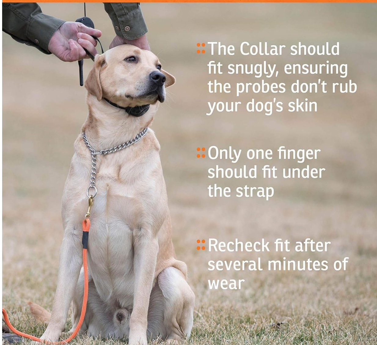
Image: A Labrador Retriever wearing the collar, with text indicating "The Collar should fit snugly, ensuring the probes don't rub your dog's skin," "Only one finger should fit under the strap," and "Recheck fit after several minutes of wear."