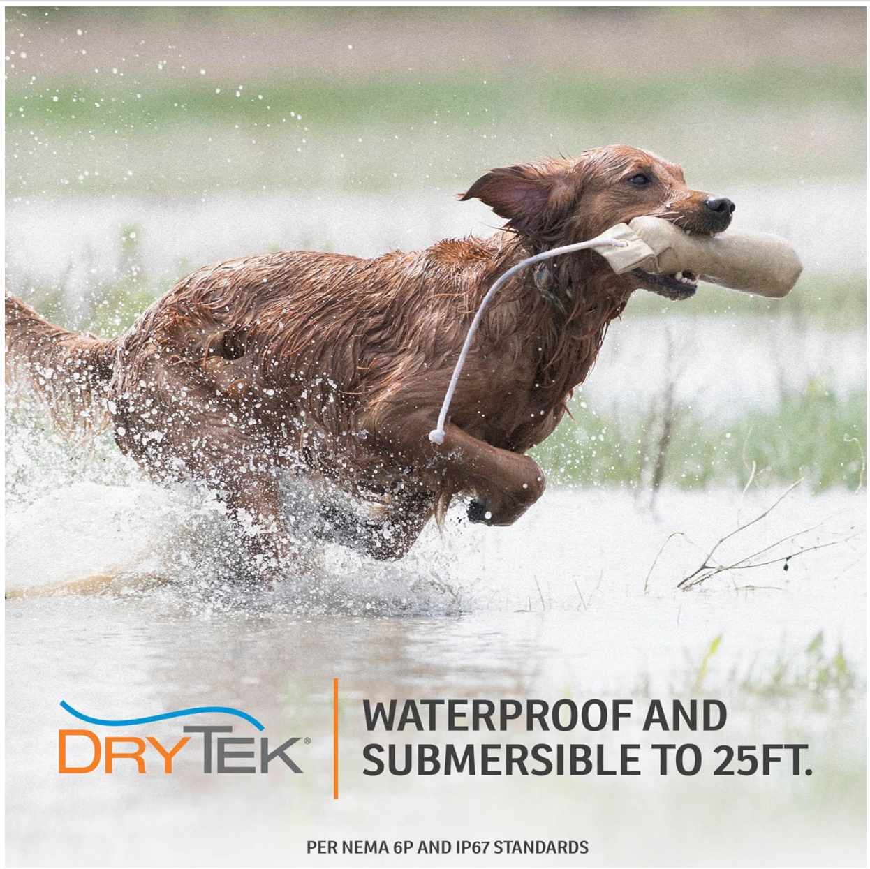
Image: A golden retriever running through water, with text "DRYTEK Waterproof and Submersible to 25ft."