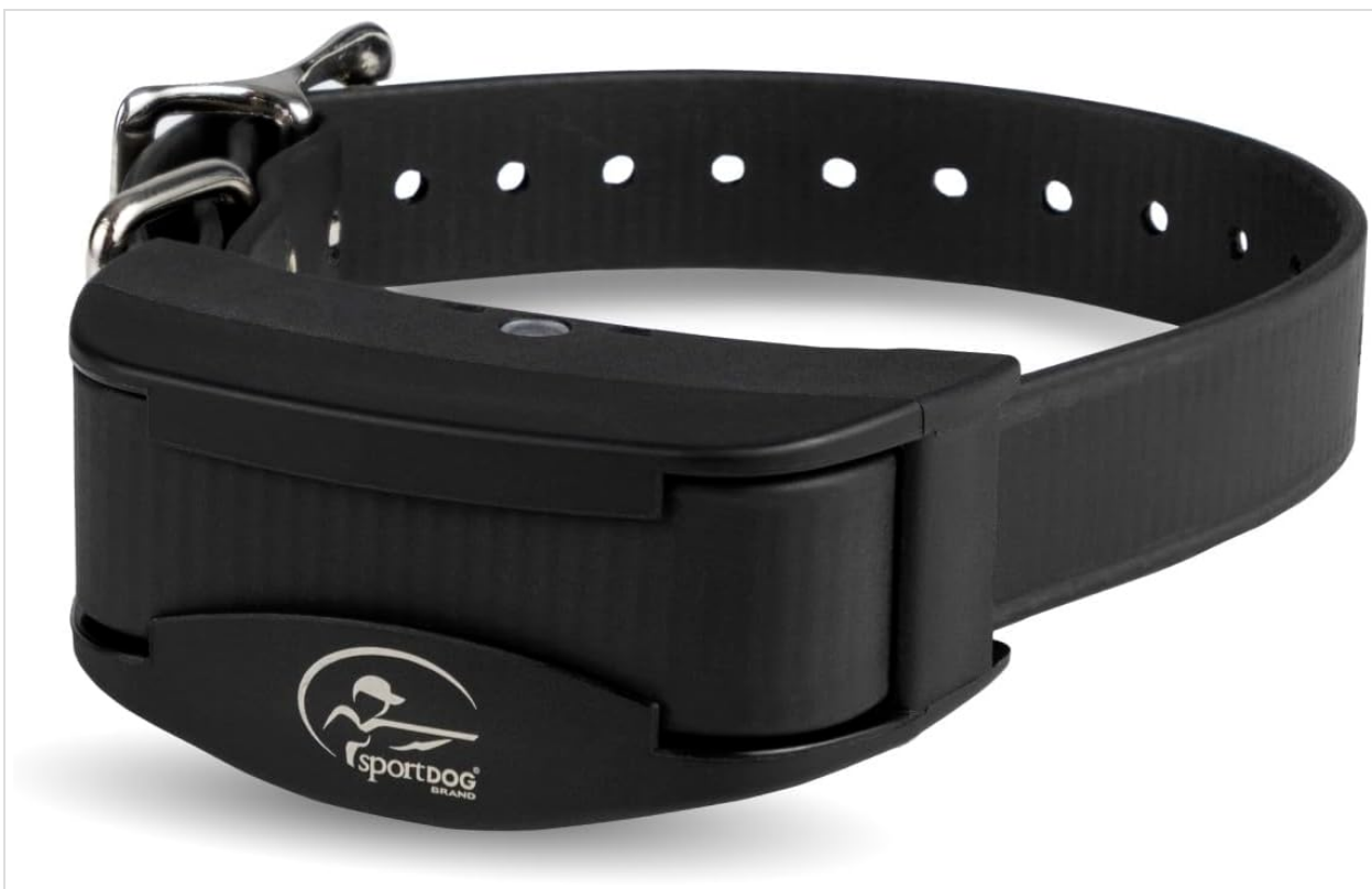
Image: SportDOG In-Ground Fence Add-A-Dog Collar, a black collar with a receiver unit.

The SportDOG Brand Rechargeable In-Ground Fence Add-A-Dog Collar is designed to seamlessly integrate with your existing SportDOG Brand Rechargeable In-Ground Dog Fence System (SDF-100C). This durable, waterproof, and rechargeable receiver collar helps ensure your pet's safety and containment within defined boundaries. It offers customizable stimulation options to suit your dog's specific needs and temperament.