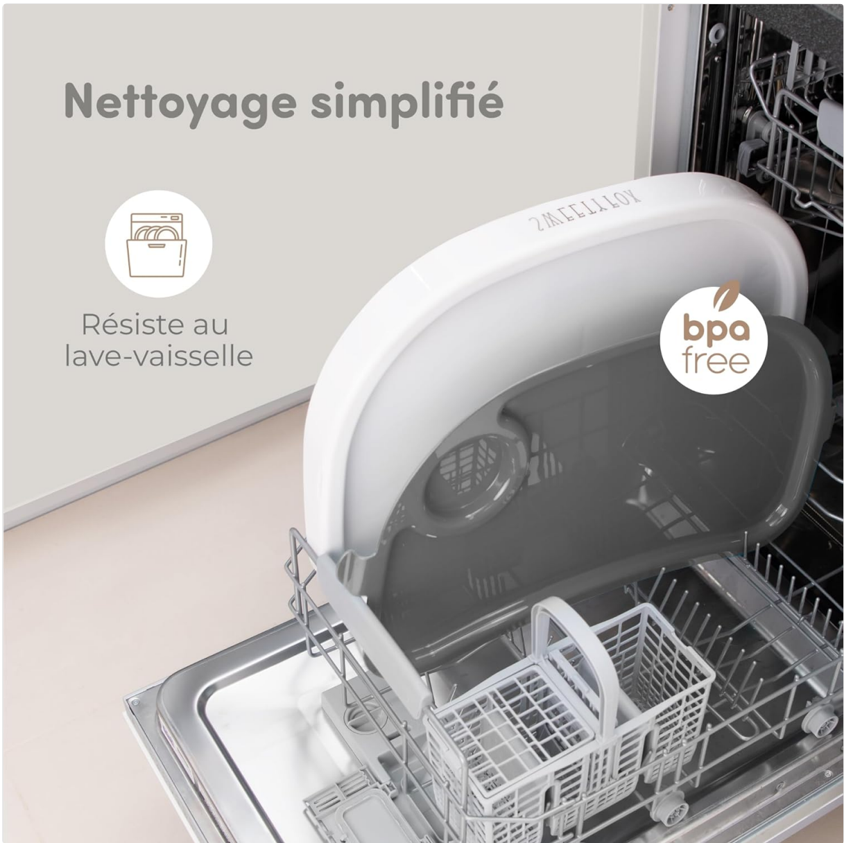
Figure 6.1: Dishwasher-safe tray insert.