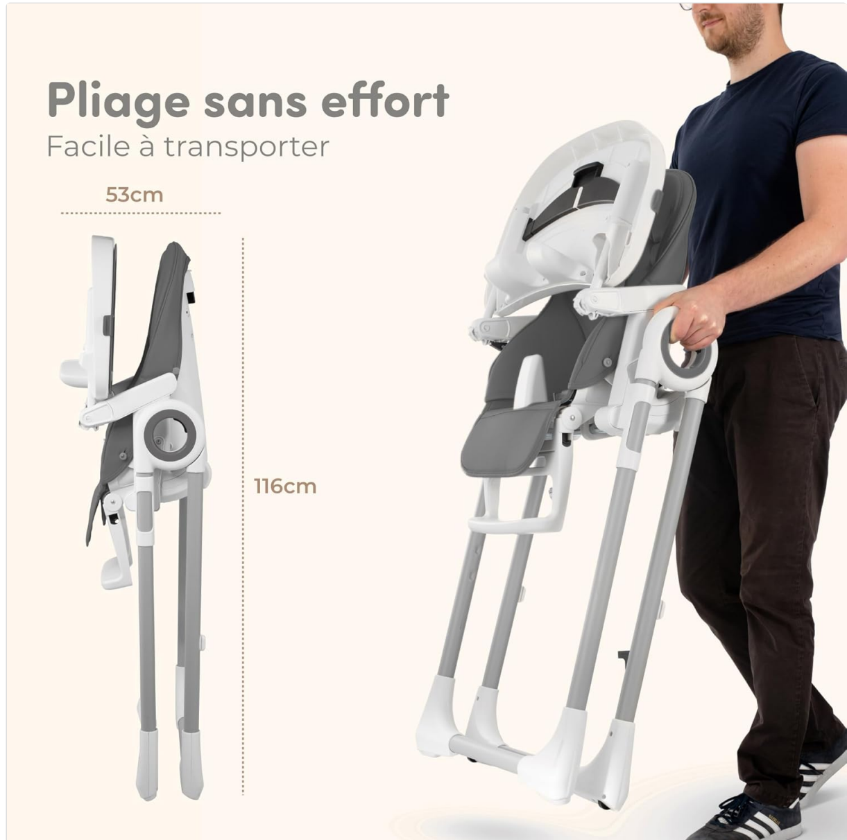
Figure 4.1: High chair in folded position and being carried.