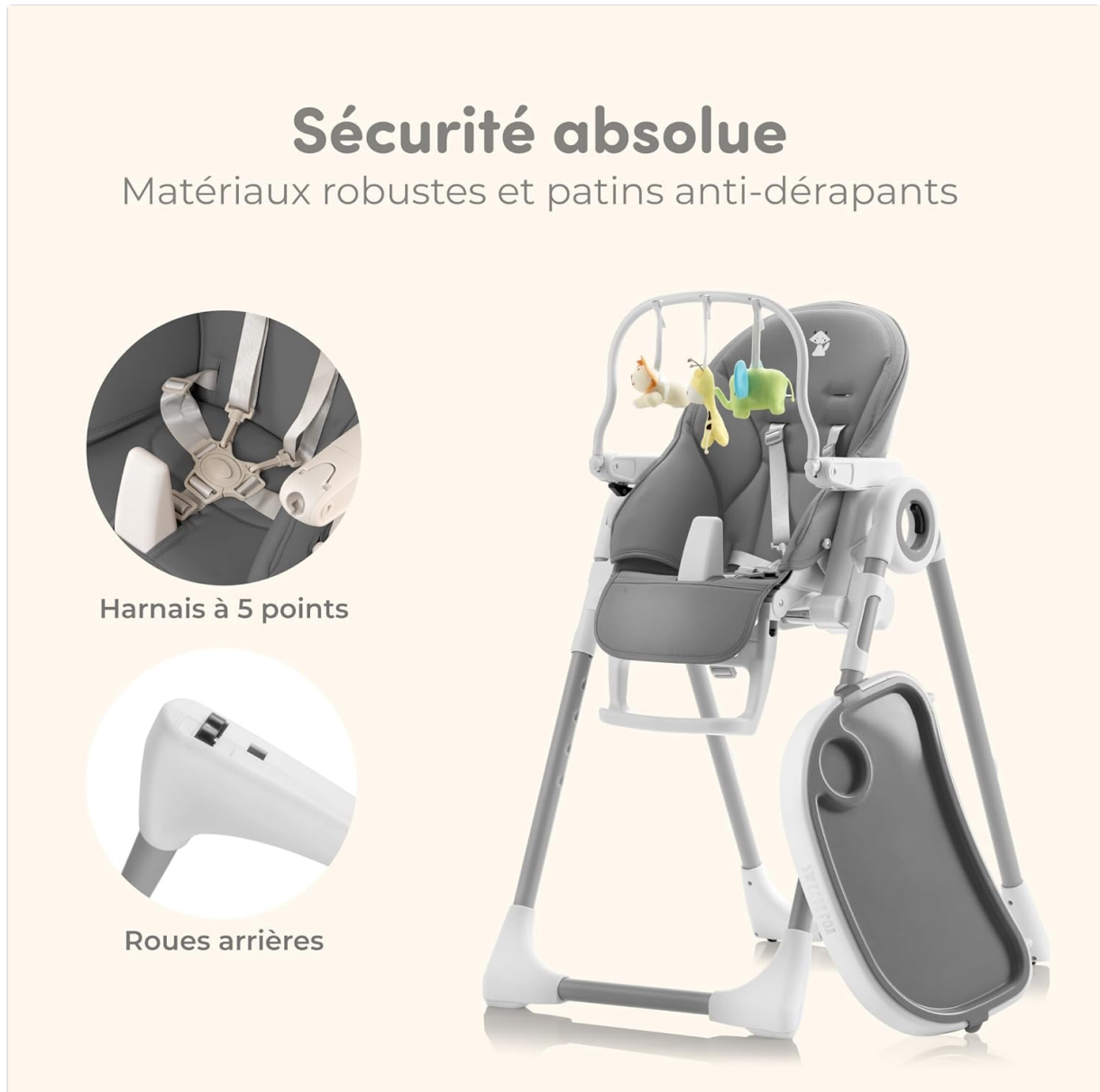
Figure 5.4: 5-point safety harness and rear wheels.