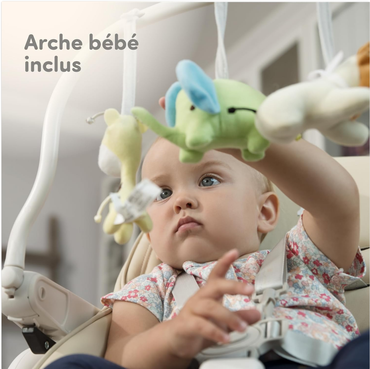
Figure 4.3: Play bar with toys attached.