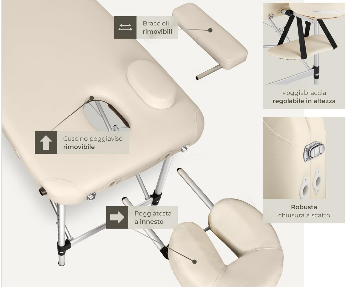
Image: Detailed view of the massage table's adjustable features, including removable armrests, a removable face cushion, an adjustable headrest, and the robust latch mechanism.