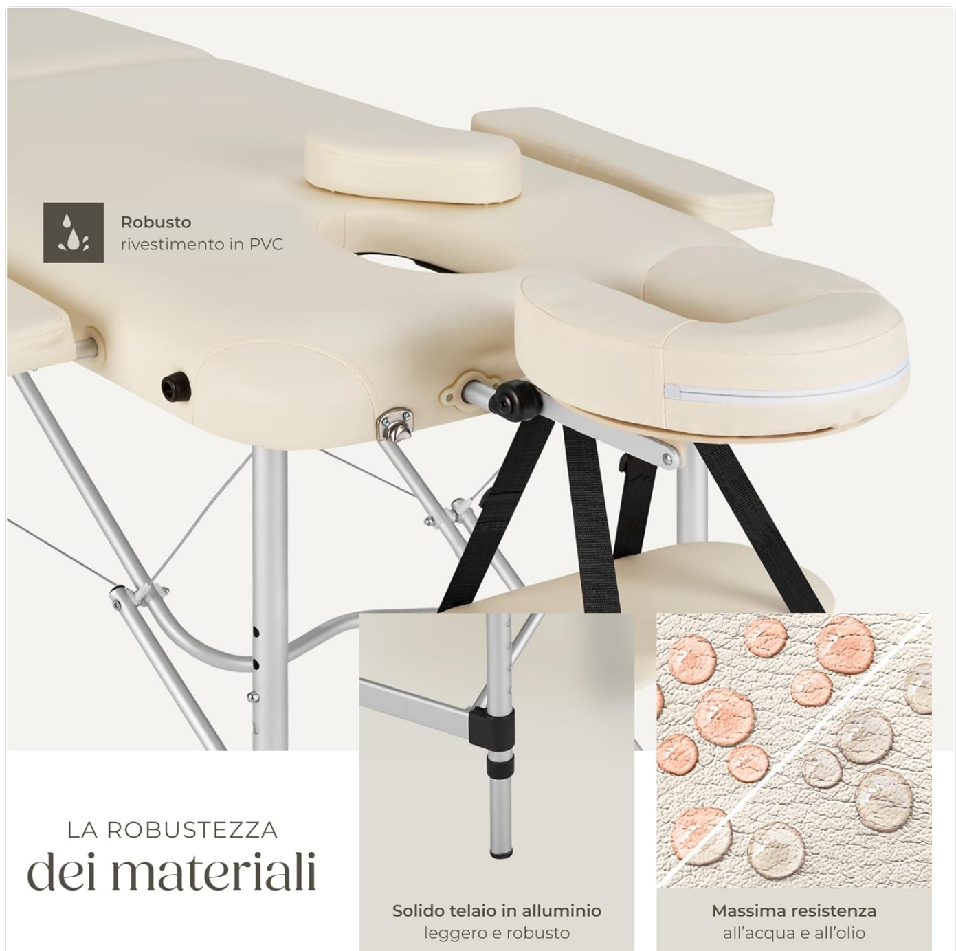
Image: This image emphasizes the robust materials of the massage table, including the PVC upholstery which is resistant to water and oil, and the solid, lightweight aluminum frame.