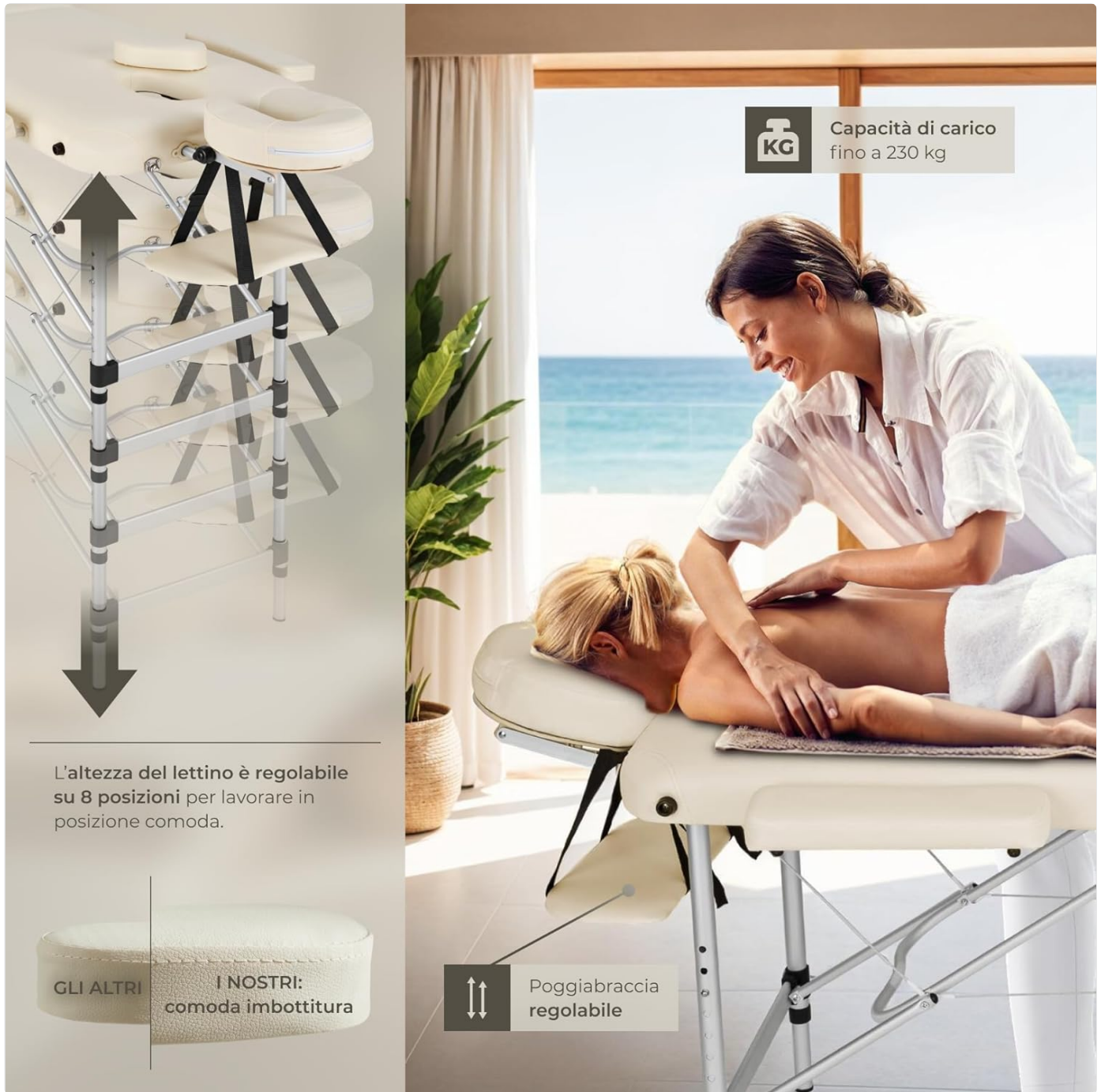
Image: The massage table in use, illustrating its adjustable height and the comfortable headrest. The image also shows the table's capacity up to 230 kg.

and can be adjusted for optimal client positioning.