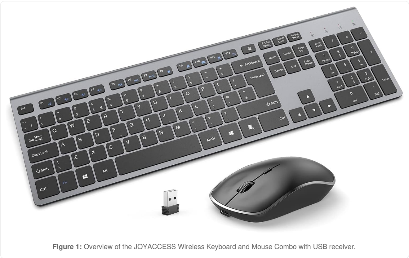
Figure 1: Overview of the JOYACCESS Wireless Keyboard and Mouse Combo with USB receiver.