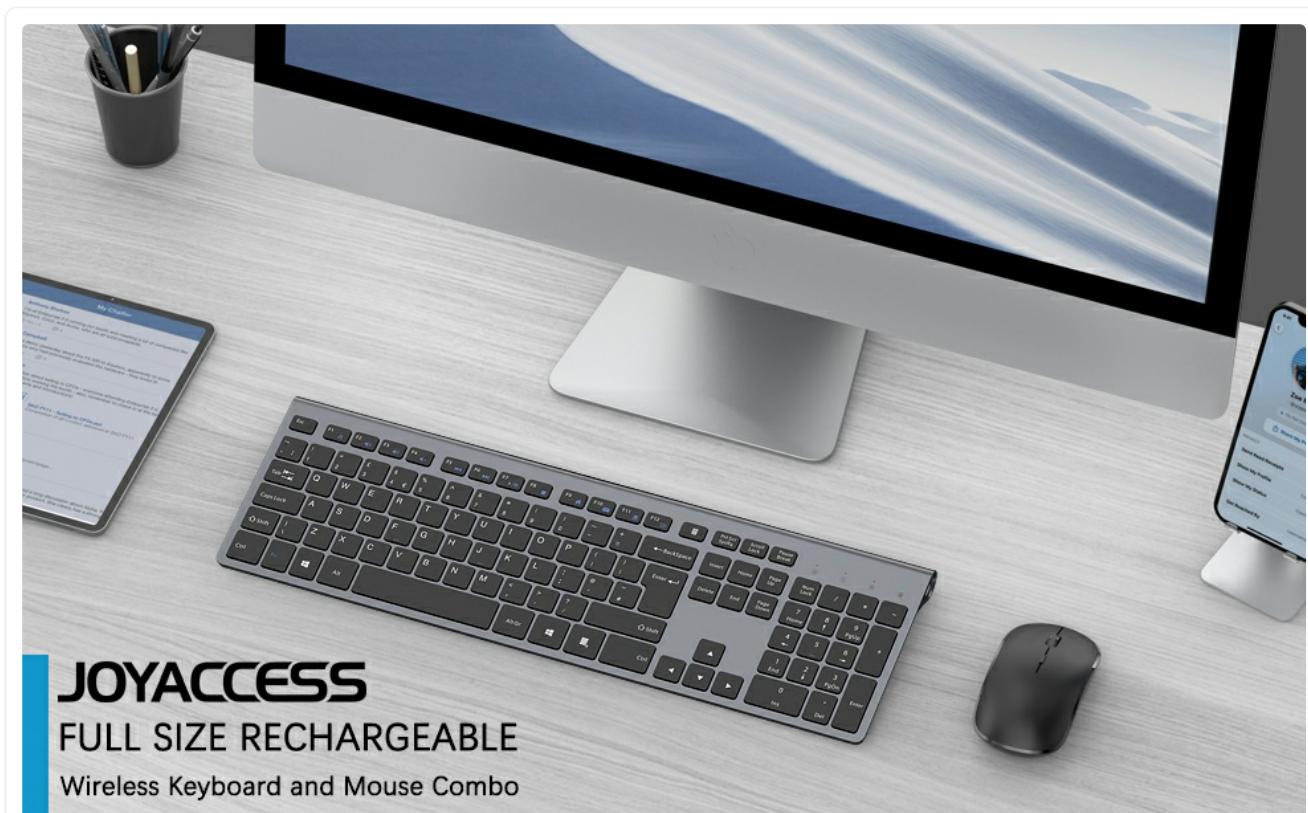
Figure 5: Diagram illustrating the simple plug-and-play setup process for the JOYACCESS wireless keyboard and mouse combo.