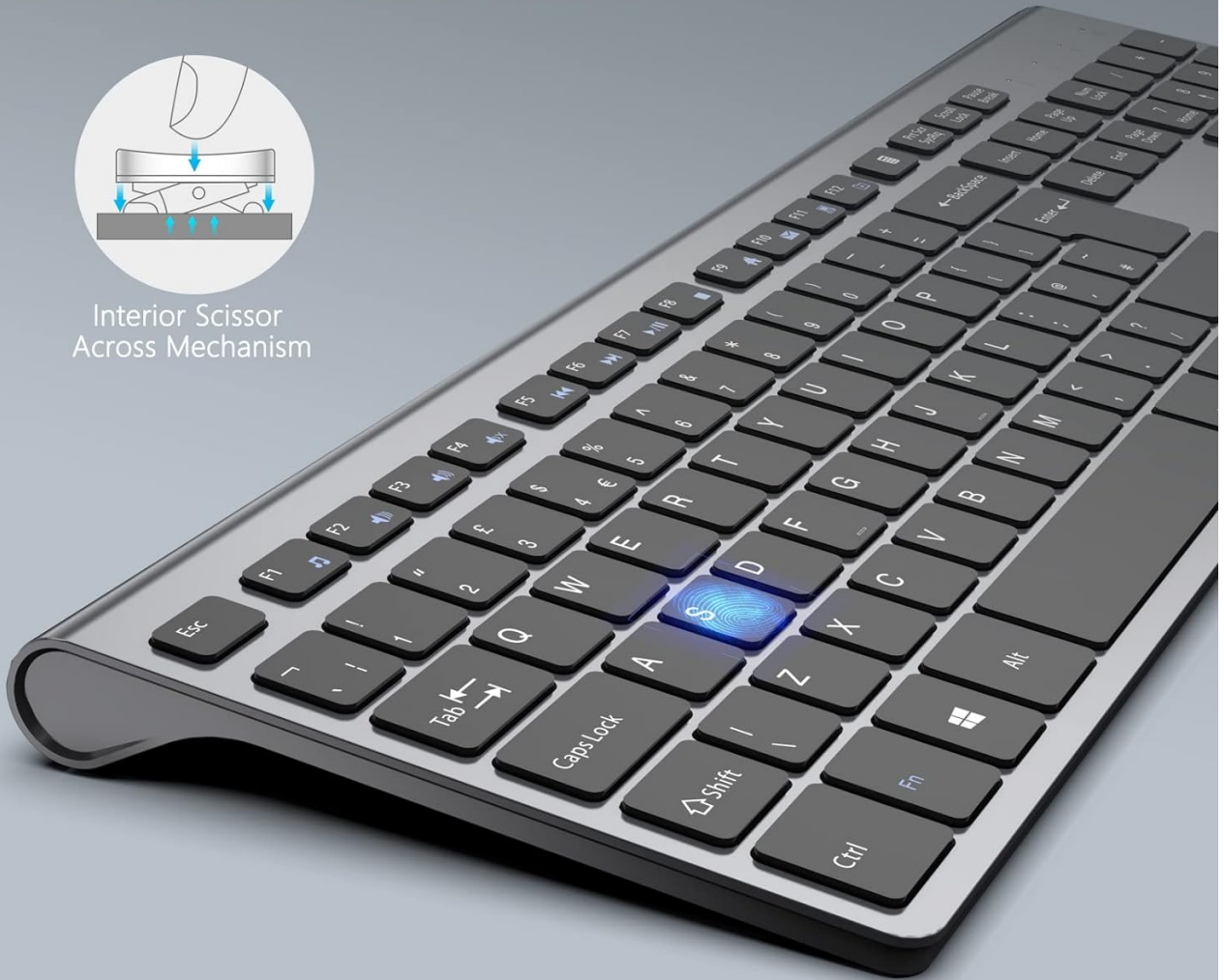
Figure 3: Illustration of the interior scissor mechanism of the keyboard keys, designed for comfortable and quiet typing with a short 3mm keystroke travel.