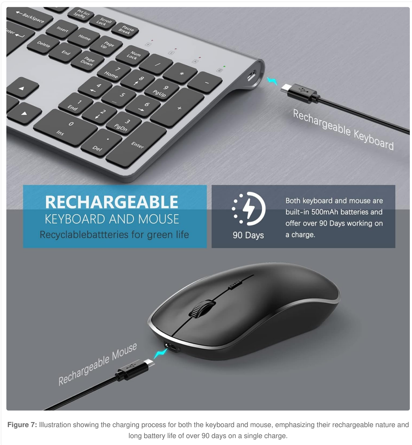
Figure 7: Illustration showing the charging process for both the keyboard and mouse, emphasizing their rechargeable nature and long battery life of over 90 days on a single charge.