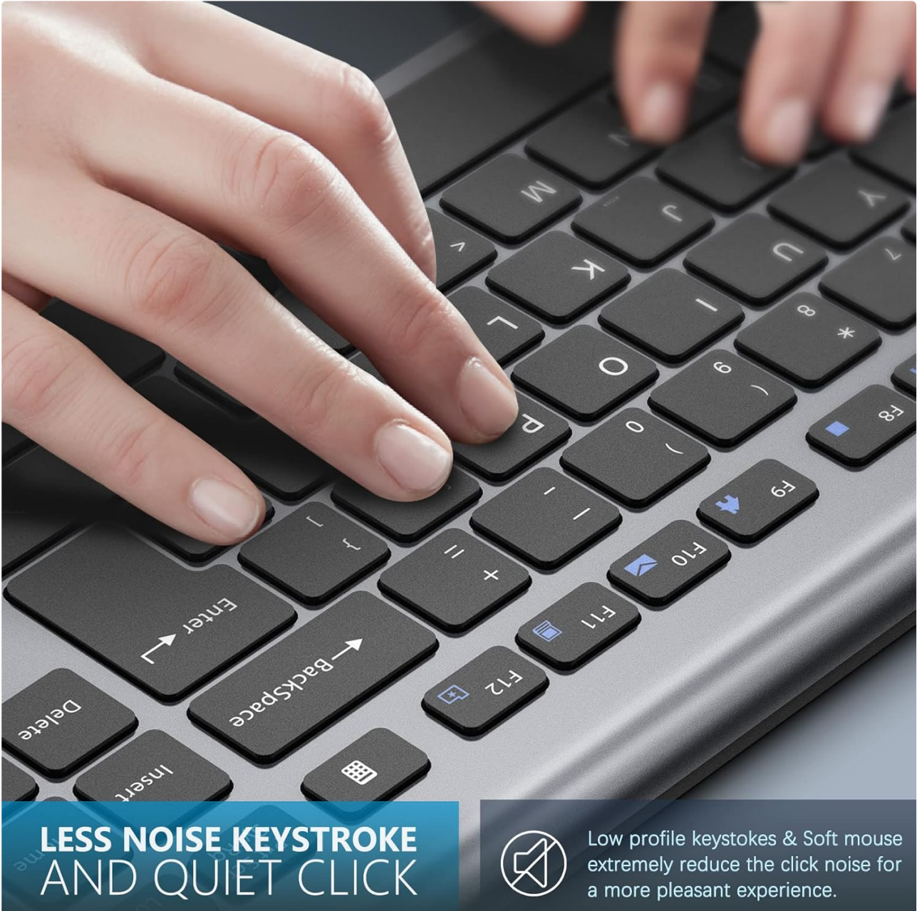
Figure 6: Demonstrates hands typing on the JOYACCESS wireless keyboard, highlighting the low-profile keystrokes and quiet click design for reduced noise.