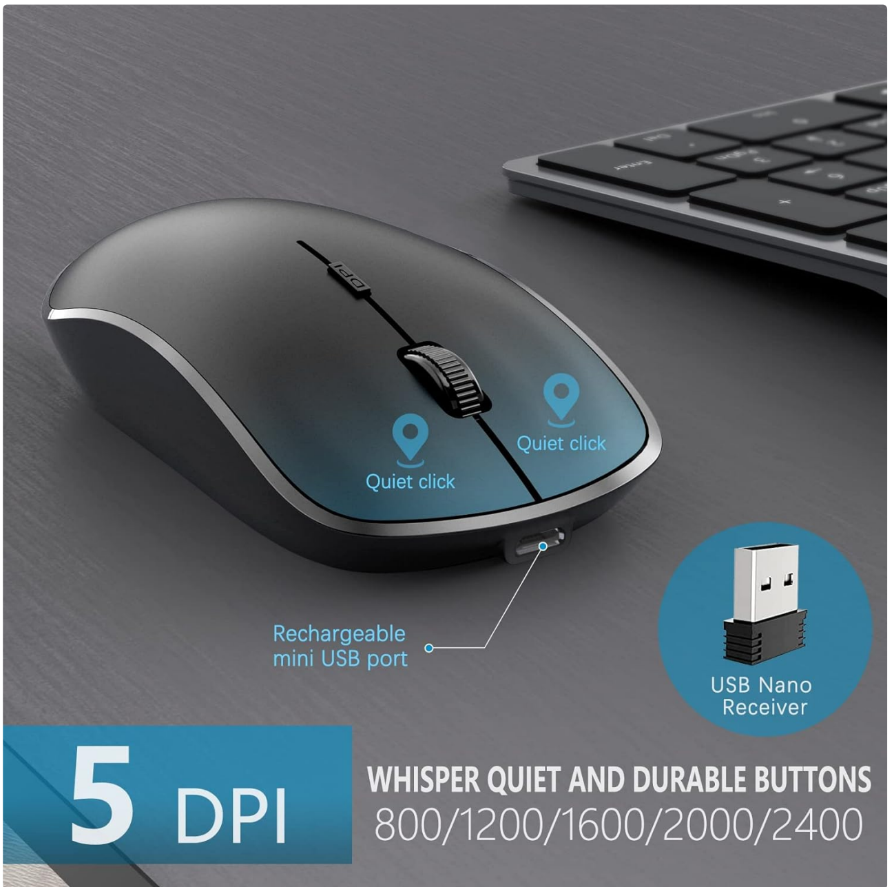
Figure 2: Close-up of the JOYACCESS Wireless Mouse showing the USB Nano Receiver port and quiet click zones. The mouse features adjustable DPI settings from 800 to 2400.