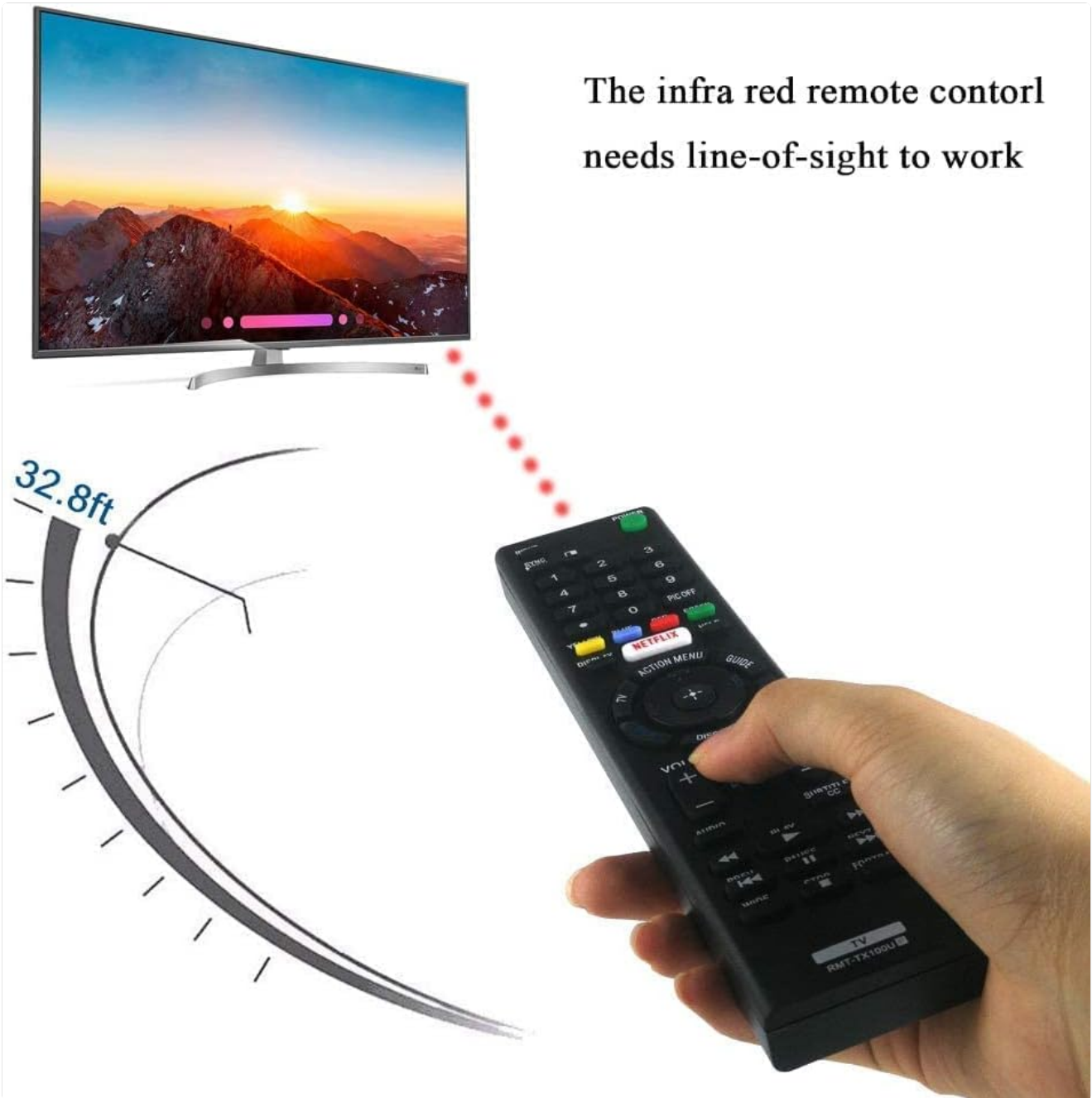
Image: An annotated diagram of the remote control, pointing out the Power, Number, Color, Netflix, Volume, and Channel buttons.

The infra red remote control needs line-of-sight to work