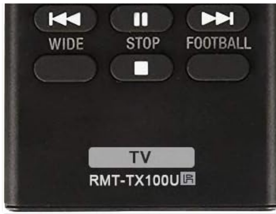
Image: The remote control being held, demonstrating its use with a Sony Bravia TV.