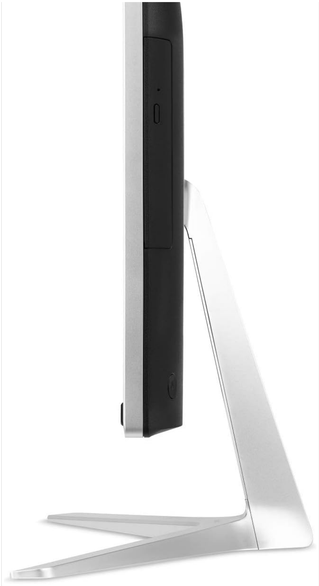
Image 5.1: Side view illustrating the location of the optical drive.