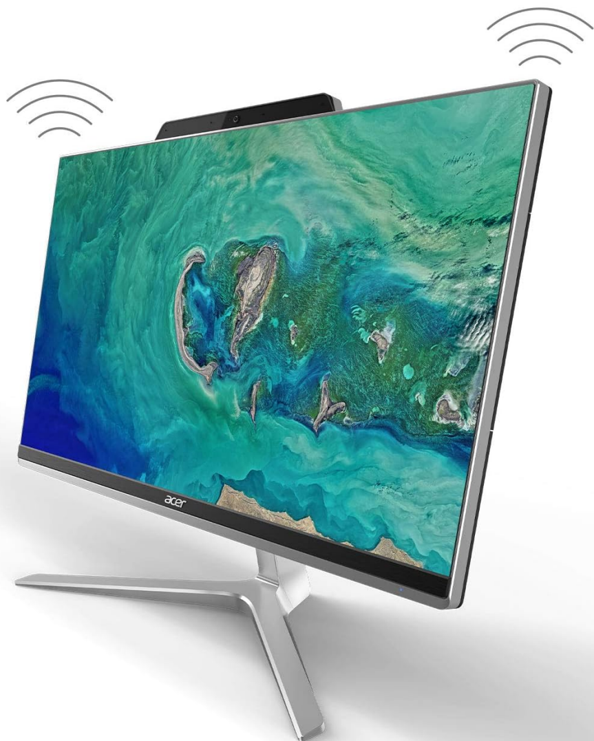
Image 5.2: Visual representation of the integrated webcam and wireless capabilities.