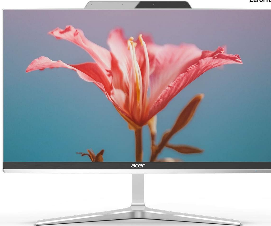
Image 4.2: The borderless display design for an immersive viewing experience.