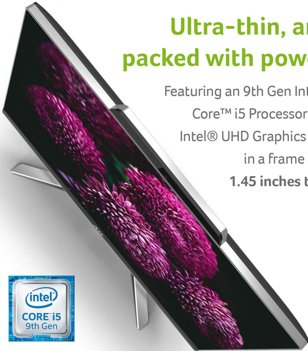
Image 4.1: The slim profile of the desktop, illustrating its compact design.

Featuring an 9th Gen Intel® Core™ i5 Processor and Intel® UHD Graphics 630 in a frame only 1.45 inches thin.