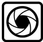
Full HD webcam

Connect with top-speed wireless and a Full HD webcam.