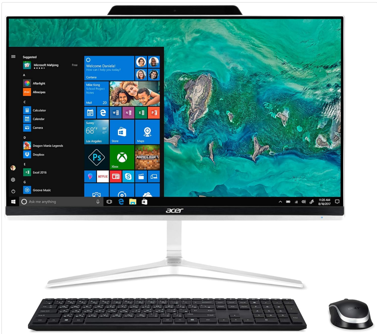
Image 1.1: Front view of the Acer Aspire Z24-890-UA91 All-in-One Desktop, showcasing the display, wireless keyboard, and mouse.