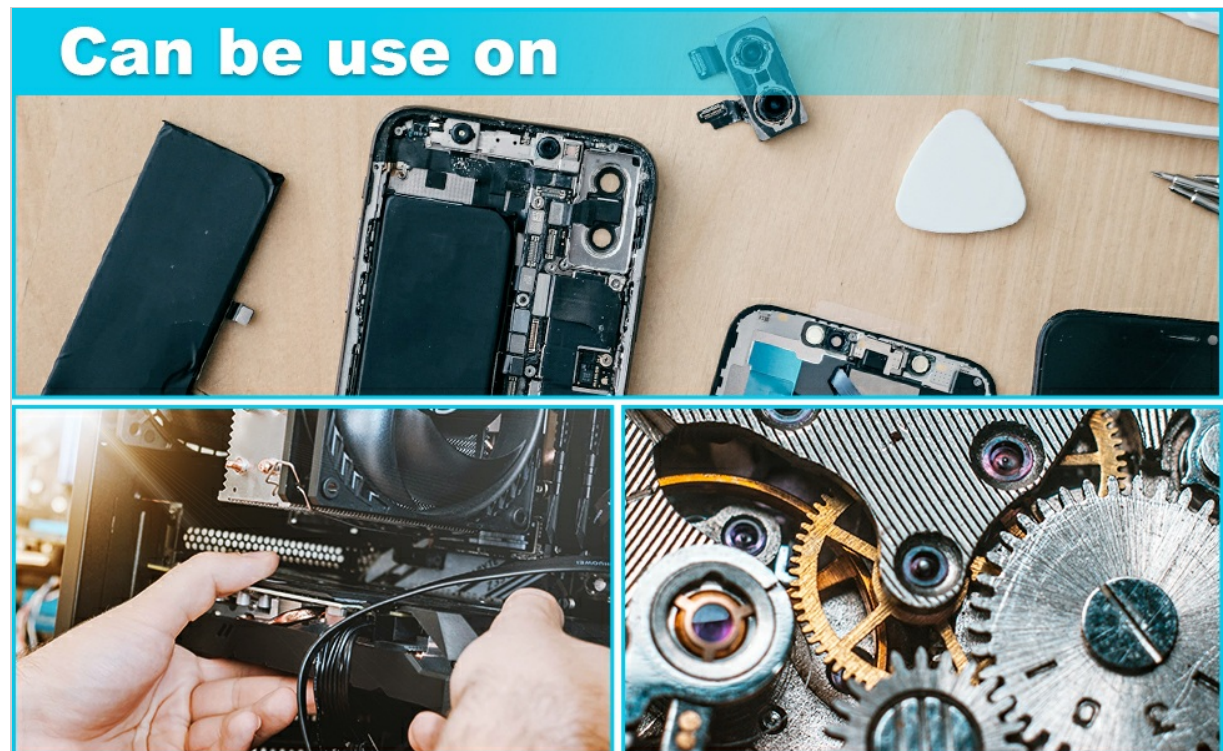
Figure 4: Versatile Applications. Examples of the screwdriver being used for electronics repair, machinery, and automotive tasks.