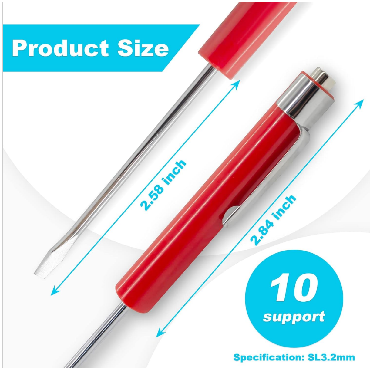
Figure 1: Product Dimensions. The screwdriver measures 5.4 inches in total length, with a 2.84-inch handle and a 2.58-inch shaft and tip.