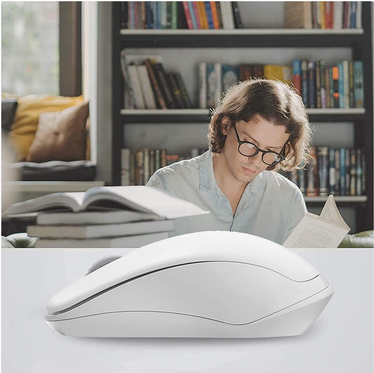
Image: A user operating the Rapoo 1680 mouse in a library, emphasizing its quiet operation for undisturbed work.