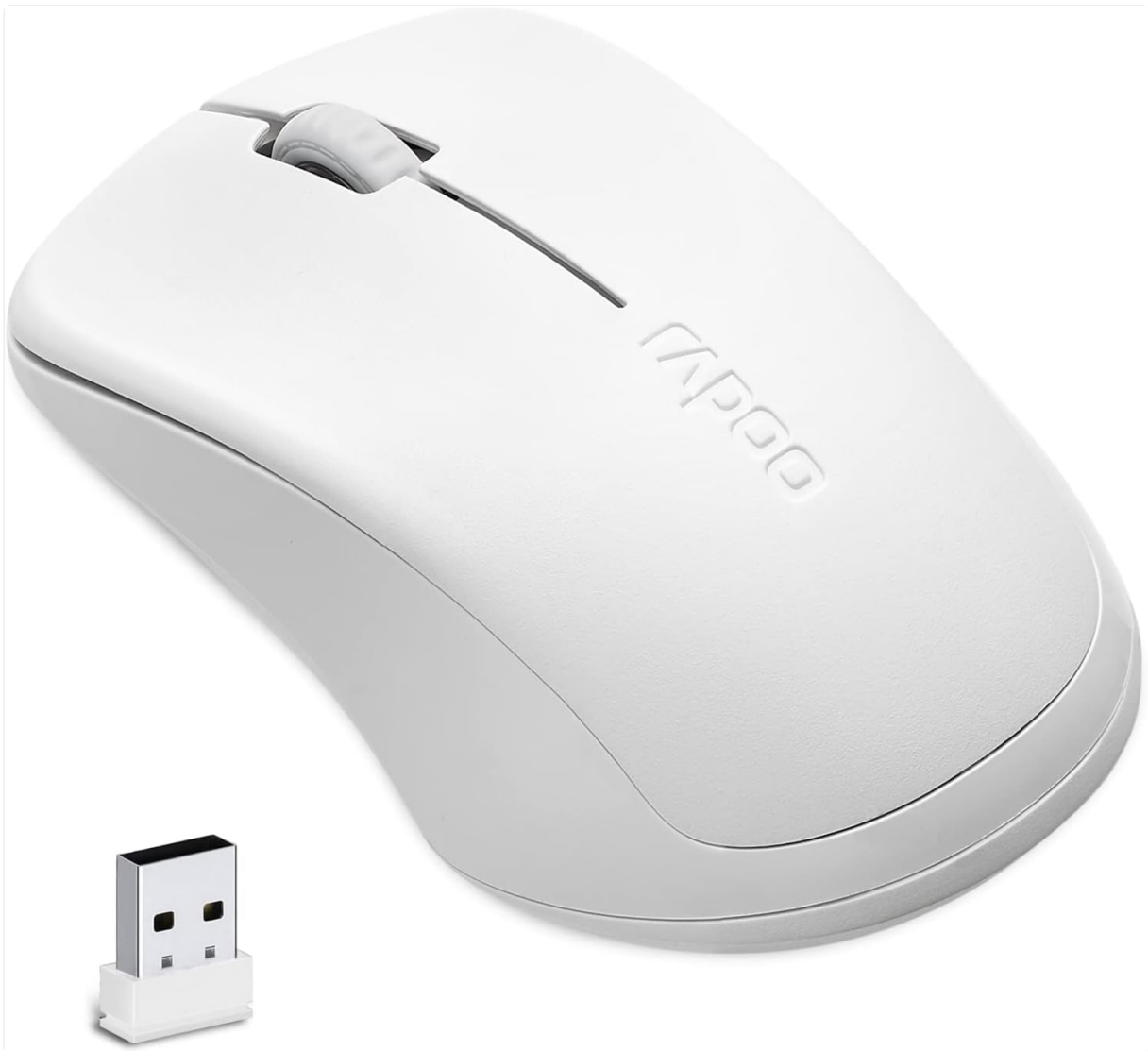
Image: The Rapoo 1680 Silent Wireless Mouse, showcasing its sleek, ambidextrous design in white.