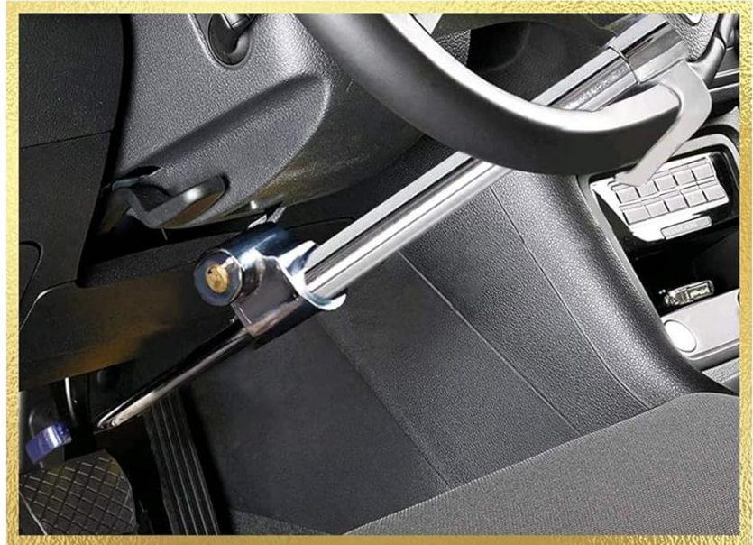
Image: The Tevalaphee Steering Wheel Brake Lock in use, securing the steering wheel to the brake pedal.