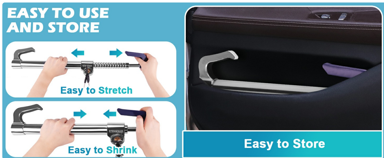
Image: The lock's easy stretch and shrink feature for convenient storage.