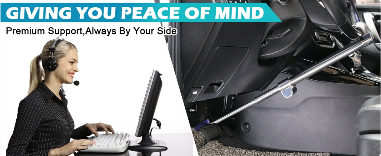
Image: Tevlaphee customer support is available to assist you.

order details and selecting "Contact Seller."