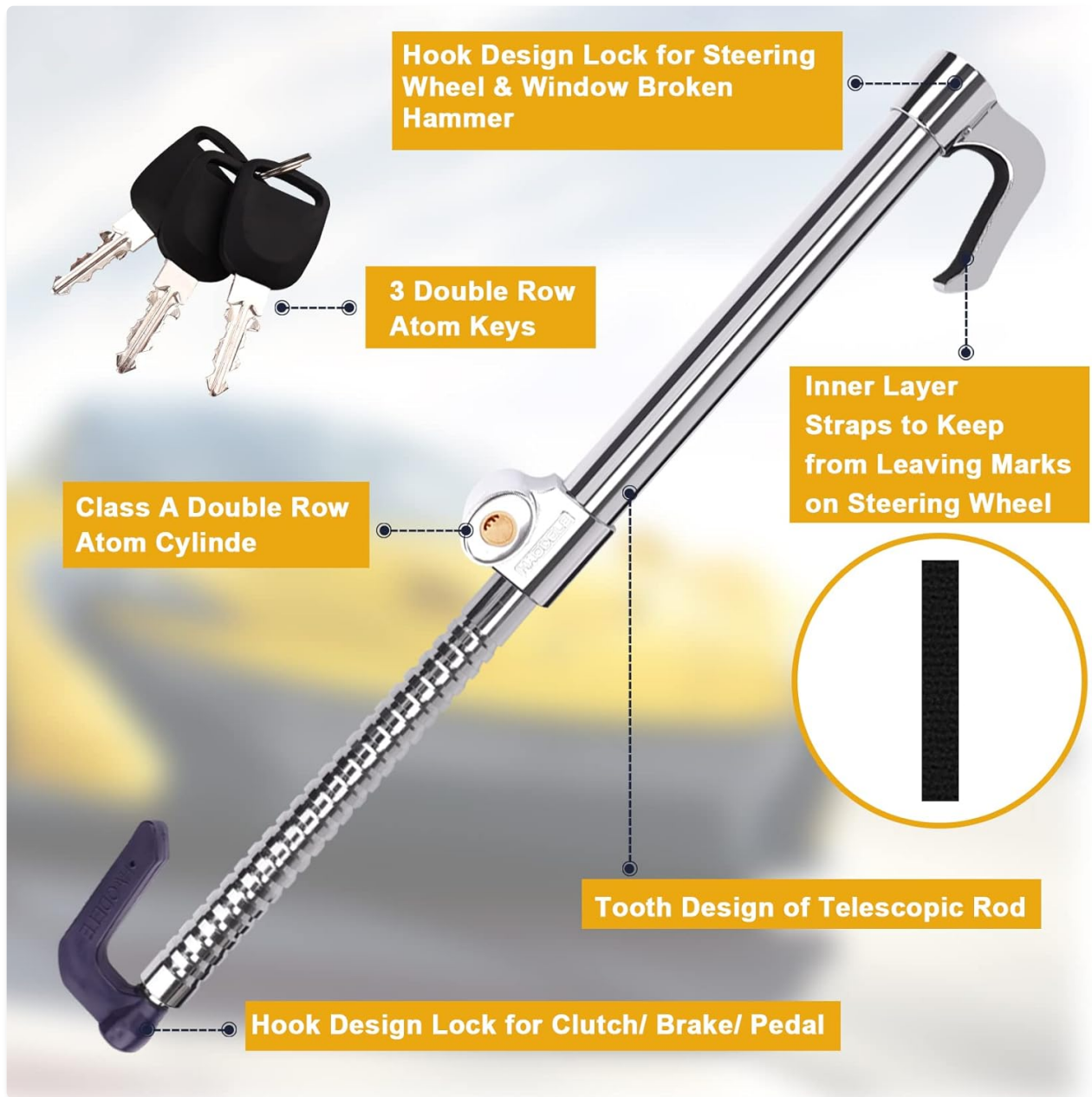
Image: Key features and components of the Tevlaphee Steering Wheel Brake Lock.