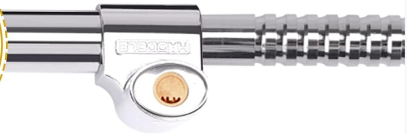
Image: Details of the advanced key and lock cylinder for anti-theft.