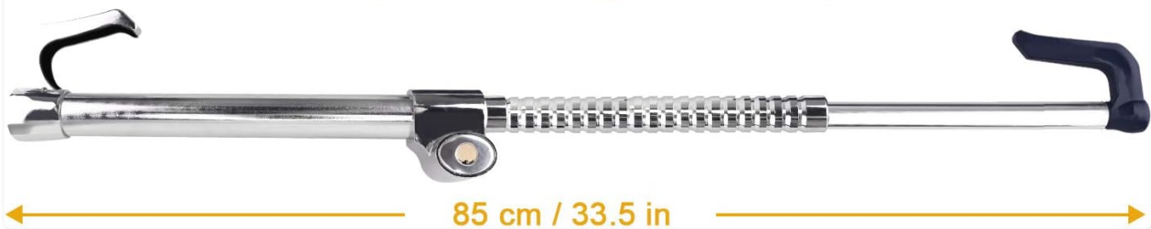
Image: Adjustable length measurements of the lock.