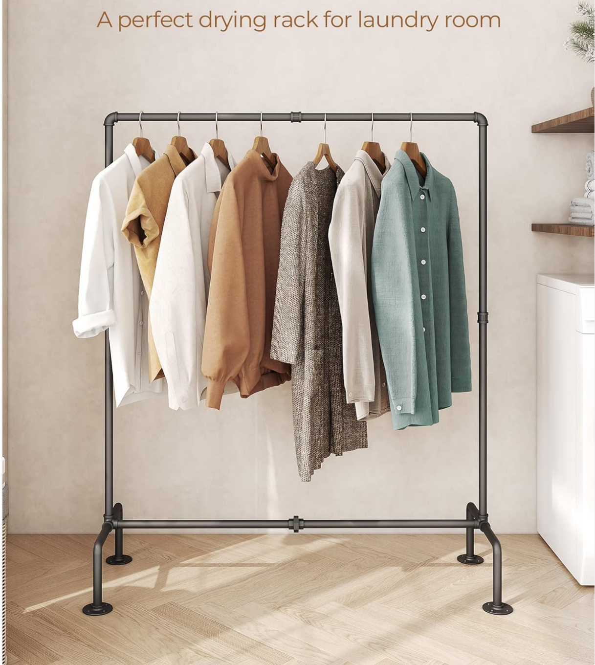
Image: Rack in a living room, keeping everyday wear accessible.