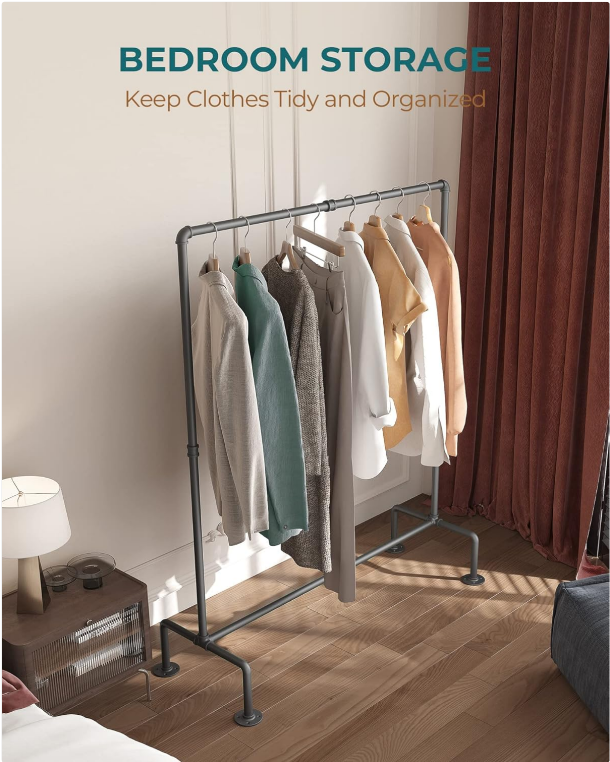
Image: Rack providing additional bedroom storage to keep clothes tidy.