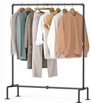
Image: Dimensions and Load-Bearing Capacity.