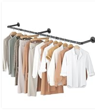
Image: Thickened Carbon Steel and Layers of the Clothes Rail Pipe.