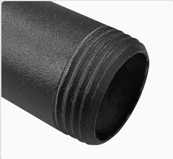
Precise Thread Cutting