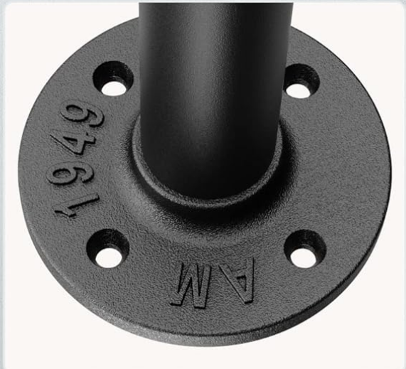
Sturdy Flange Base

Image: Rack used for laundry room storage, ideal for drying clothes.