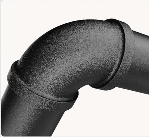
Matte Black Paint