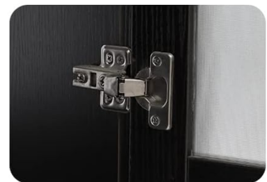
Durable Stainless Steel Soft Close Hinge