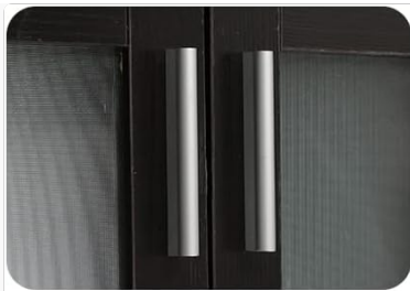
Aluminum Alloy Door Handle