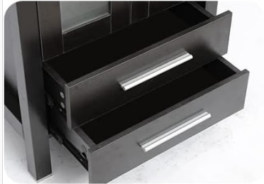
Classic Double Large Capacity Drawer