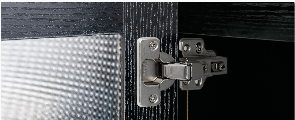
Figure 4.2: Adjustable hinges allow for precise door alignment after assembly.

Your browser does not support the video tag.