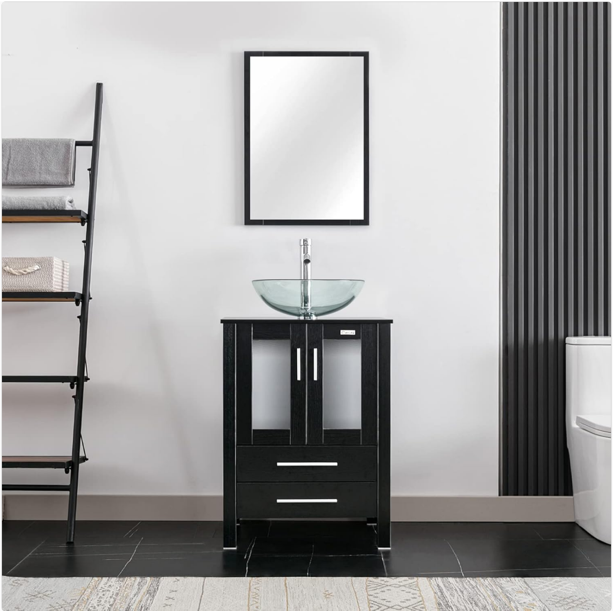
Figure 2.1: The eclife 24-inch Modern Bathroom Vanity Sink Combo in a contemporary bathroom setting.