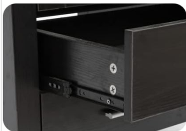
Heavy Duty Smooth Full Extension Slide