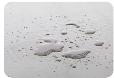
Water Proof Top