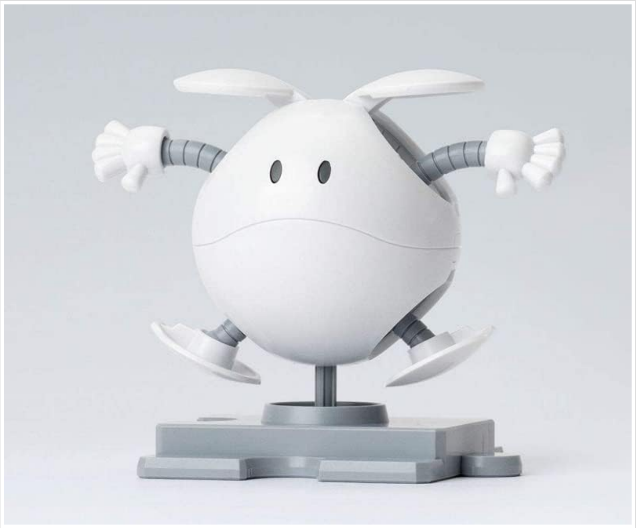
Image: An assembled white Haro model, showcasing its simple, spherical design with small arms and legs.