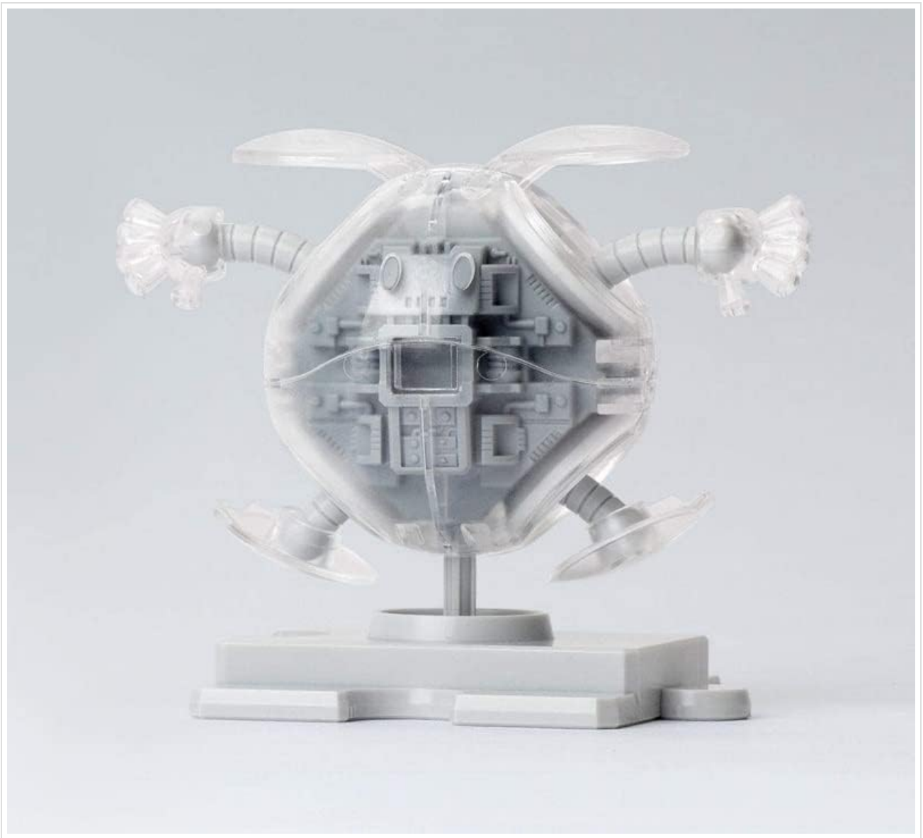
Image: An assembled clear Haro model, providing a view of the internal mechanical details and frame.