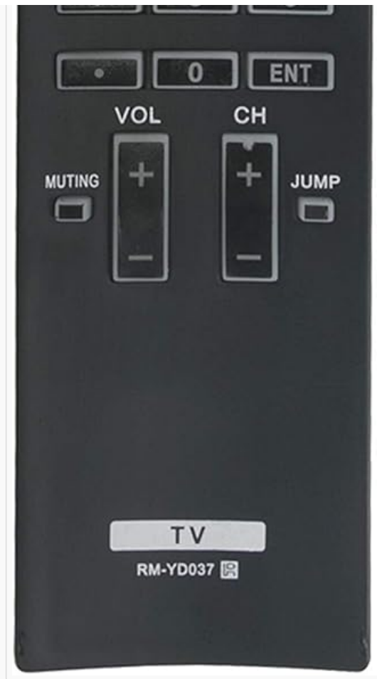
Image 3.1: Top-down view of the remote control, illustrating the button layout and general design.