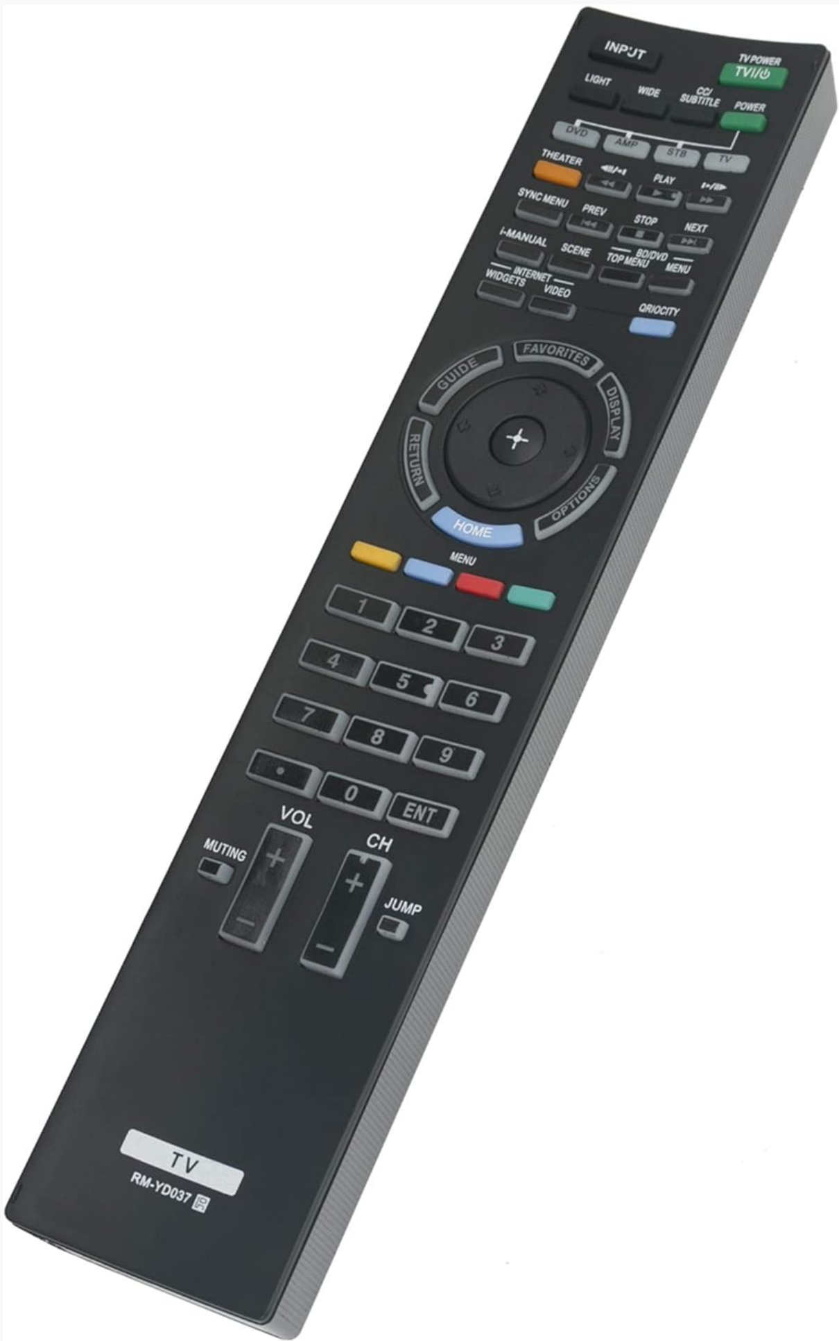
Image 2.1: Angled view of the VINABTY RM-YD037 remote control, showing its overall shape and button layout.