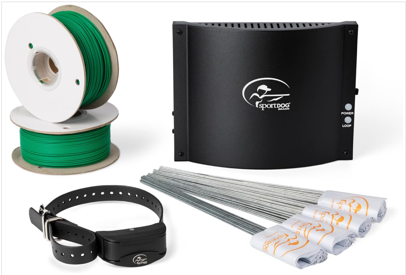
The complete SportDOG In-Ground Fence System kit, ready for installation.