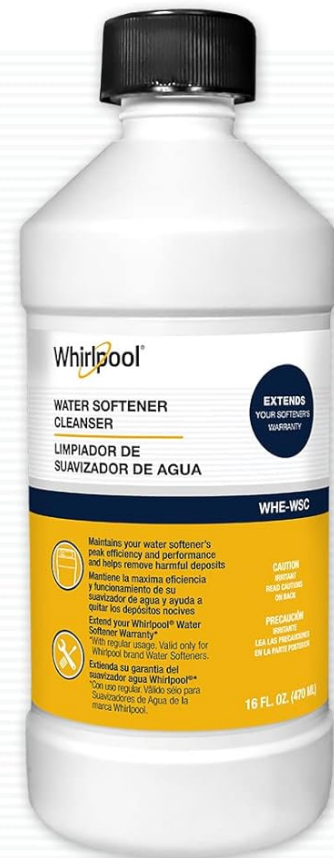
Figure 5: Information on maintaining your water softener, including the recommended cleanser.

*With regular use of WHEWSC Cleanser. See owner's manual for details.