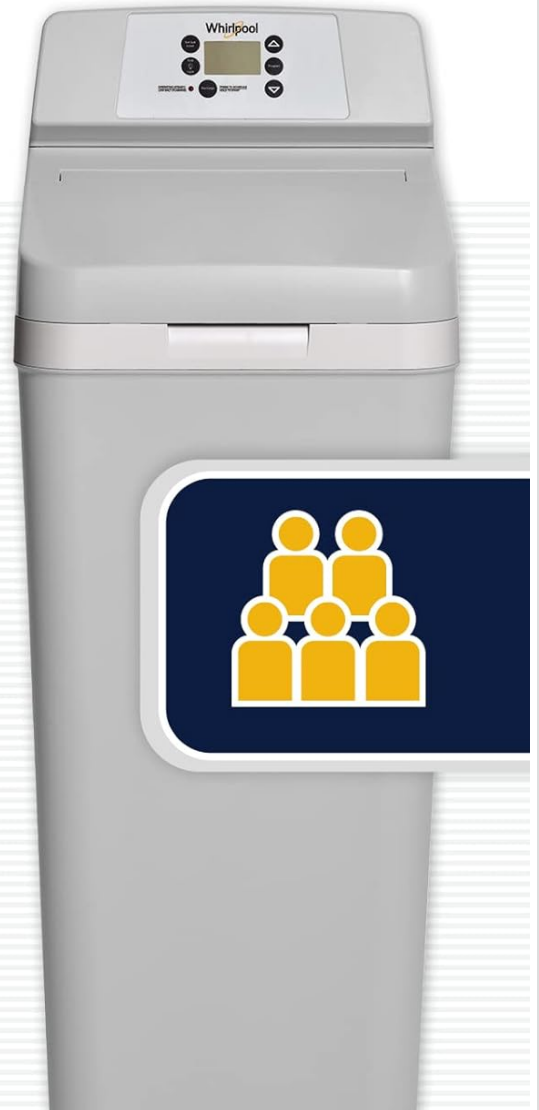
Figure 3: Key features of the Whirlpool WHES40E, including the low salt indicator light.