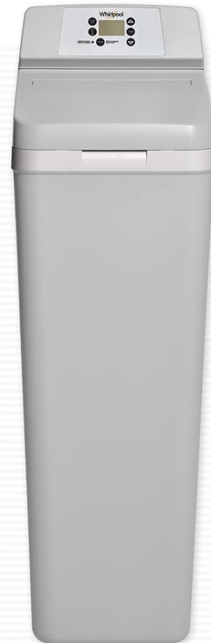
Figure 6: Unit dimensions for planning installation space.