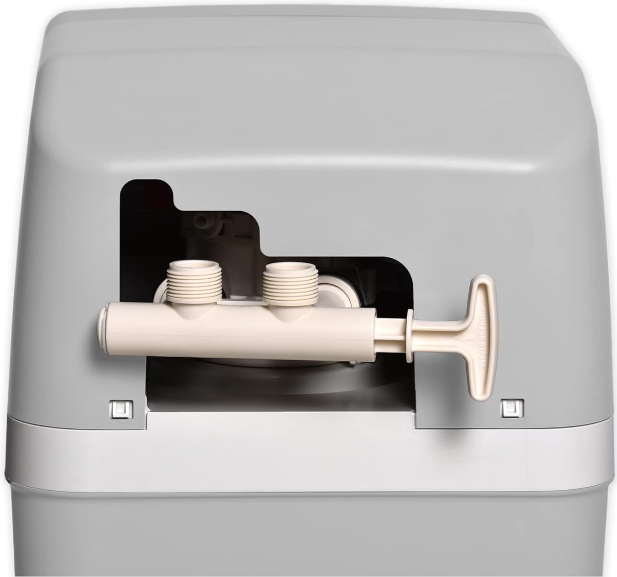
Figure 2: Back view of the softener showing the bypass valve connections.

Your browser does not support the video tag.