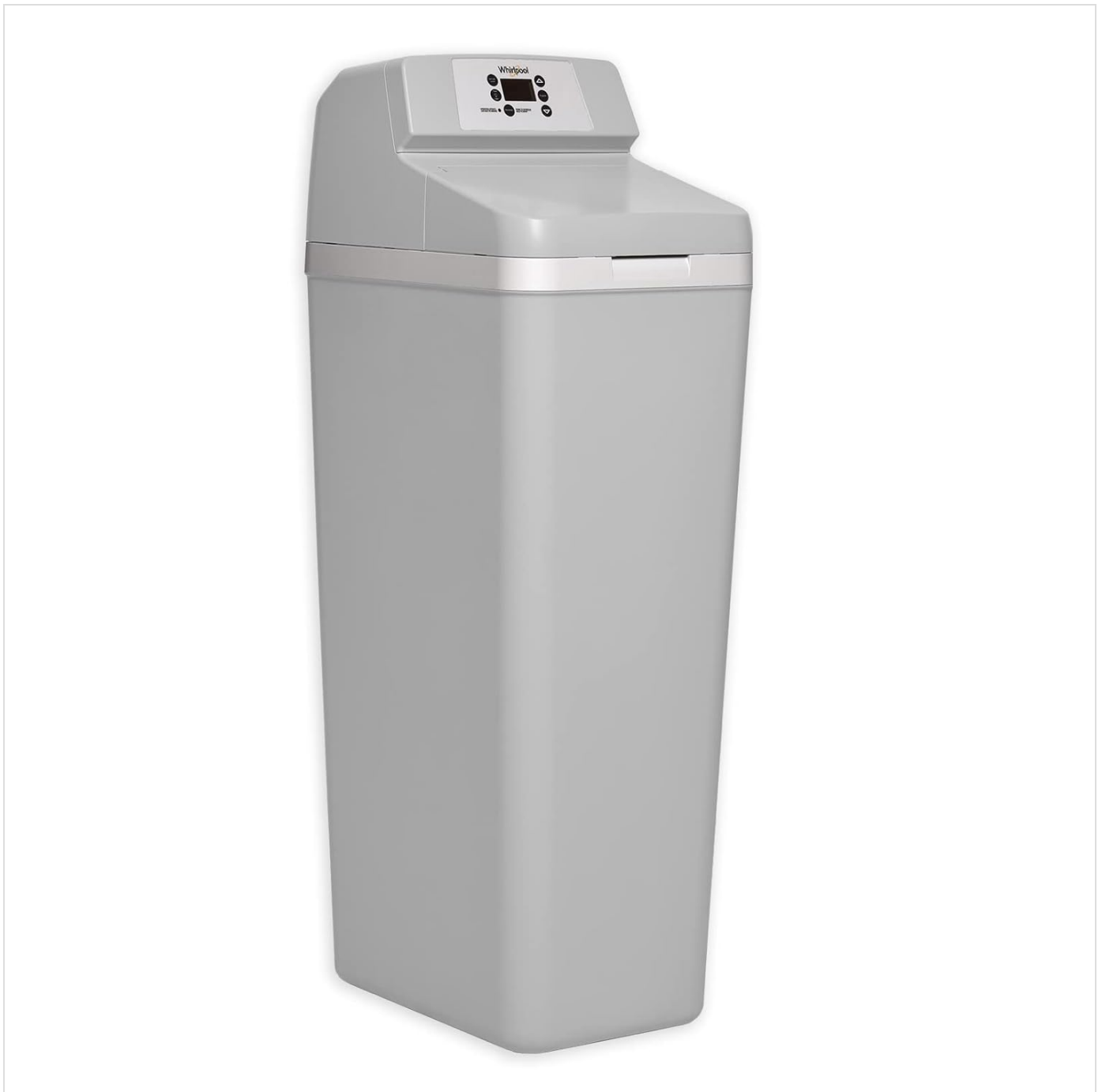
Figure 1: Front view of the Whirlpool WHES40E 40,000 Grain Water Softener.