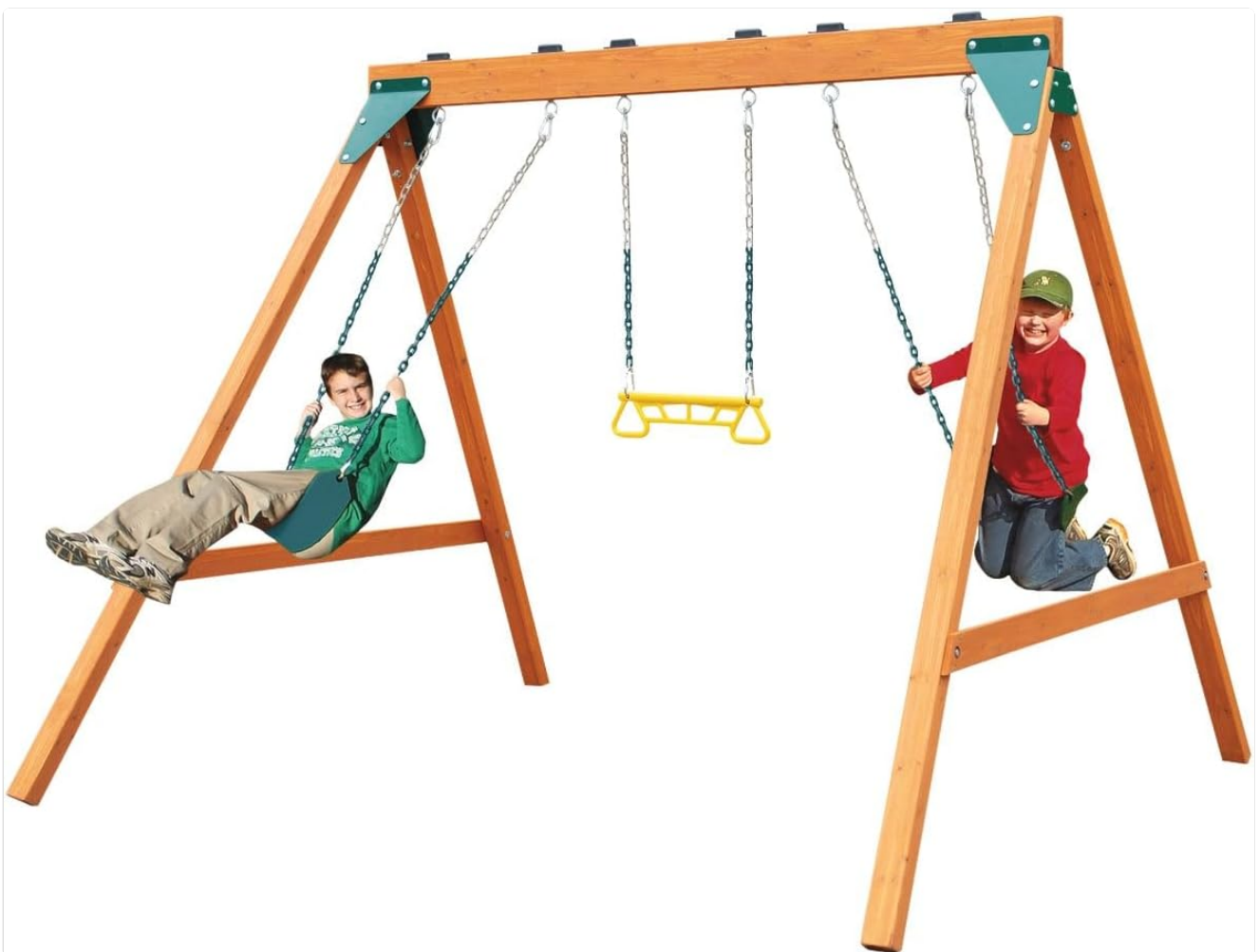
Image: The assembled wooden swing set, featuring two swing seats and a trapeze bar, ready for use.

Video: Shows the assembly process and the completed swing set in a backyard setting.