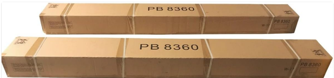
Image: Contents are packaged in two boxes, clearly labeled with the model number PB 8360.