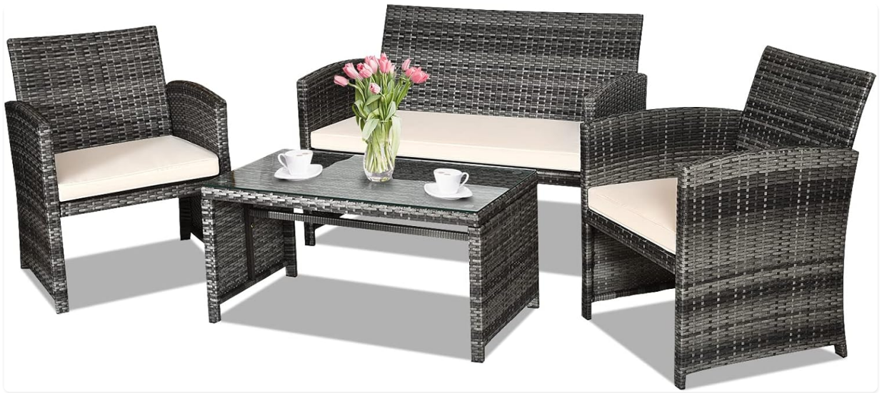
Image: The complete Goplus 4-Piece Rattan Patio Furniture Set, showcasing the loveseat, two single chairs, and coffee table with beige cushions.