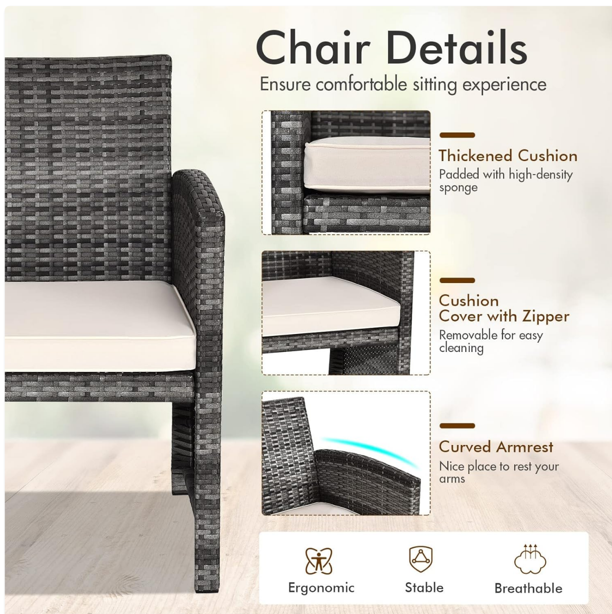
Image: Close-up showing the chair details, including the thickened cushion, zippered cover, and curved armrest, along with assembly diagrams.

7. Place Cushions: Position the soft cushions onto the seats of the chairs and loveseat.