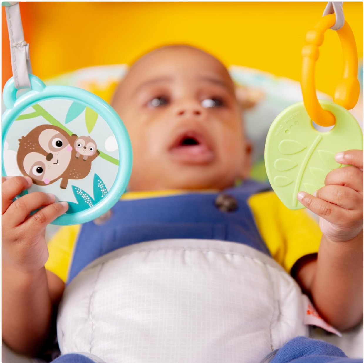
Figure 4: Detailed view of the interactive hanging toys.