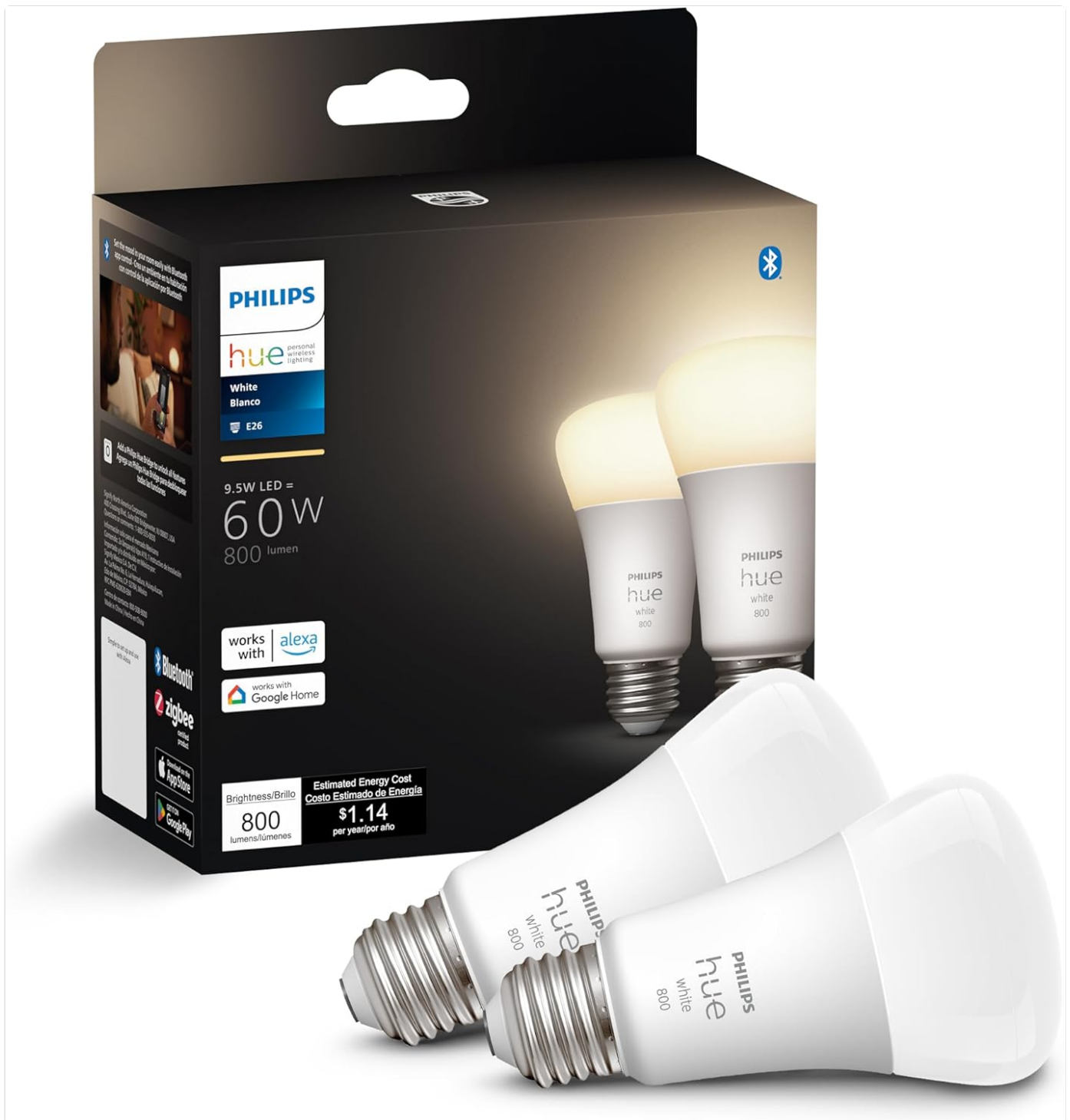
Image: Philips Hue Smart 60W A19 LED Bulb, showing the product packaging and two individual bulbs.