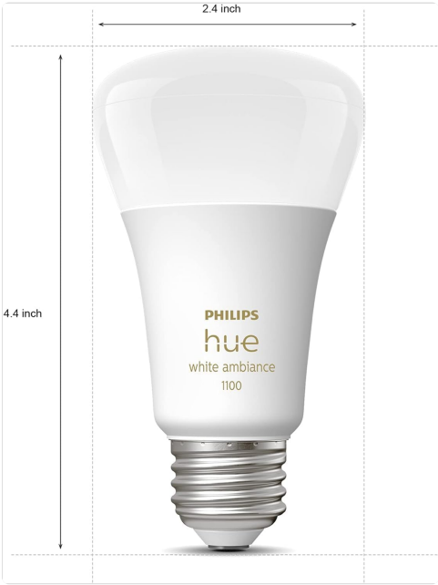
Image: Physical dimensions of the Philips Hue A19 LED bulb.