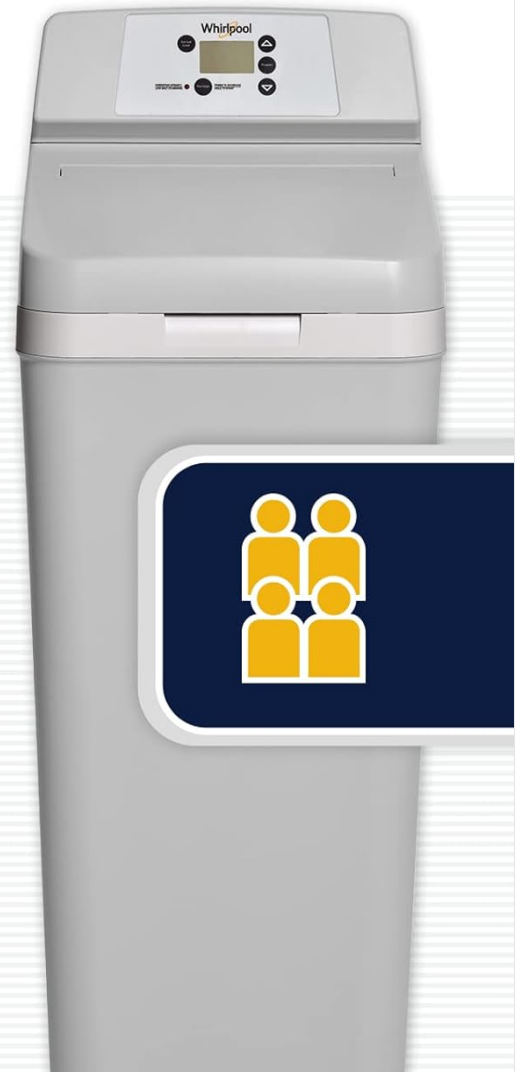
Figure 2: Key features of the Whirlpool WHES30 water softener.