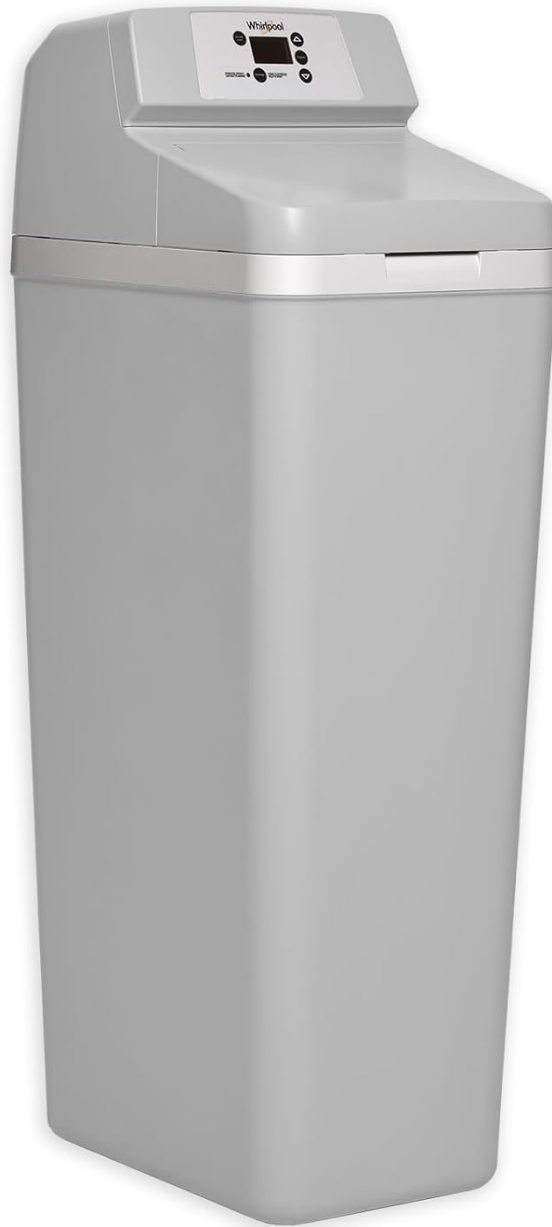
Figure 1: Front view of the Whirlpool WHES30E water softener.