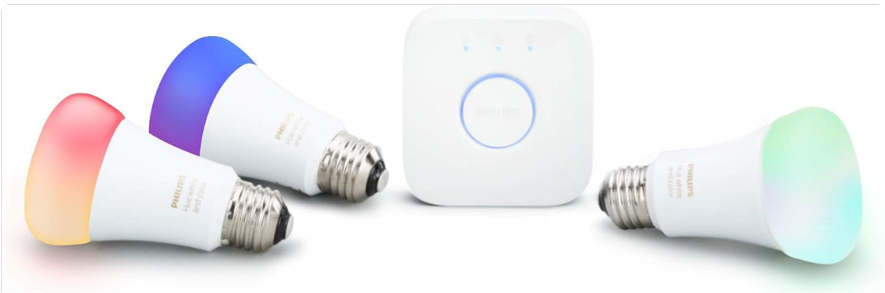
Image: The Philips Hue Starter Kit, showing three A19 smart bulbs and the central Hue Hub.

This manual provides instructions for the Philips Hue White and Color Ambiance LED Smart Light Bulb Starter Kit, Model 554840. This kit includes smart, energy-efficient LED bulbs and a Hue Hub, designed for easy setup and integration with smart home systems such as Amazon Alexa, Apple HomeKit, and Google Assistant. The system allows for control over lighting, including setting timers, routines, and adjusting light schedules. The Hue Hub supports a comprehensive lighting experience for up to 50 light points, suitable for both indoor and outdoor use.