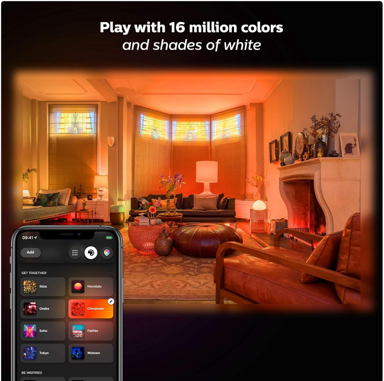
Image: The Philips Hue app displaying color options, with a living room scene demonstrating the use of 16 million colors and shades of white.

Play with 16 million colors and shades of white