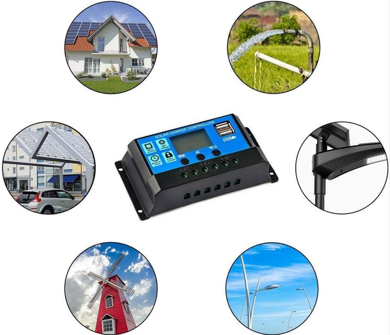
Figure 1: The Y&H RBL-30A-DE Solar Charge Controller is versatile for various applications such as farm solar power systems, street lights, patio lights, billboards, outdoor camping, and marine solar systems.