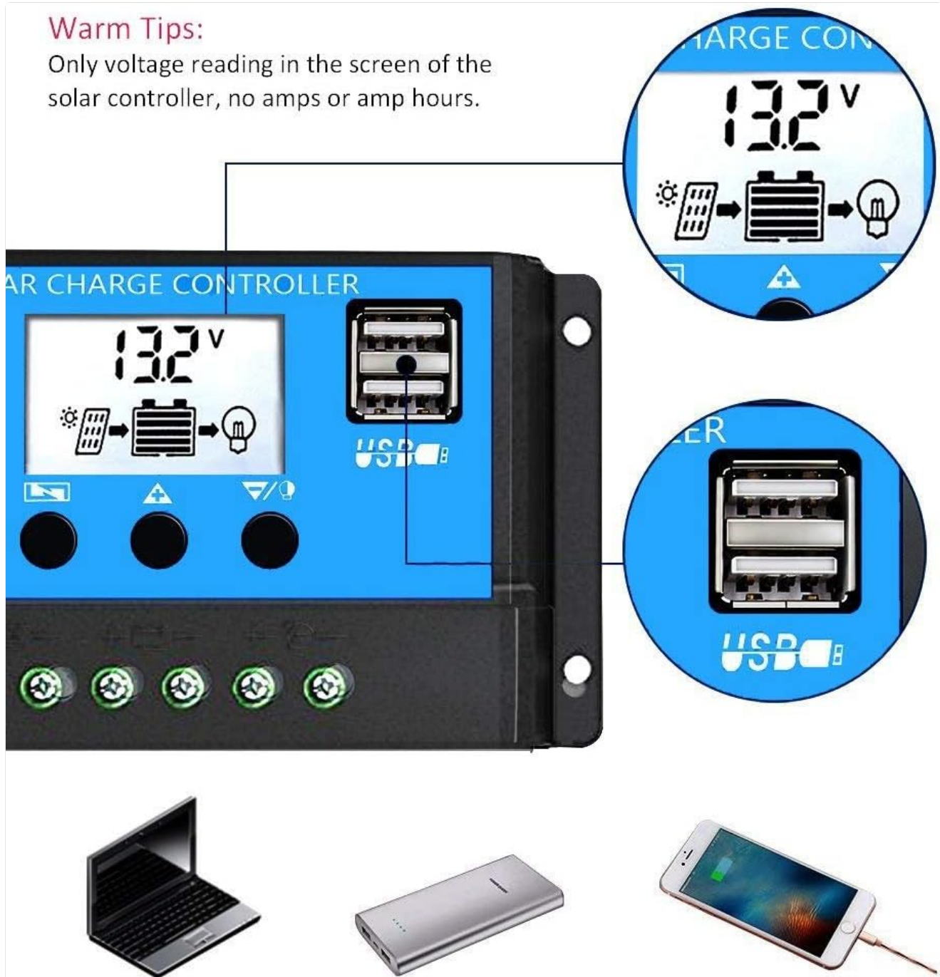
Figure 3: Detail of the dual 5V/2A USB output ports, suitable for charging various portable electronic devices.

Only voltage reading in the screen of the solar controller, no amps or amp hours.