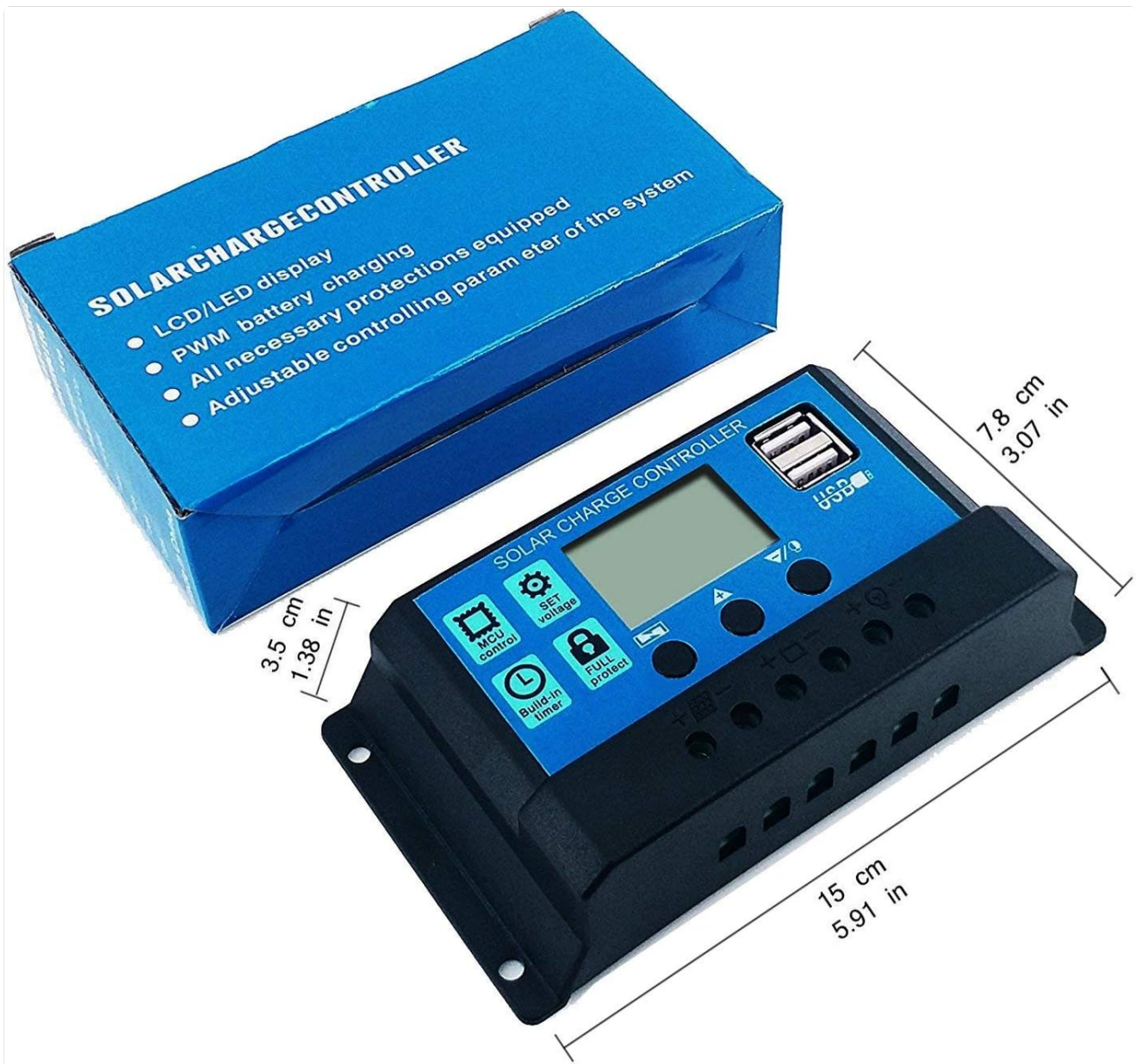
Figure 7: Physical dimensions of the controller: 15 cm (5.91 in) length, 7.8 cm (3.07 in) width, and 3.5 cm (1.38 in) height.