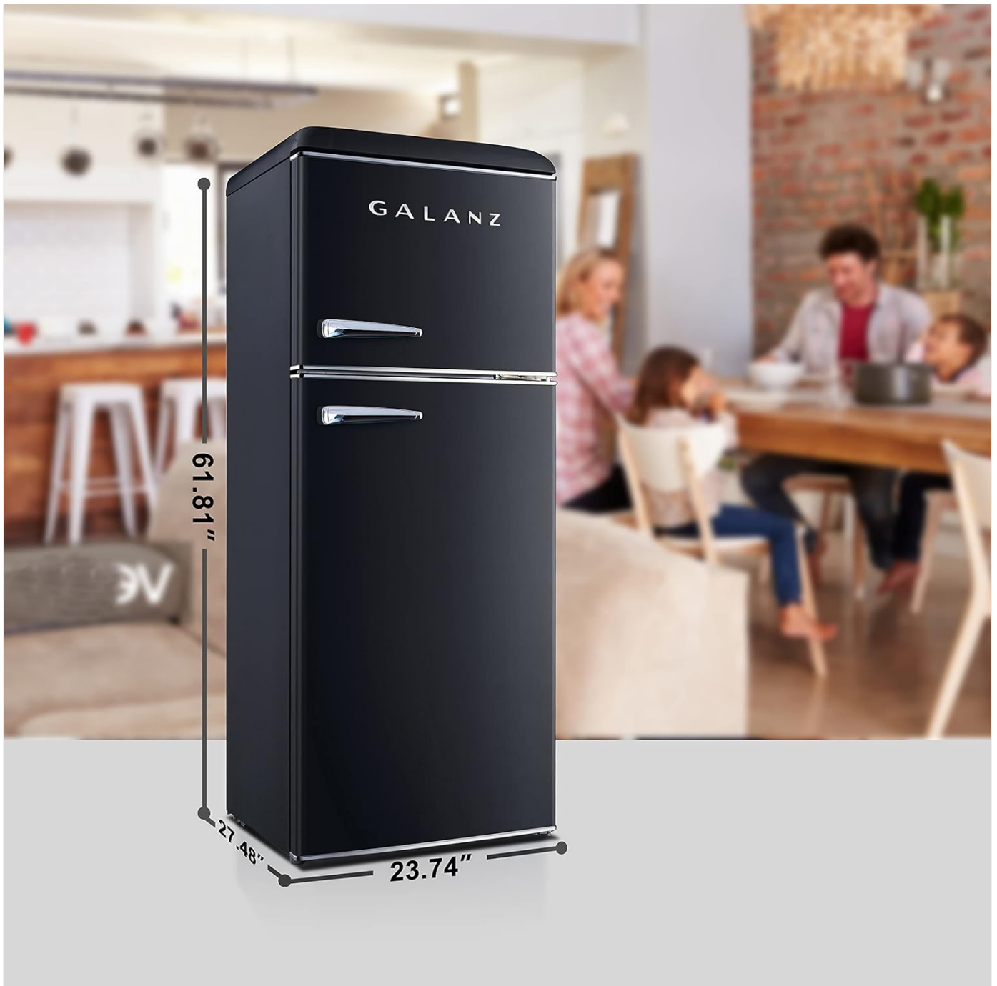
Image: Refrigerator dimensions for proper placement.