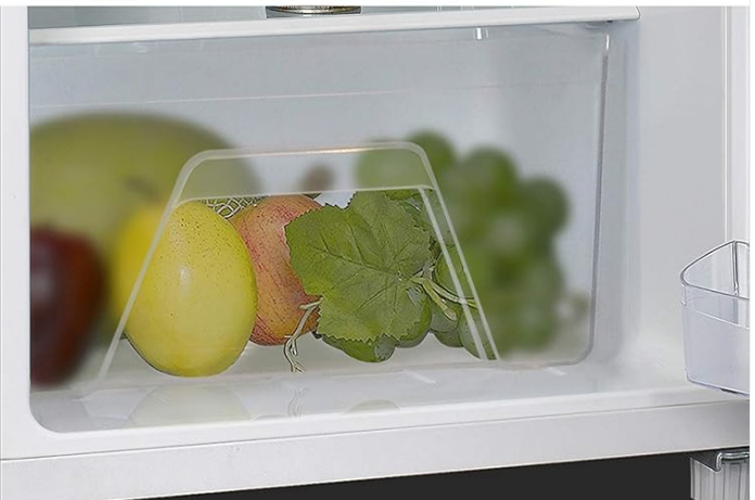
Image: Adjustable Electrical Thermostat Control and interior features.