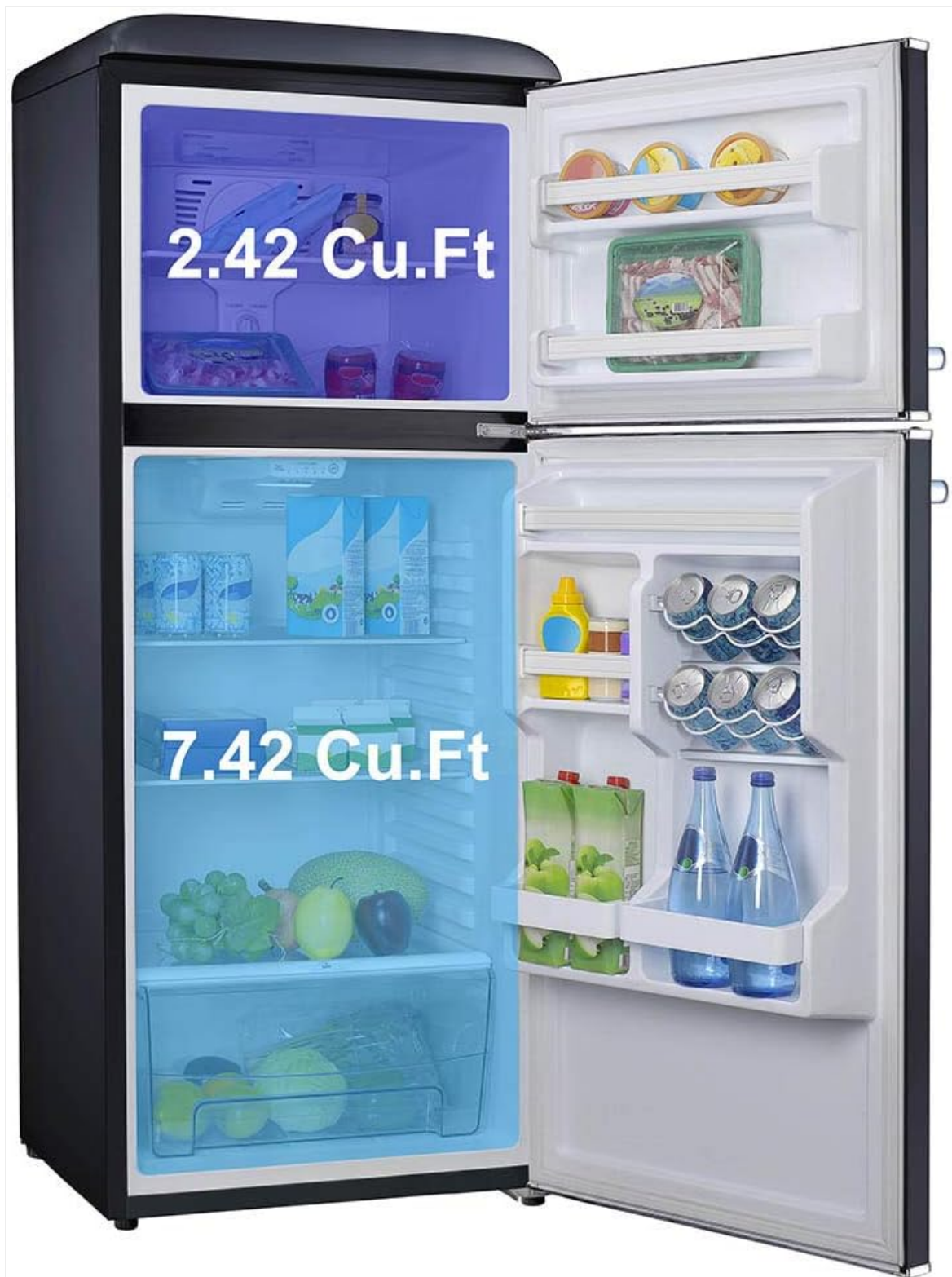
Image: Interior layout and storage capacity of the refrigerator.