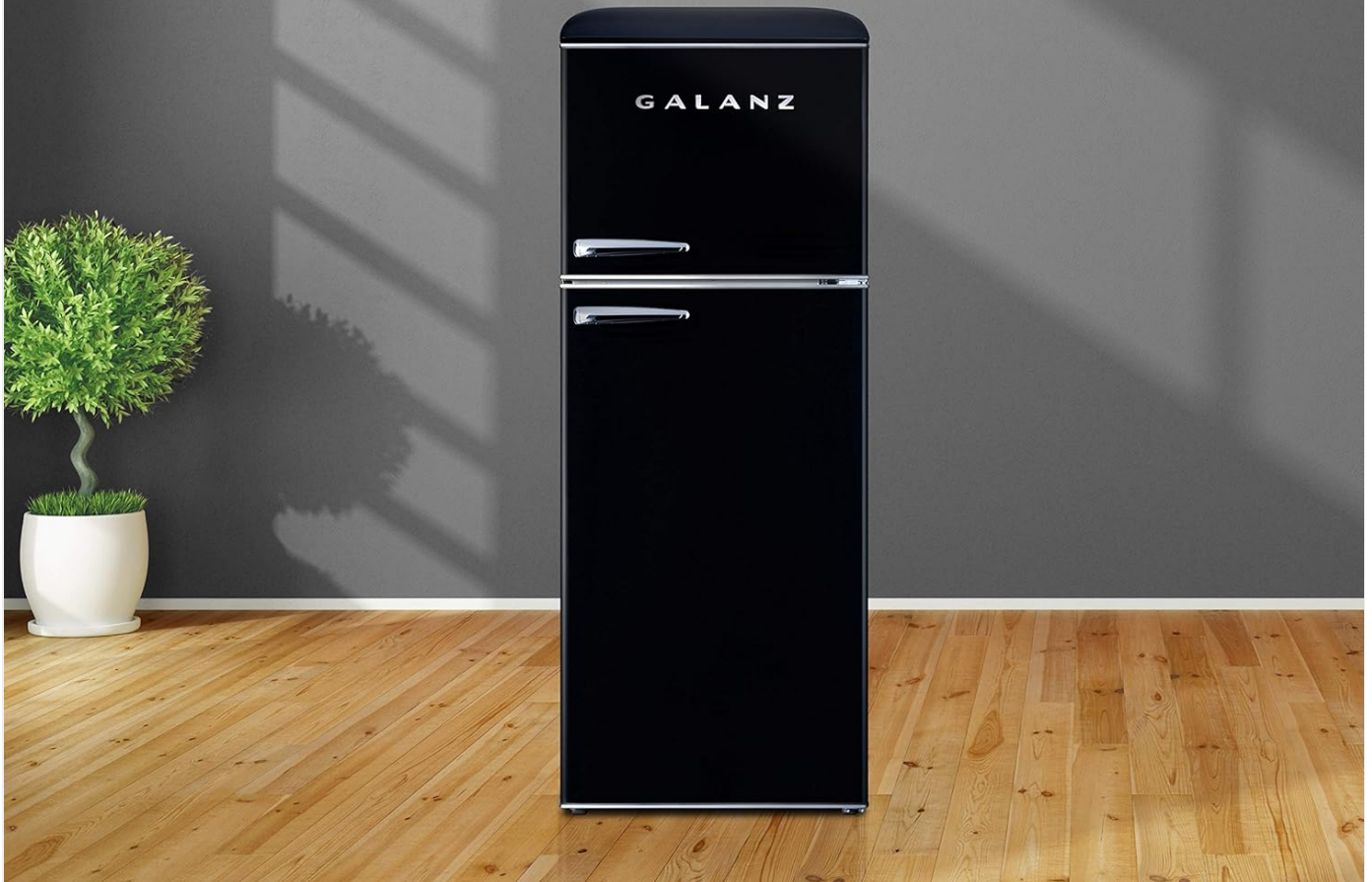
Image: Front view of the Galanz GLR10TBKEFR Retro Refrigerator, showcasing its retro black design and key features.