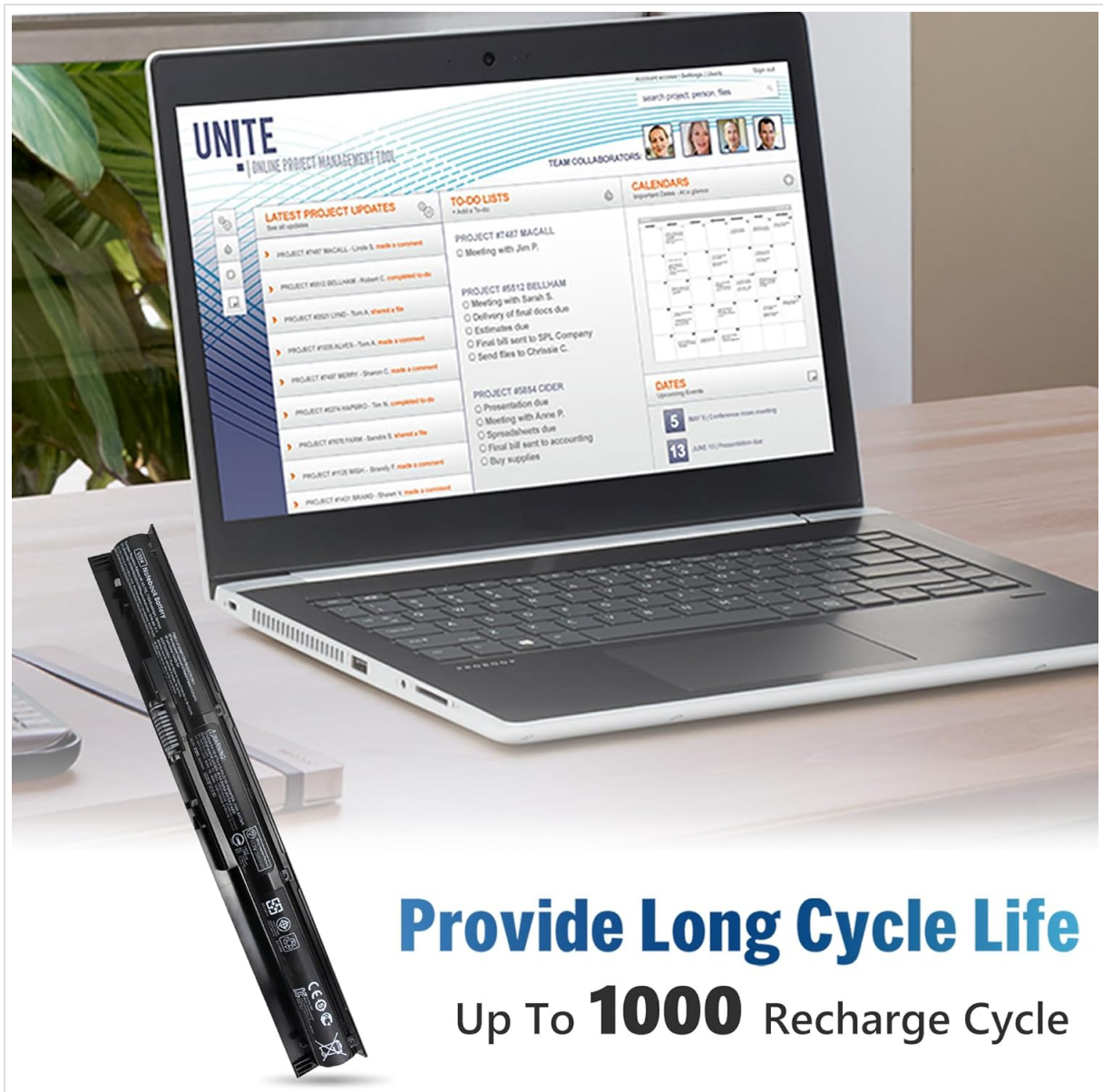
Image: Battery in use, highlighting long cycle life

This initial charge and discharge cycle helps calibrate the battery's fuel gauge, providing more accurate battery life readings.