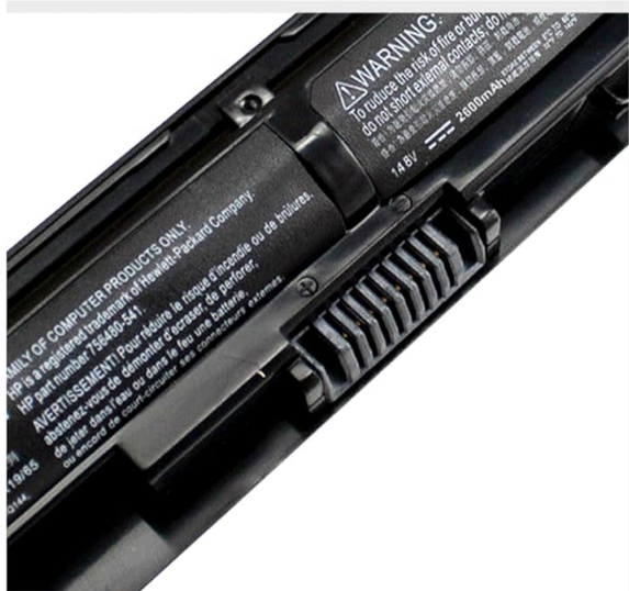
Durable Power Interface