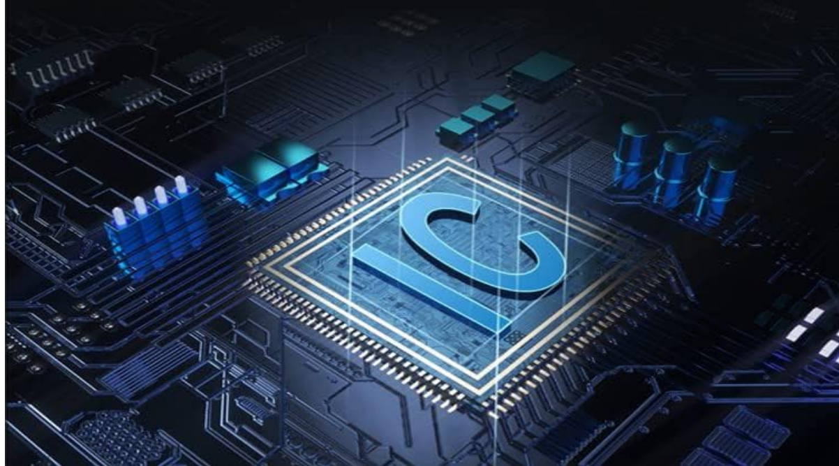
Image: Advanced Safety Features