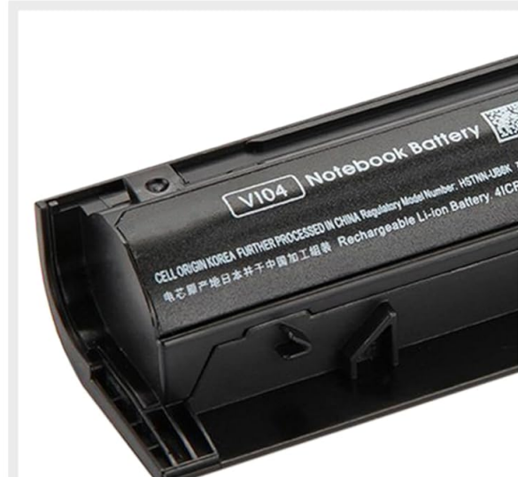
Strong ABS+PC Shell

Image: Battery Features (Power Interface, Shell)