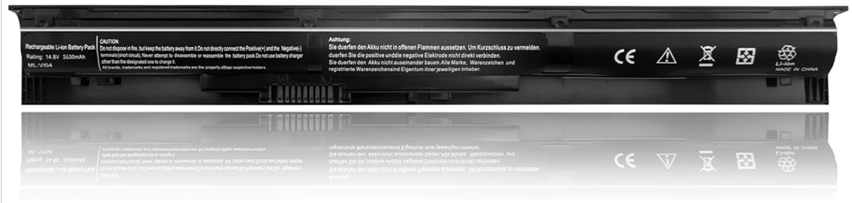
Image: Battery Specifications