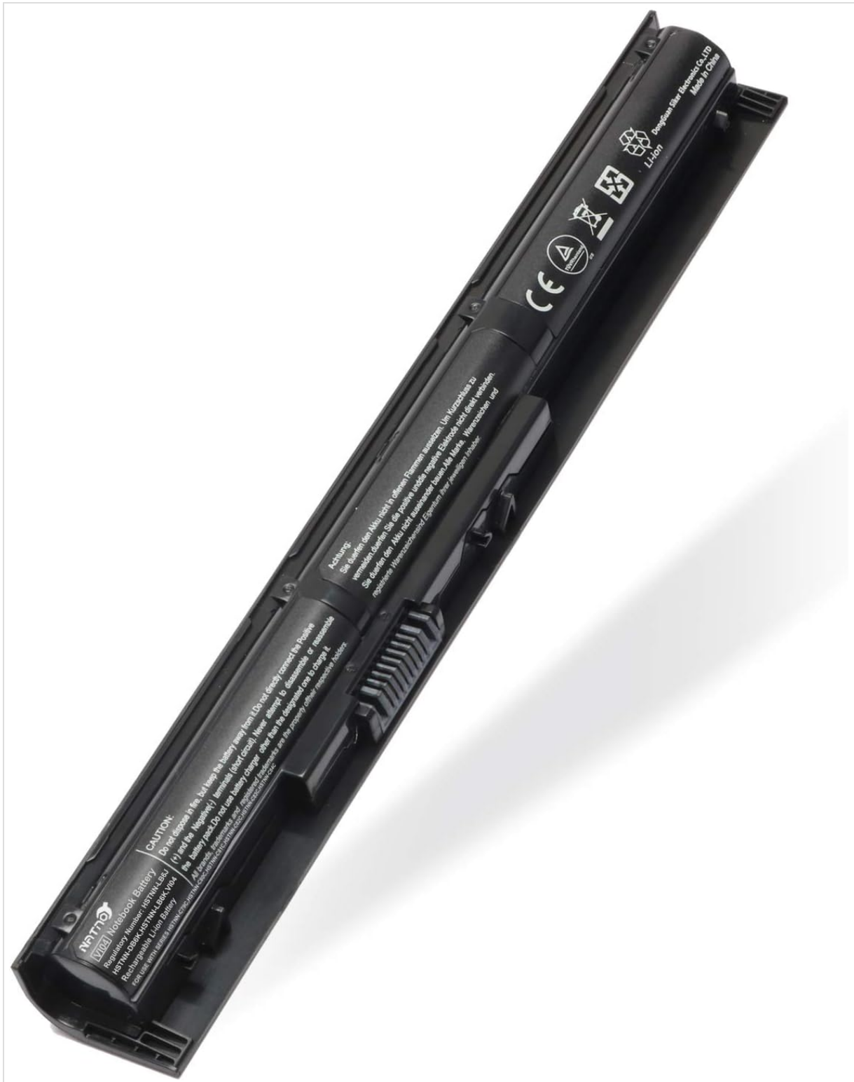
Image: NATNO VI04 Laptop Battery