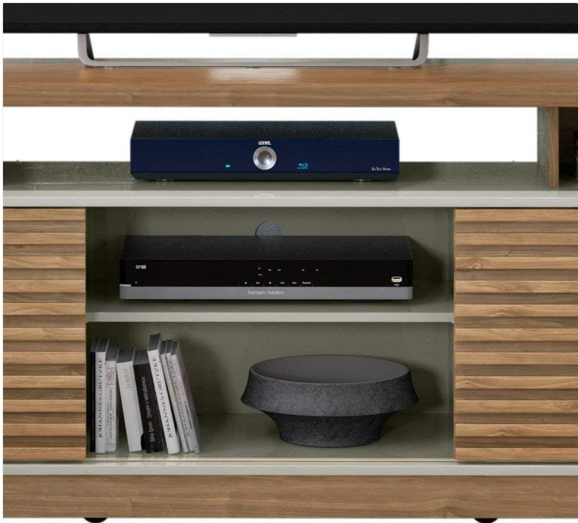
Figure 4.1: Detail showing the internal shelving and slatted door design, which will be assembled in this stage.