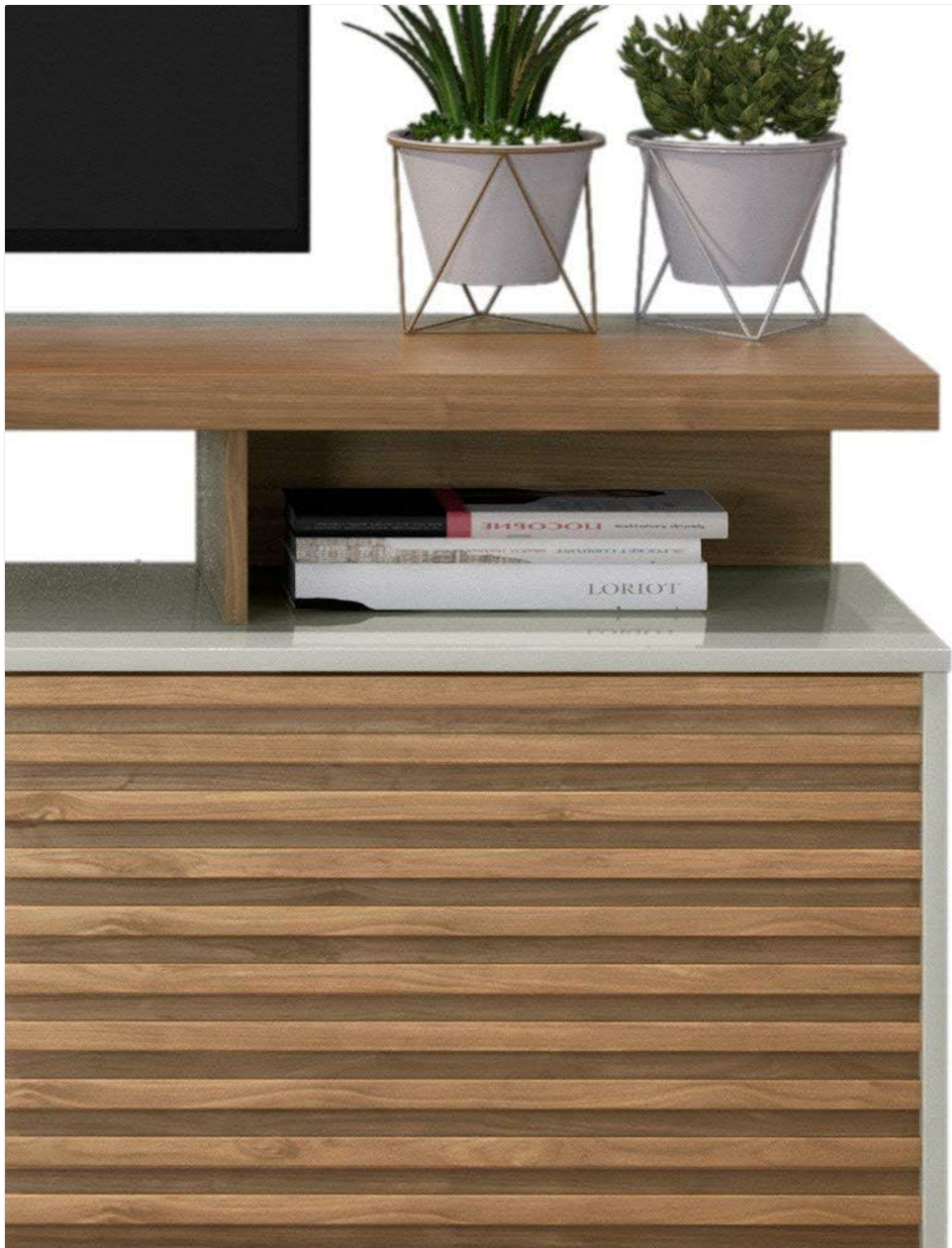
Figure 4.2: This image highlights the open shelf area and the top surface, where a TV and decorative items would be placed.