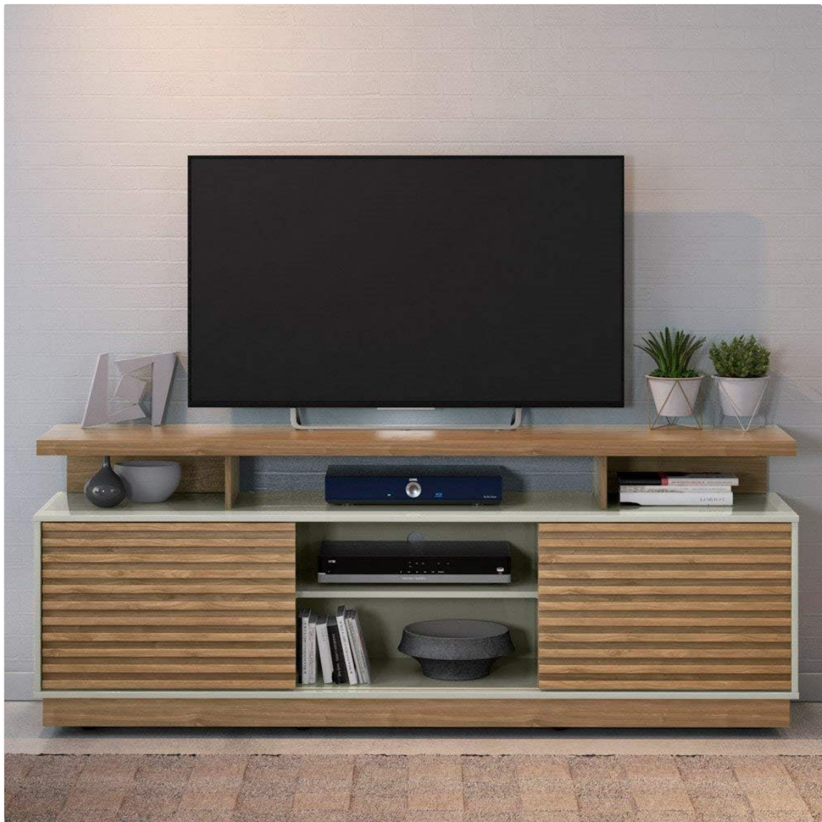
Figure 4.3: The Linea Brasil Blumenau TV Stand fully assembled and in use, showcasing its design and functionality.