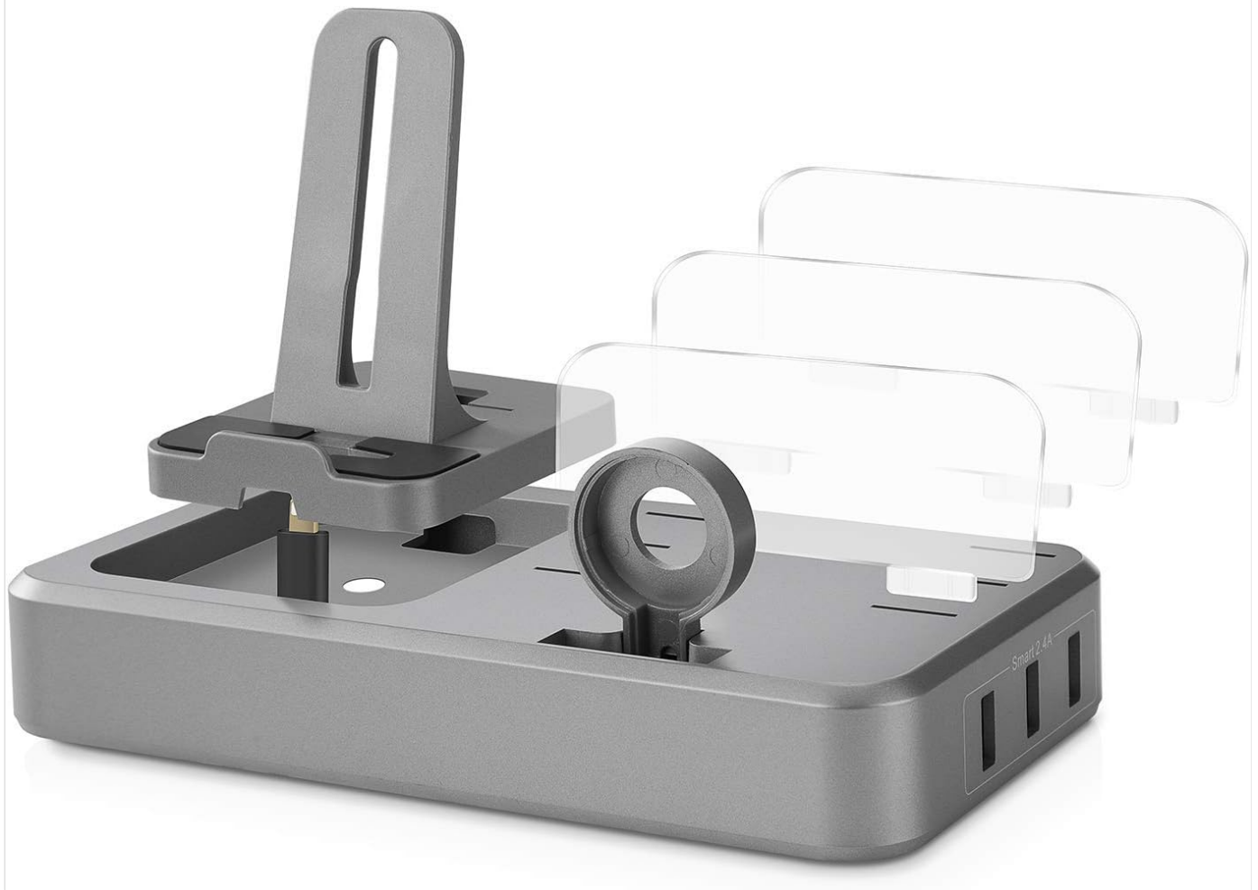
Image: A close-up view of the Sendowtek charging station demonstrating the installation of the clear detachable baffles, which allow for customizable organization of devices.