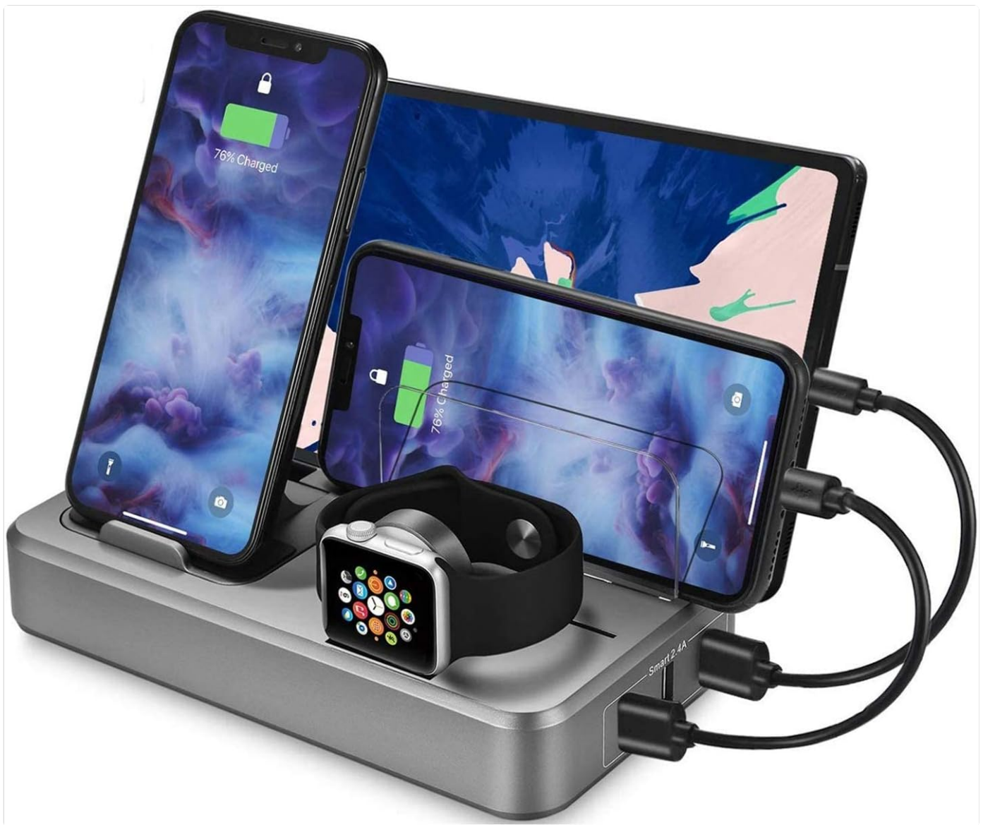
Image: The Sendowtek 5-Port 50W USB Charger Docking Station, shown with a smartphone, tablet, and smartwatch actively charging, demonstrating its multi-device capability and organized design.