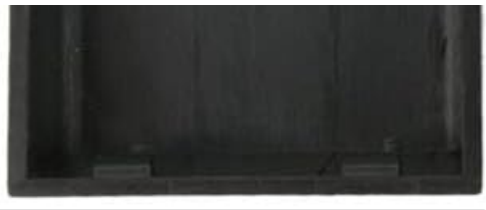
Image: Rear view of the remote control with the battery cover removed, illustrating the correct orientation for AAA battery insertion.

Important: Use only new alkaline batteries. Rechargeable batteries may not provide sufficient power for optimal performance. Ensure nothing is blocking the front of your sound bar system when using the remote.