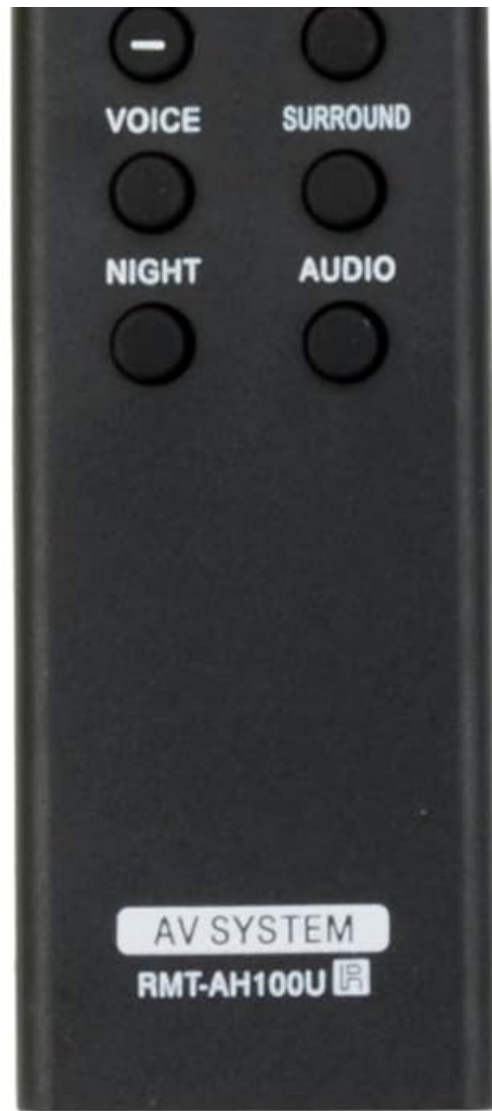
Image: Front view of the RMT-AH100U remote control, displaying the layout of all control buttons.