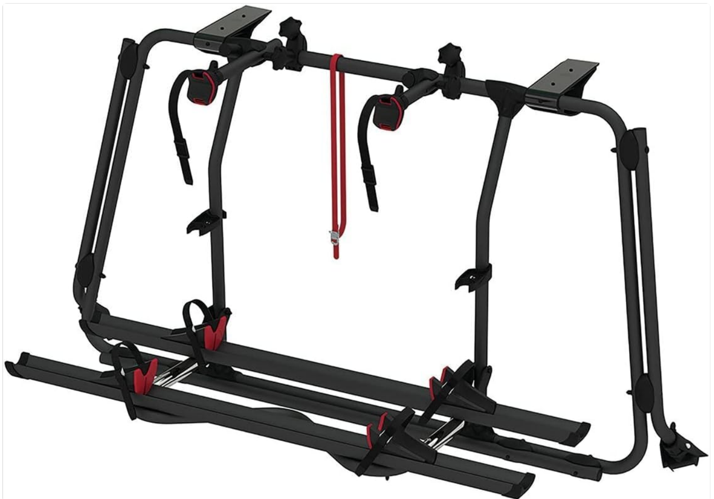
Image: The Fiamma Carry Bike VW T6 Pro Deep Black bicycle rack, ready for installation or already installed on a vehicle's tailgate. Note the robust black frame, the red securing straps for bicycles, and the two adjustable rails at the bottom for holding bicycle wheels.