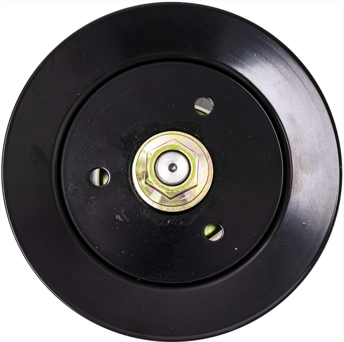
Figure 4.3: Bottom view of the 8TEN Mower Spindle.