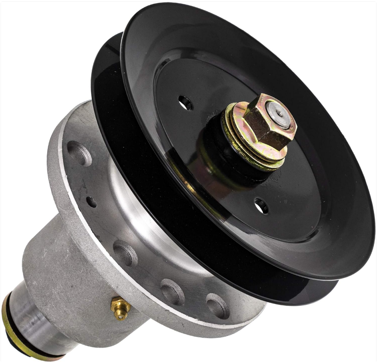
Figure 2.1: Front view of the 8TEN Mower Spindle Assembly.