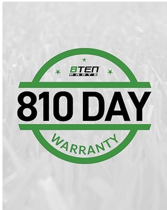
Figure 9.1: 8TEN Parts 810-Day Warranty.