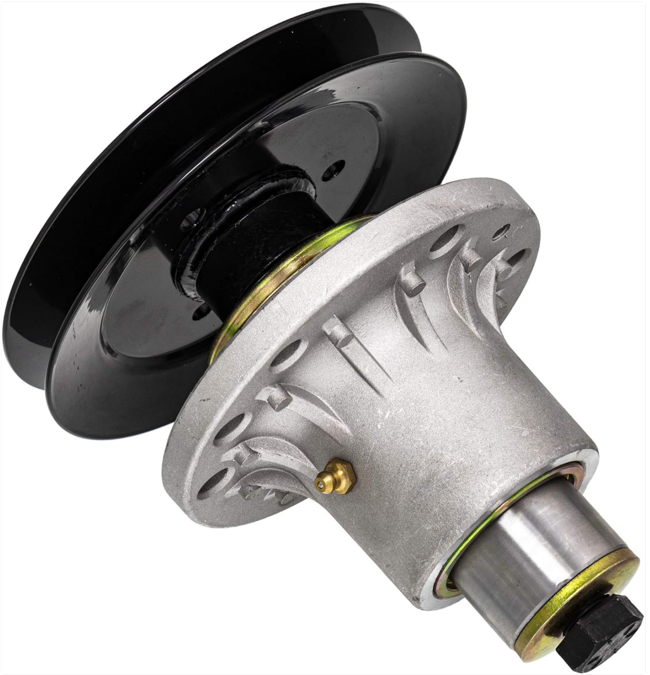
Figure 4.1: Side view of the 8TEN Mower Spindle, showing the grease zerk fitting.