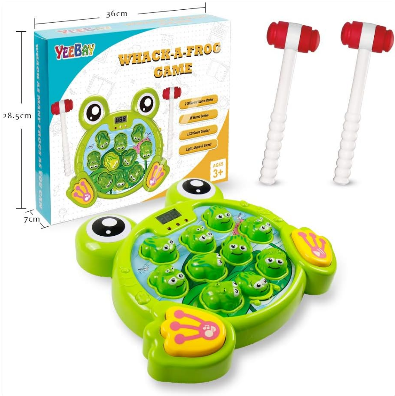
Image: Contents of the YEEBAY Whack A Frog Game package.