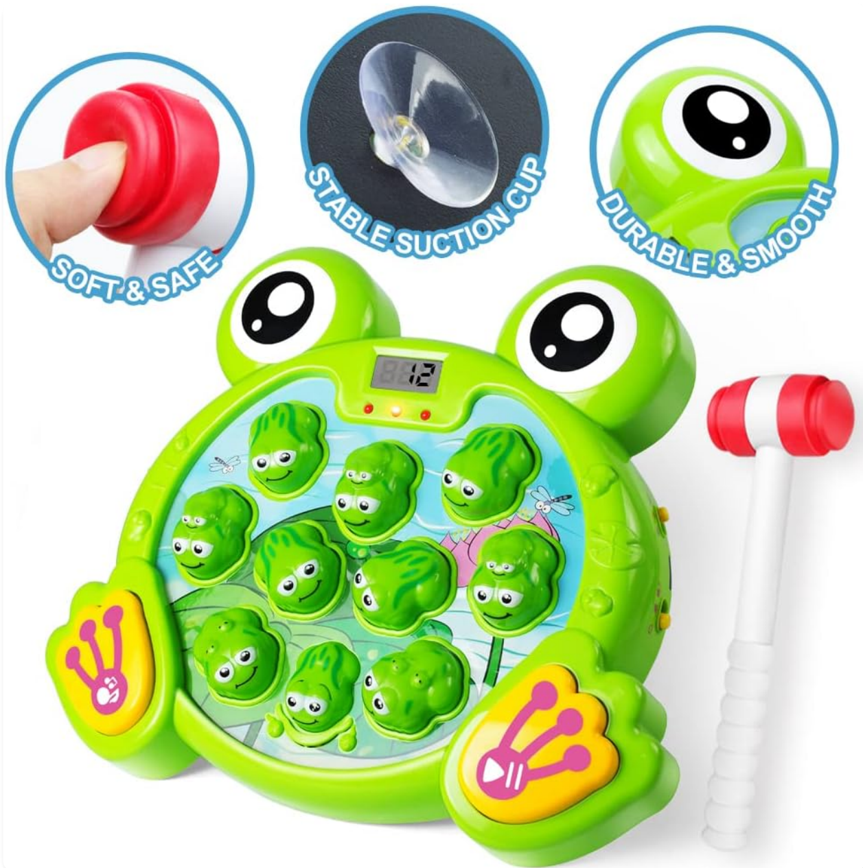
Image: Details of the game's features, including the soft hammer and suction cups for stability.