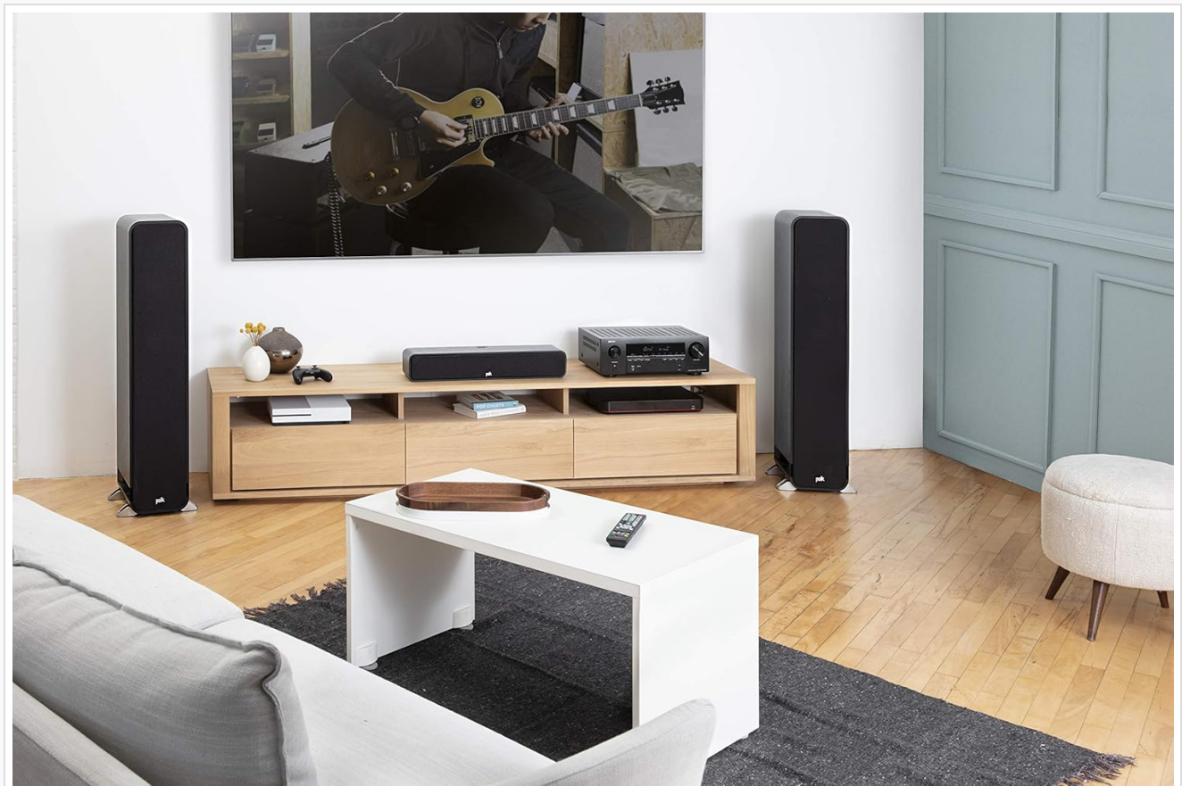
Figure 2.2: The Denon AVR-S650H integrated into a modern living room home theater setup.