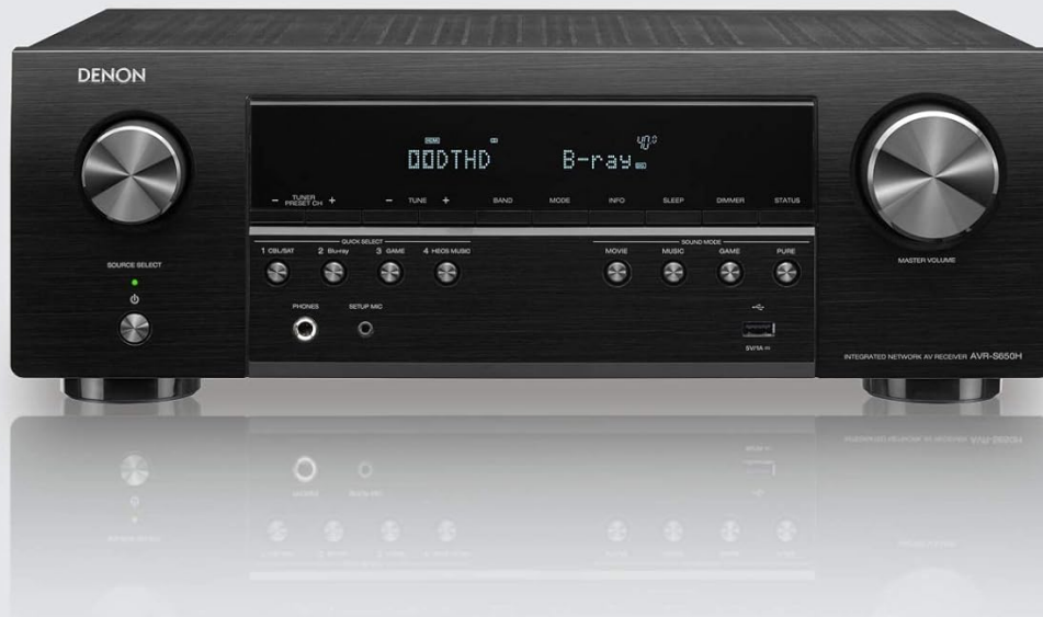
Figure 4.3: The Denon AVR-S650H displayed with logos indicating support for Dolby Audio, DTS-HD Master Audio, and Hi-Res Audio.