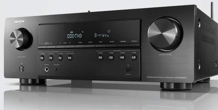
Figure 7.1: Dimensions of the Denon AVR-S650H AV Receiver.