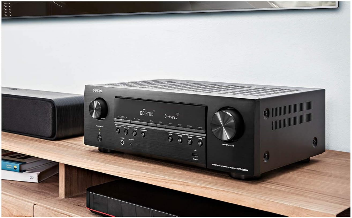
Figure 4.4: The Denon AVR-S650H highlighting its high-performance audio capabilities.