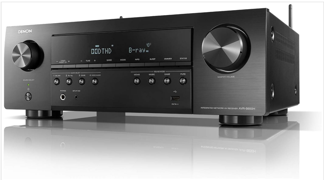
Figure 2.1: Front view of the Denon AVR-S650H AV Receiver, showcasing its sleek design and control knobs.