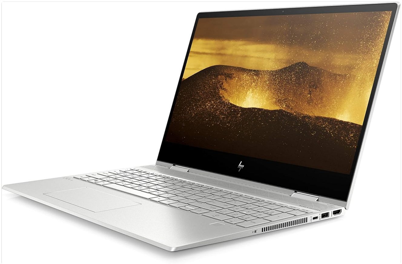
Figure 3.1: Front-left view of the HP Envy x360 laptop, illustrating the display and keyboard layout.