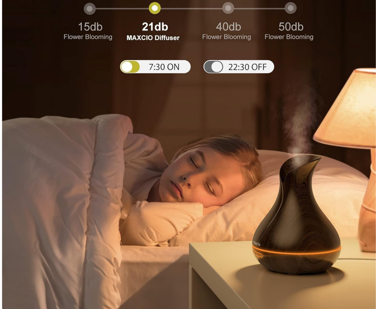
Image: The Maxcio diffuser in a bedroom setting, emphasizing its ultra-quiet operation and timer function for peaceful sleep.