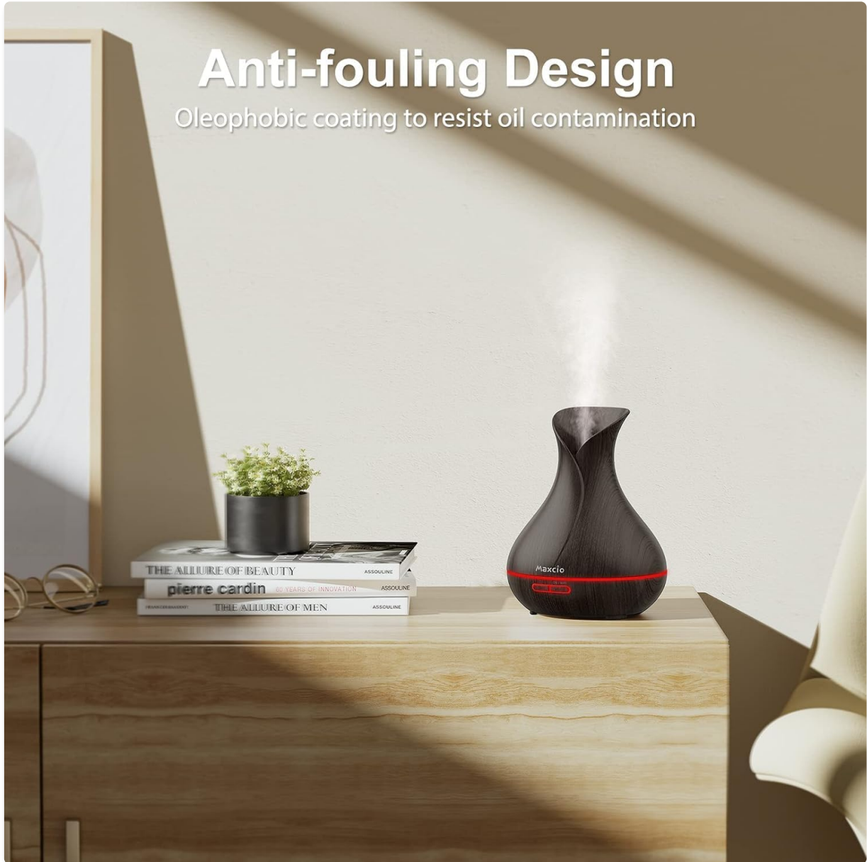
Image: The Maxcio diffuser's anti-fouling design, featuring an oleophobic coating to resist oil contamination and simplify cleaning.

When not in use for an extended period, clean the diffuser thoroughly and store it in a cool, dry place.