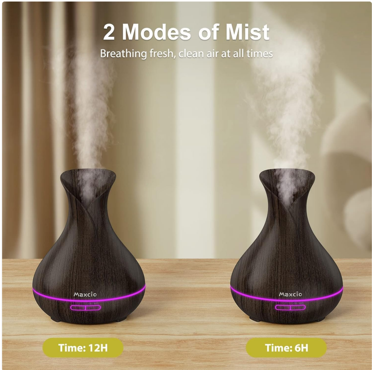
Image: Comparison of two Maxcio diffusers, illustrating the two available mist modes and their corresponding operating durations (6 hours and 12 hours).