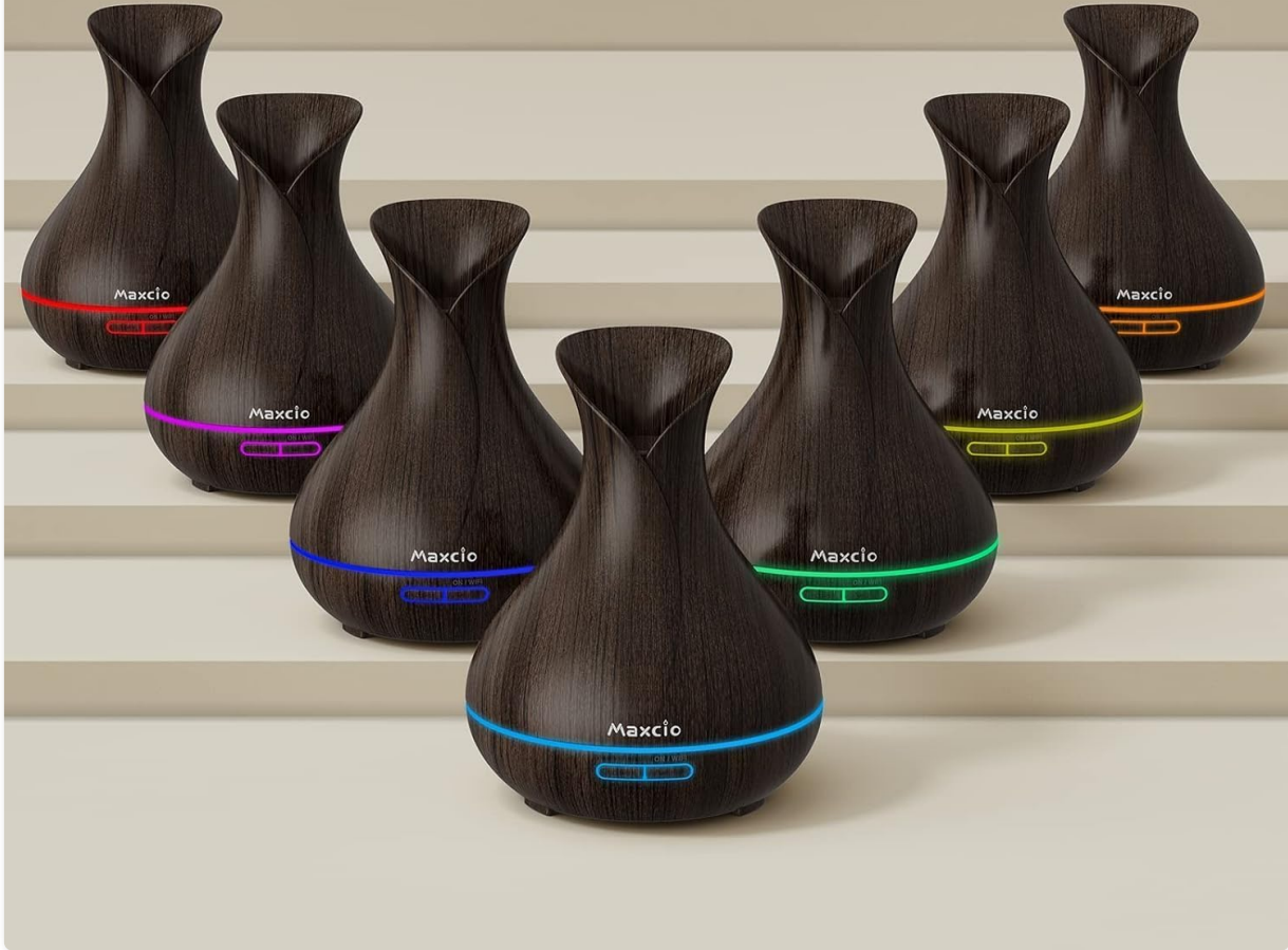
Image: A collection of Maxcio diffusers showcasing the 7 soothing LED light options, each adjustable for brightness.