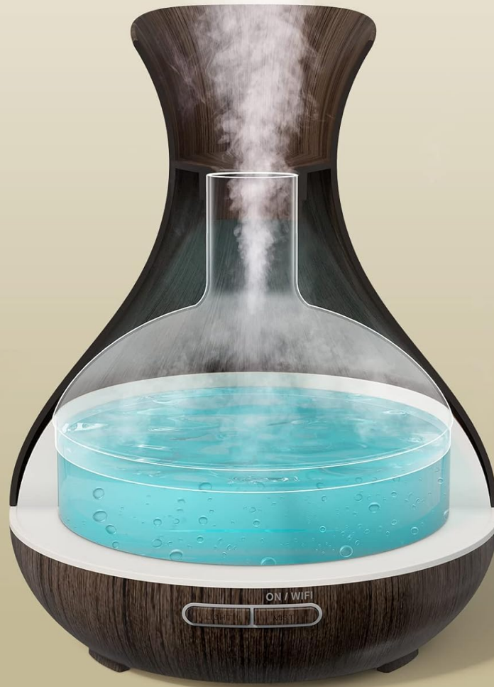
Image: Internal view of the Maxcio diffuser demonstrating its ultrasonic technology, which creates a homogeneous, fine mist to increase air humidity and disperse scent.

Homogeneous mist, tiny mist particles, increase air humidity