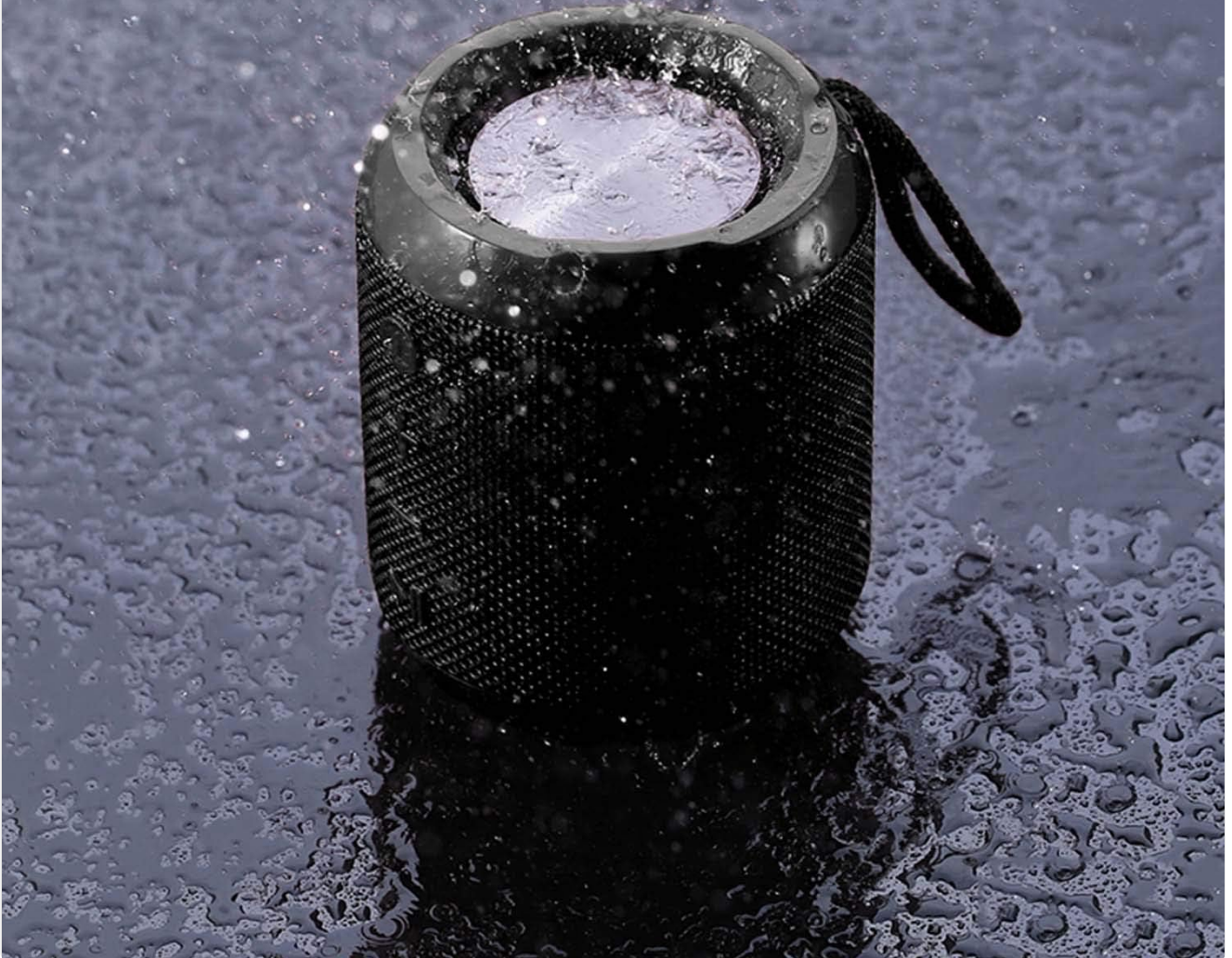
Figure 5: The speaker shown with water splashing on it, emphasizing its IPX6 waterproof rating, suitable for use in wet conditions.

Don't worry about water splashes, dust, rain!