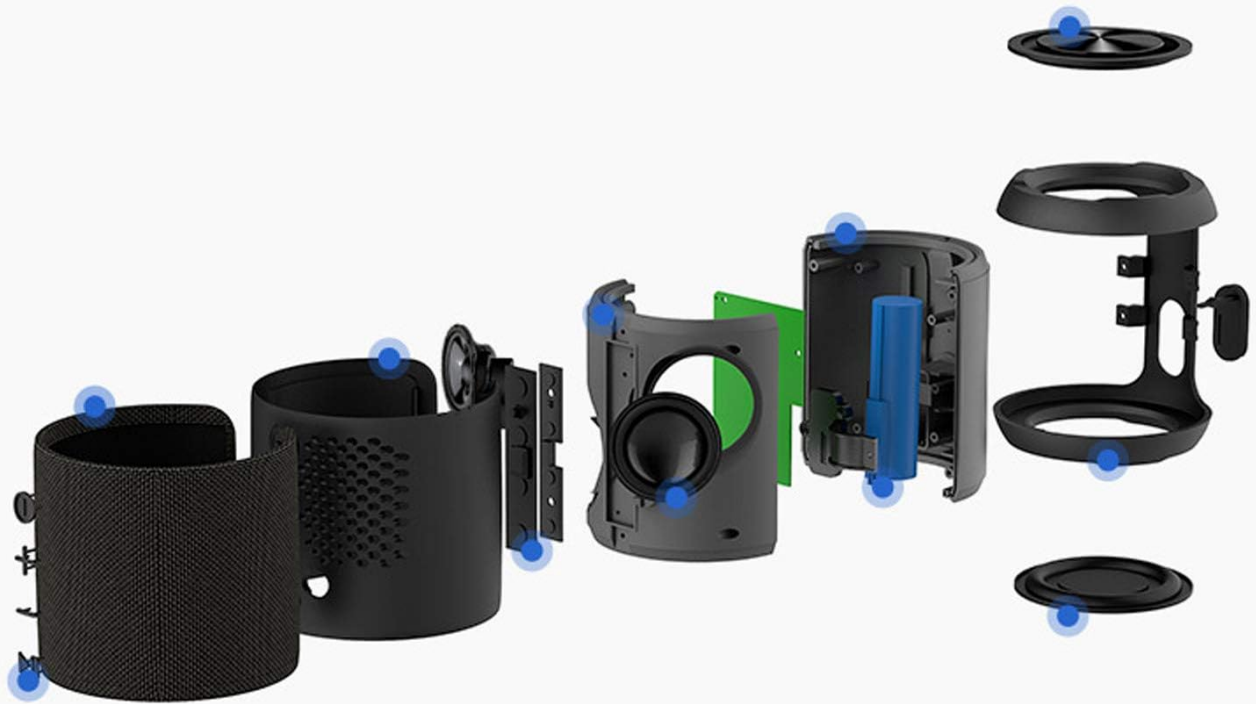
Figure 4: An exploded diagram illustrating the internal components of the speaker, highlighting its sophisticated sound and bass processing technology.