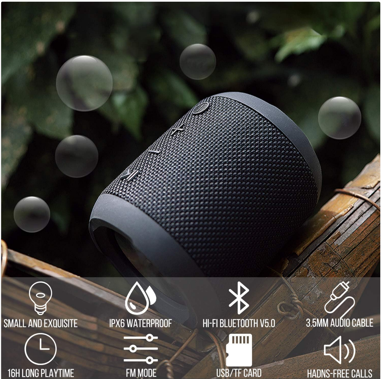
Figure 6: A visual summary of the speaker's features, including its small size, IPX6 waterproof rating, Hi-Fi Bluetooth V5.0, 3.5mm audio cable support, 16-hour long playtime, FM mode, USB/TF card slot, and hands-free call support.