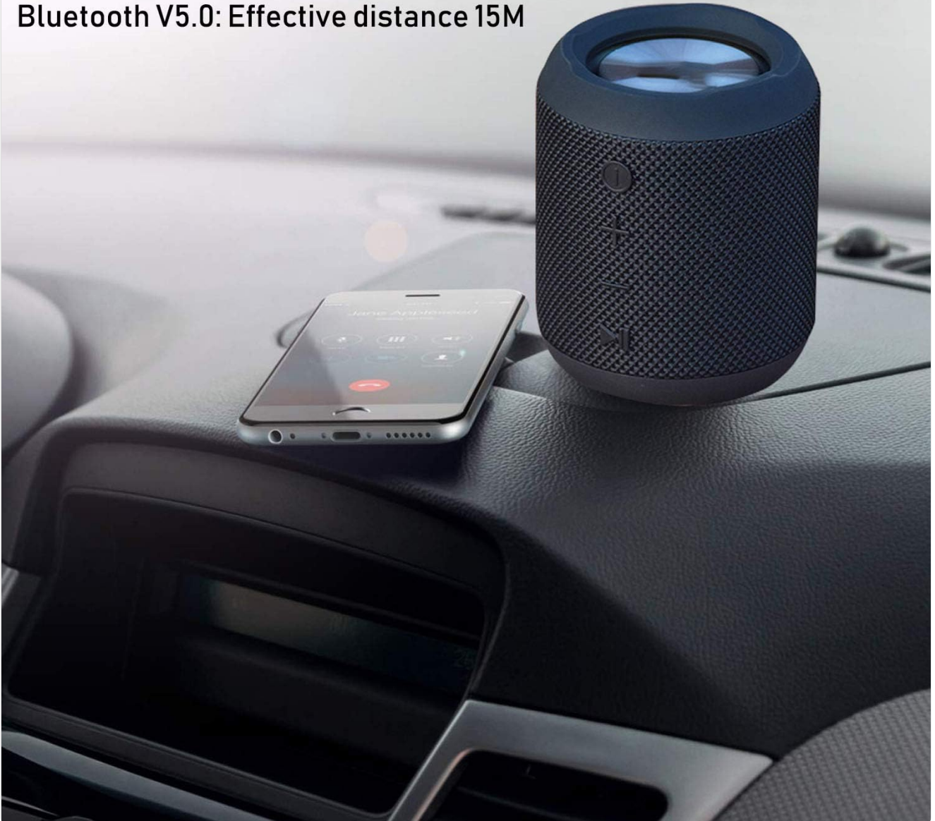
Figure 2: The speaker positioned next to a smartphone, demonstrating its hands-free call capability via Bluetooth V5.0 with an effective distance of 15 meters.