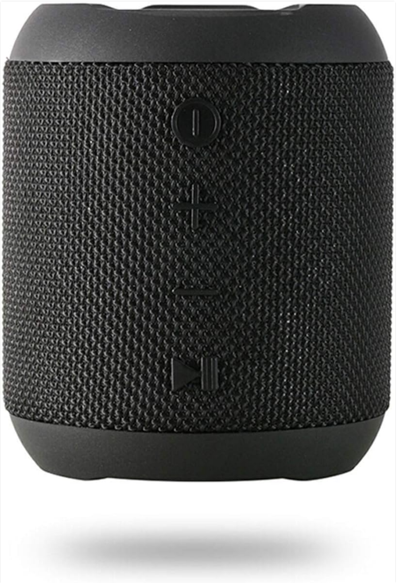
Figure 1: Front view of the SENXINGYAN SXY-M2 Bluetooth Speaker, showing the control buttons.