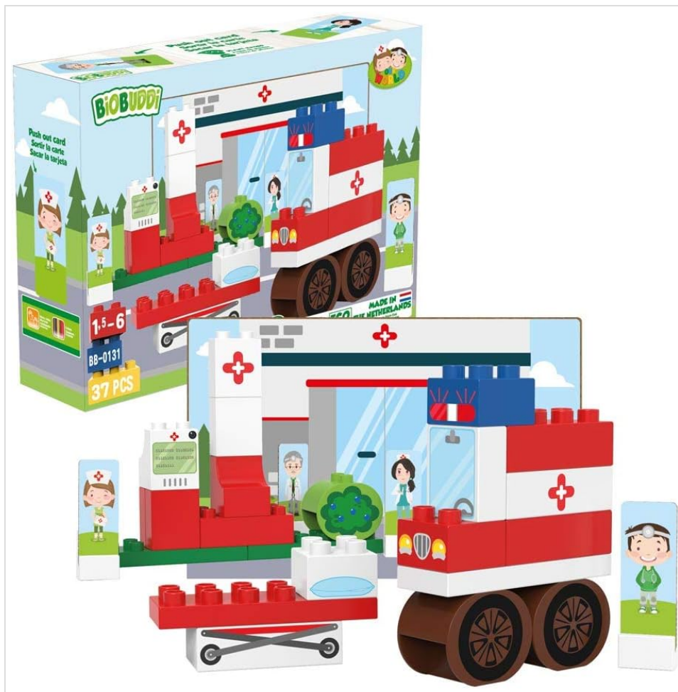
Image: The BIOBUDDI City Hospital set packaging, displaying key product information and the assembled toy.