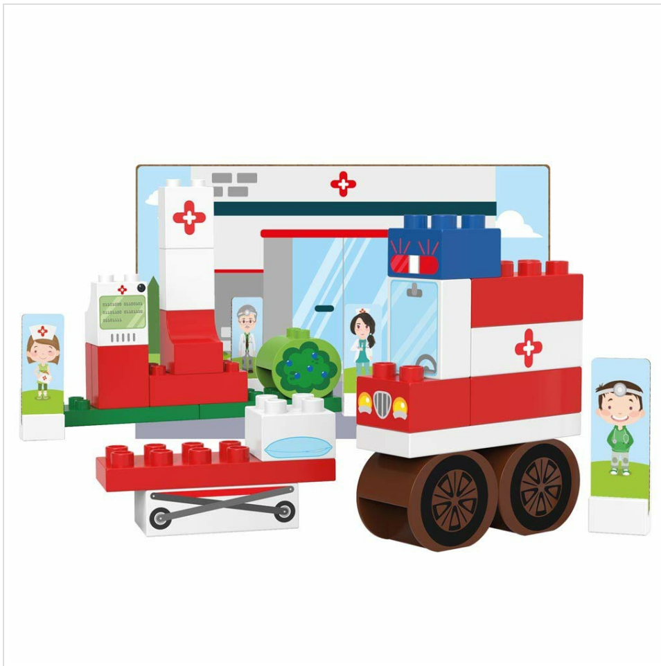
Image: The fully assembled BIOBUDDI City Hospital set, showcasing the hospital building, ambulance, and character figures in a complete play scene.