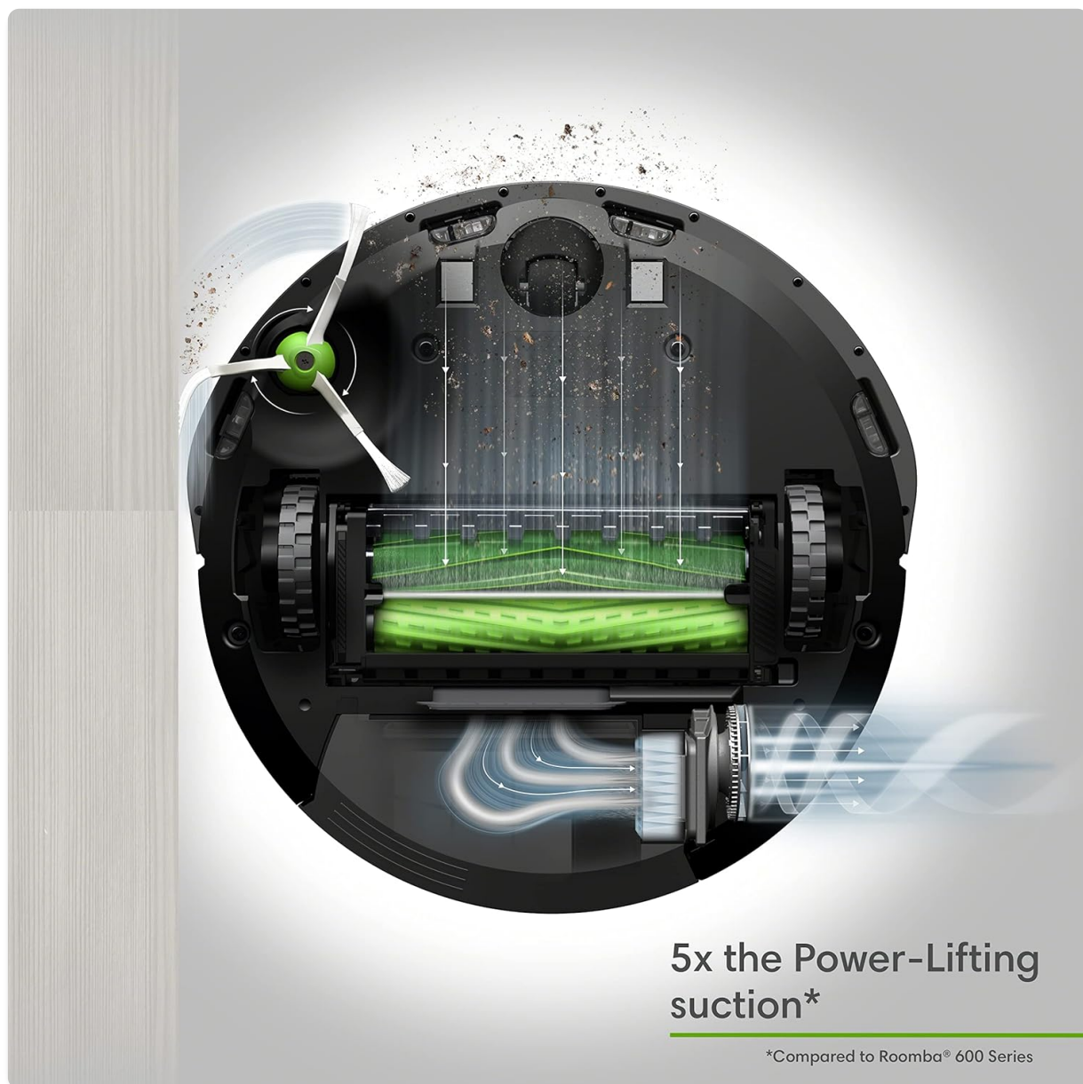
Figure 3: An illustration of the Roomba E5's underside, highlighting its 5X power-lifting suction system.