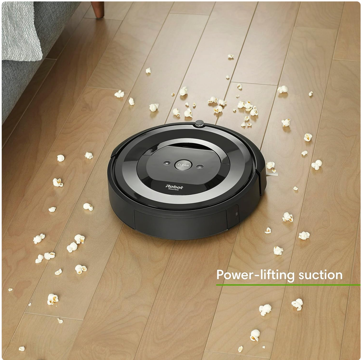
Figure 2: The Roomba E5 demonstrating its power-lifting suction on a wooden floor.