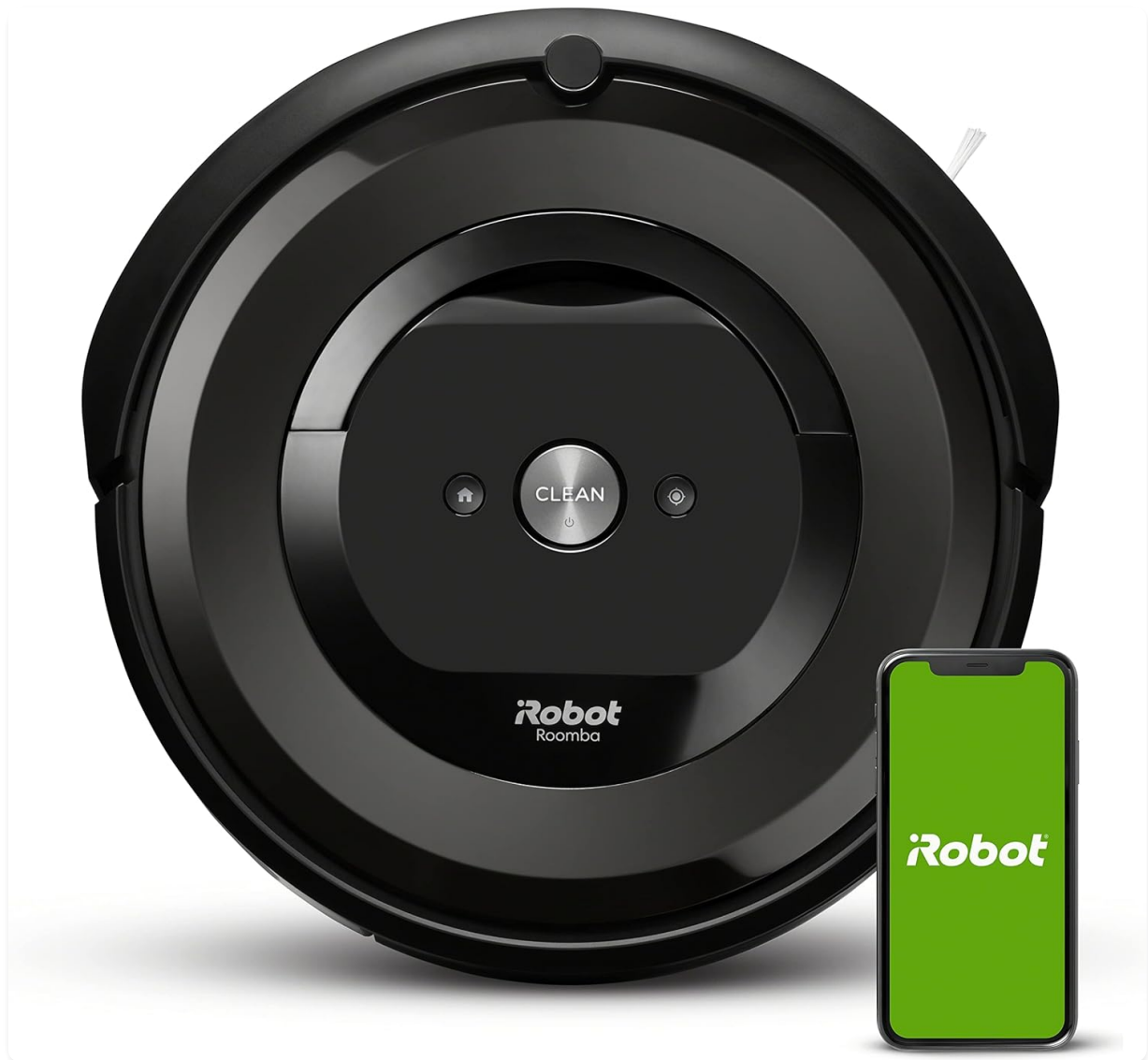
Figure 1: The iRobot Roomba E5 Robot Vacuum and its accompanying smartphone application.