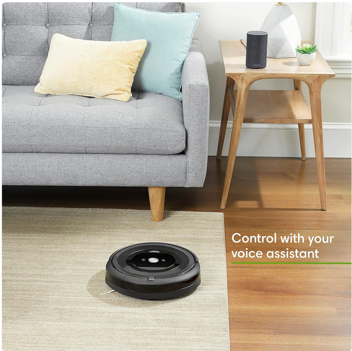
Figure 4: The Roomba E5 can be controlled using voice commands through compatible devices like Amazon Alexa.