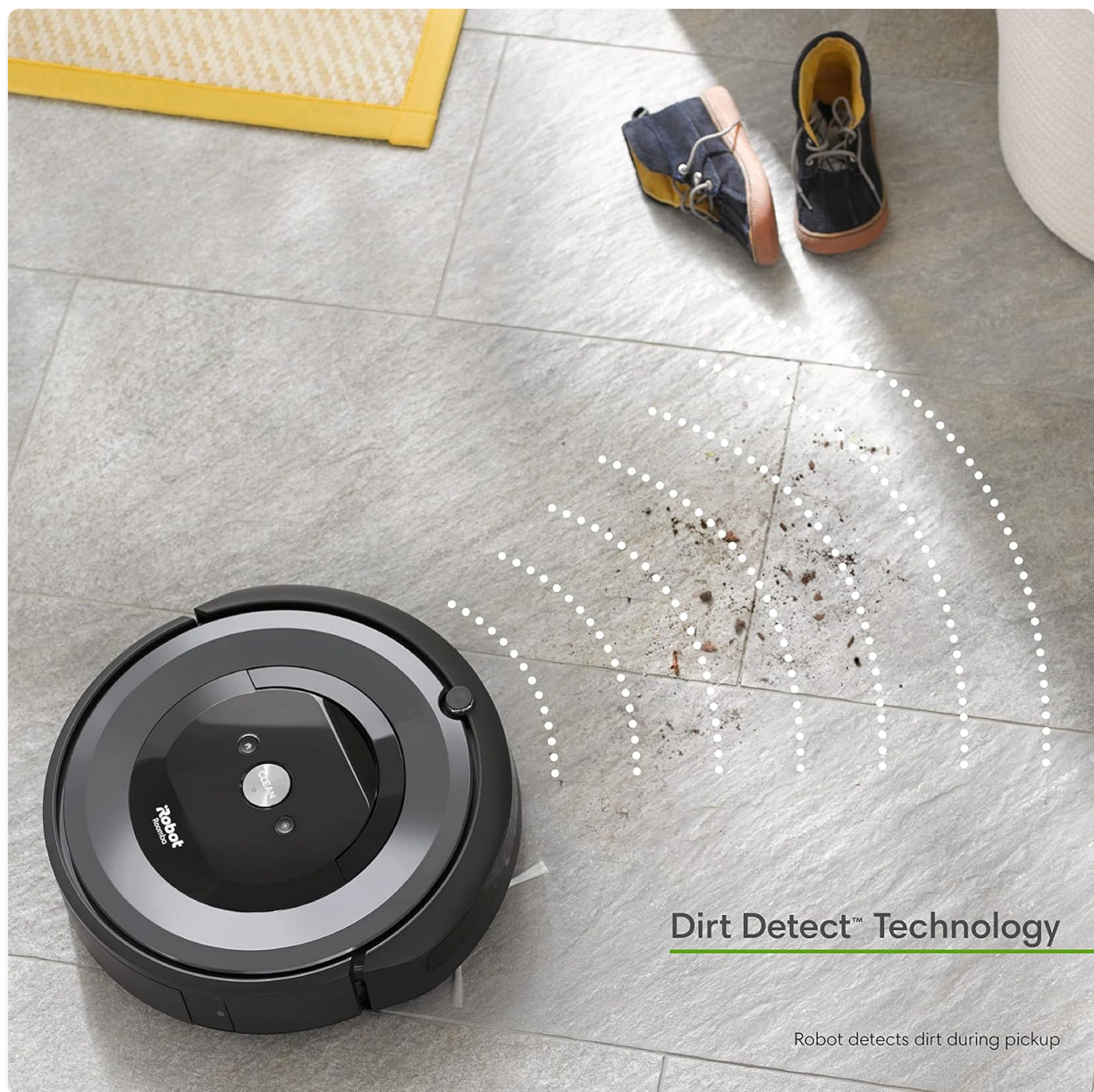
Figure 5: The Roomba E5 utilizes Dirt Detect Technology to identify and focus on dirtier areas.

Video 1: An official overview of the iRobot Roomba E5 (5150) Robot Vacuum, highlighting its features and capabilities.