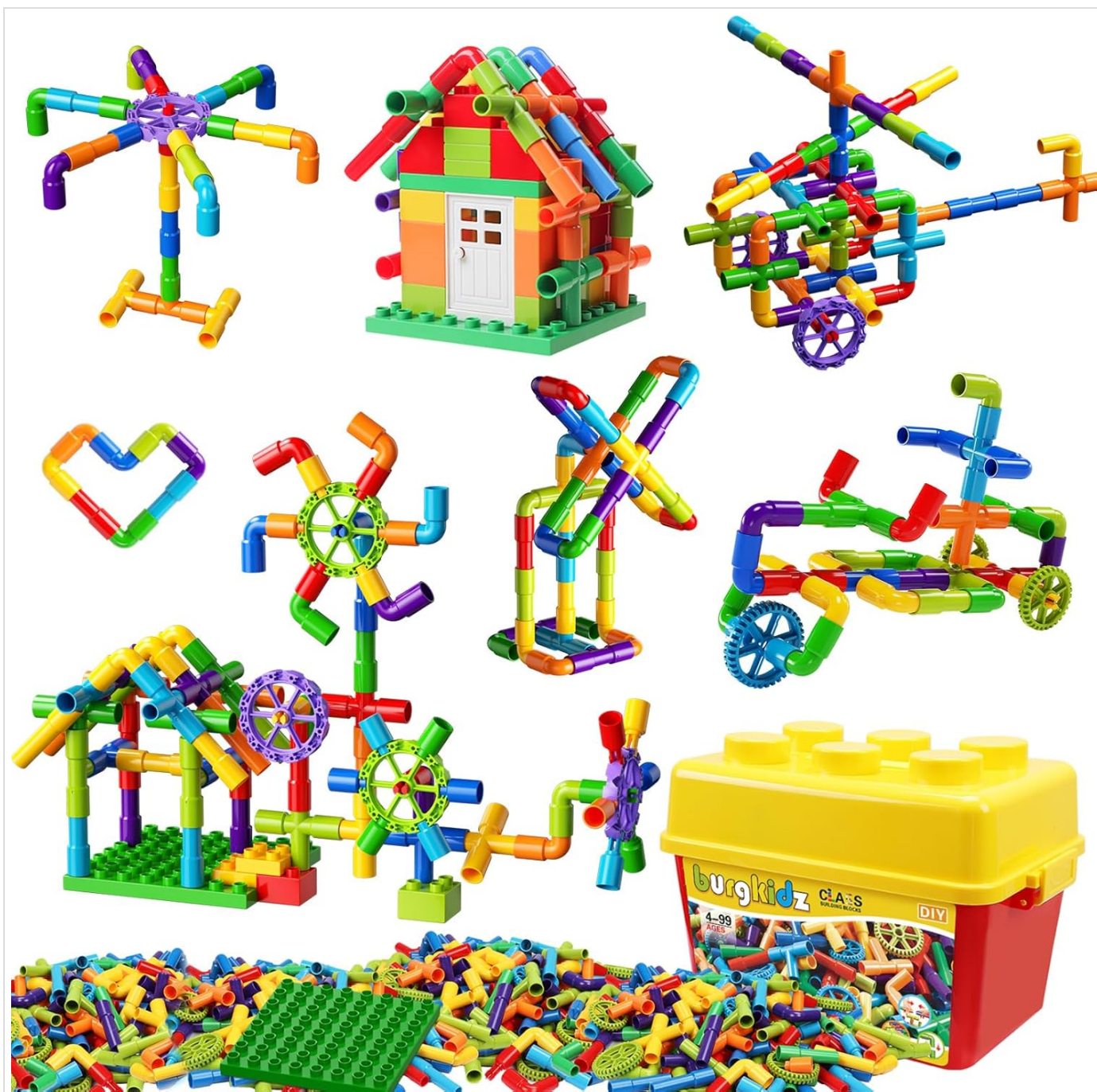
Image: Overview of the burgkidz STEM Learning Pipe Tube Construction Building Blocks set, showcasing the diverse components and potential creations.