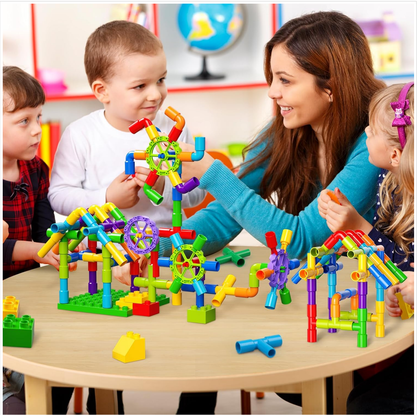
Image: Children and an adult engaging with the building blocks, demonstrating collaborative play and the variety of pieces.