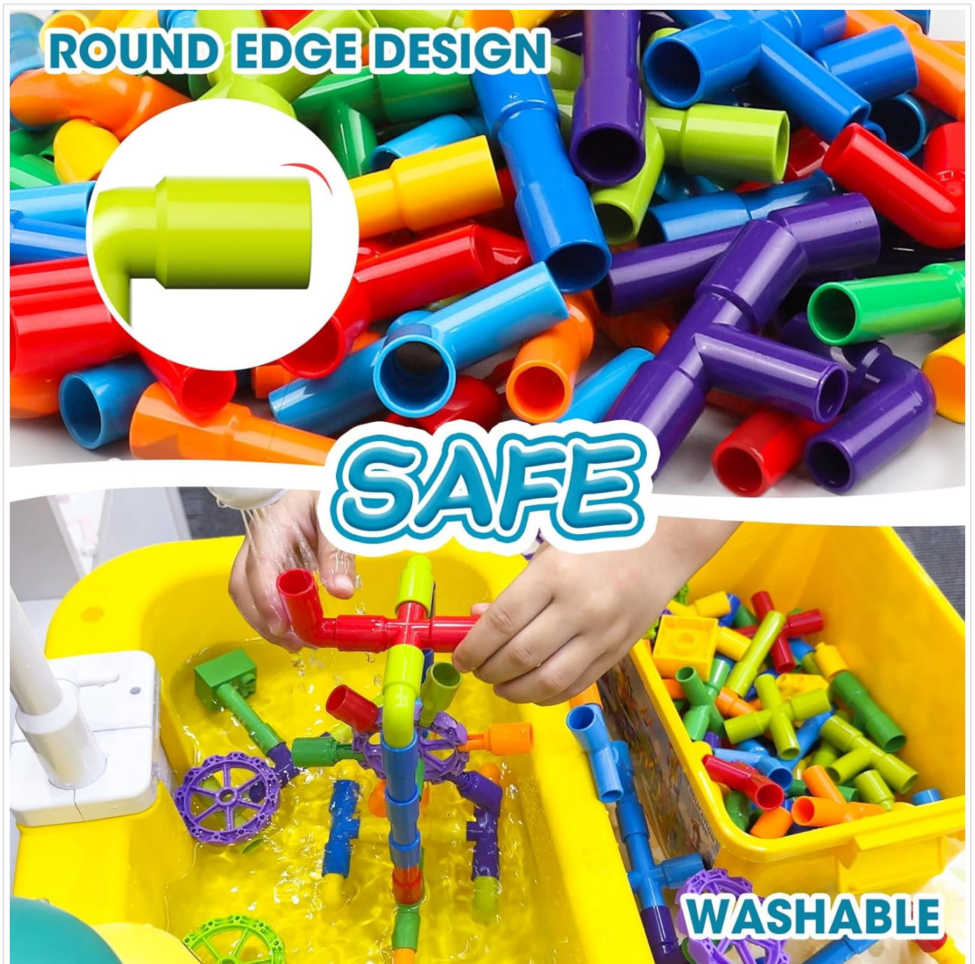
Image: Safety features of the blocks, including rounded edges and their washable nature, demonstrated with a child playing.