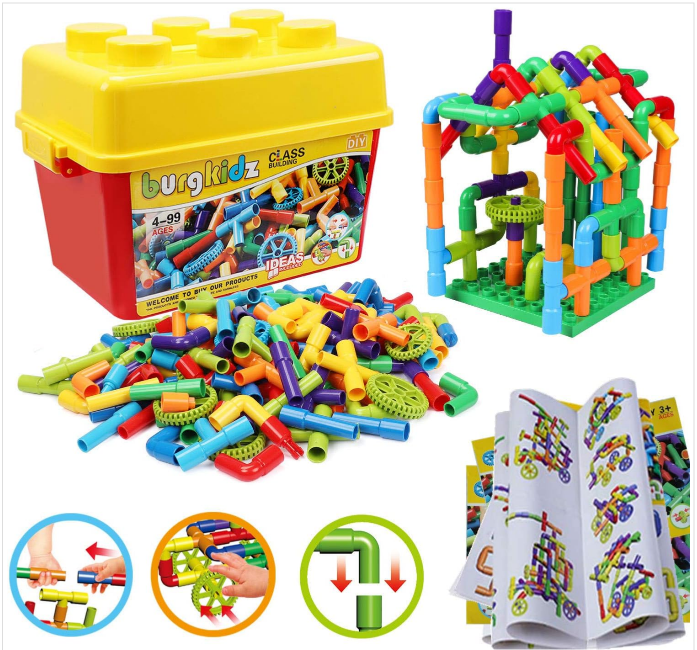
Image: Step-by-step guide on attaching wheels and axles to the pipe building blocks.