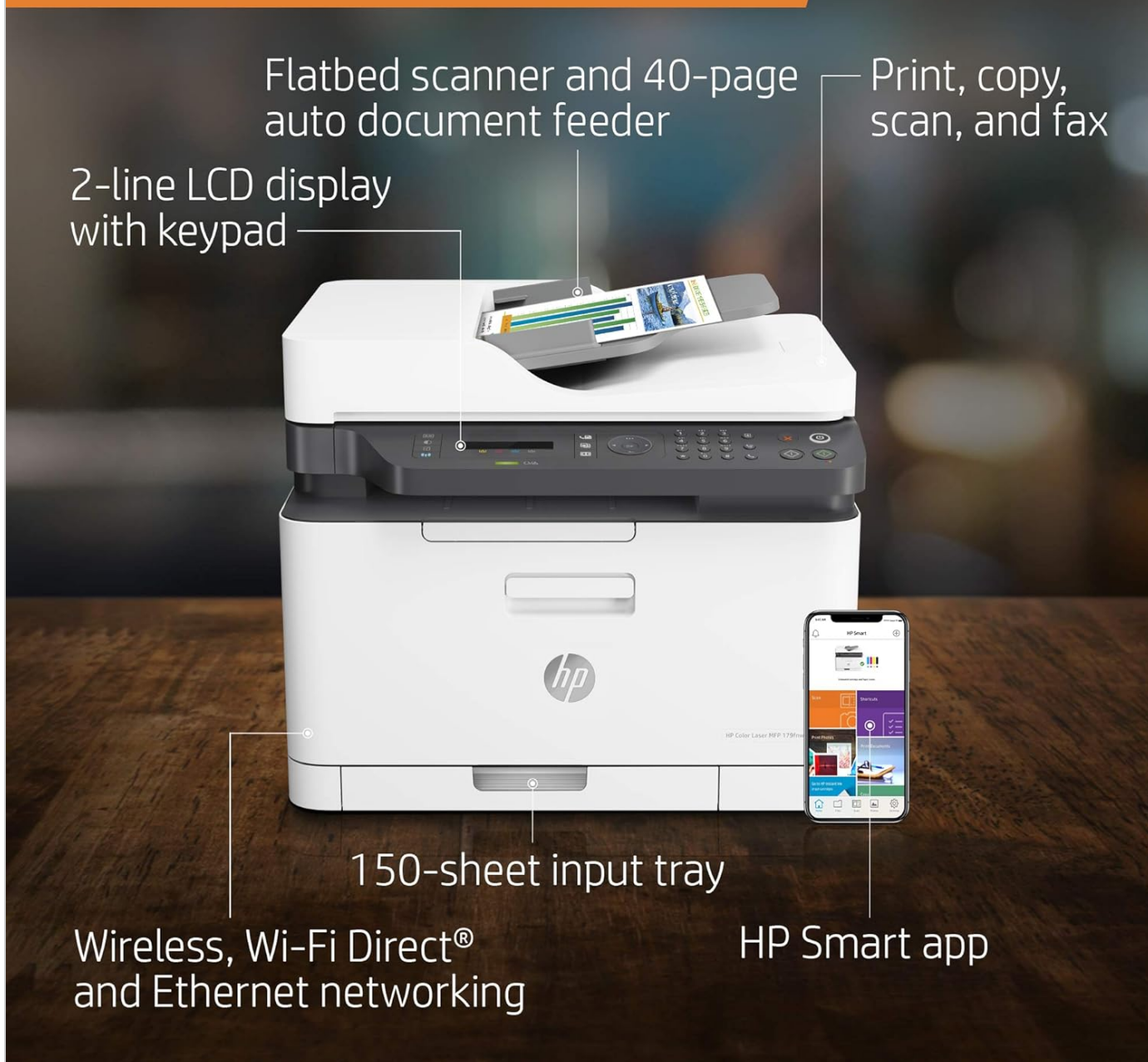
Figure 3: Overview of printer features including flatbed scanner, ADF, LCD display, input tray, and connectivity options.