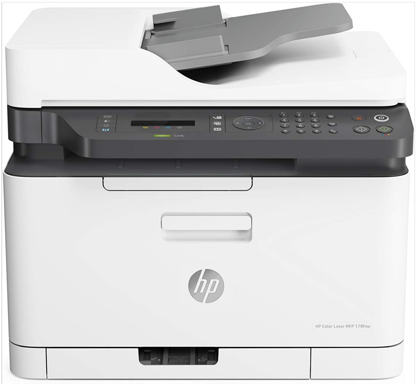
Figure 1: HP Color Laser 179fnw Wireless All-in-One Printer front view.