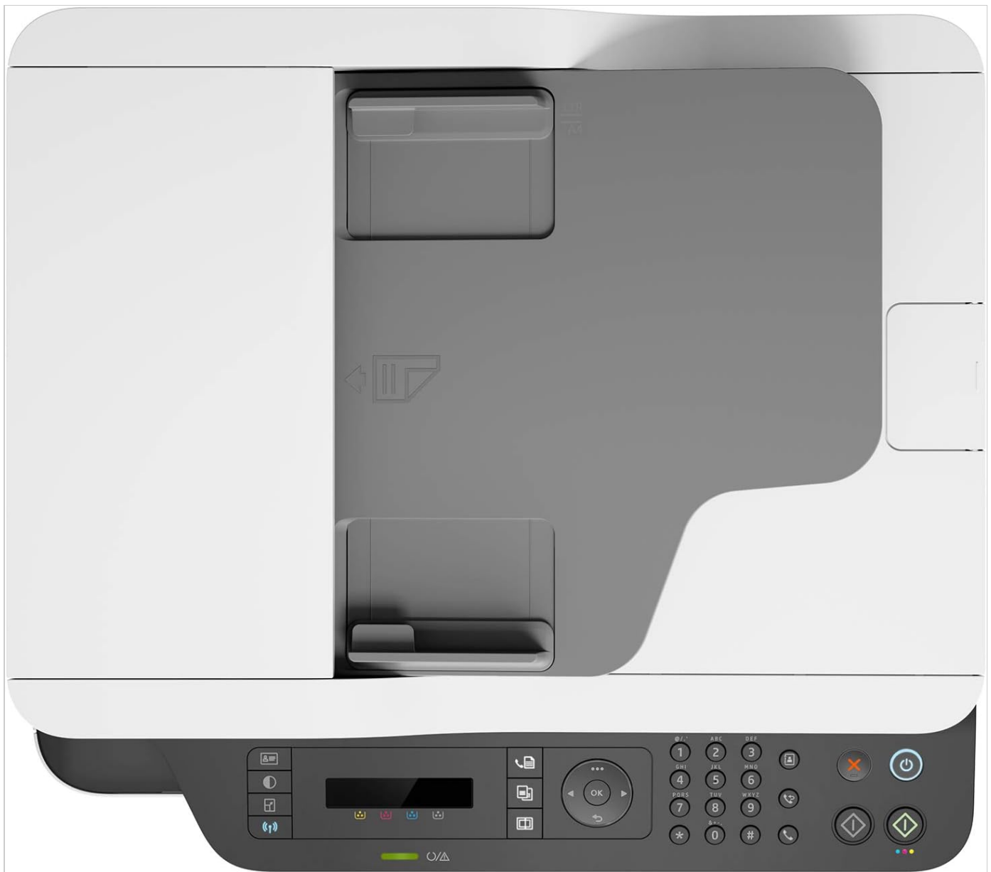
Figure 10: The flatbed scanner for single pages or delicate documents.