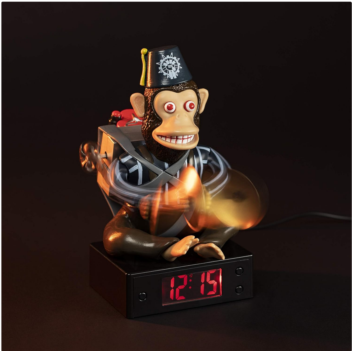
Image 1.1: The Paladone Call of Duty Monkey Bomb Alarm Clock. This image shows the alarm clock from the front, featuring the monkey figure with cymbals and a digital LED display showing '12:15'. A power cord is visible at the back.