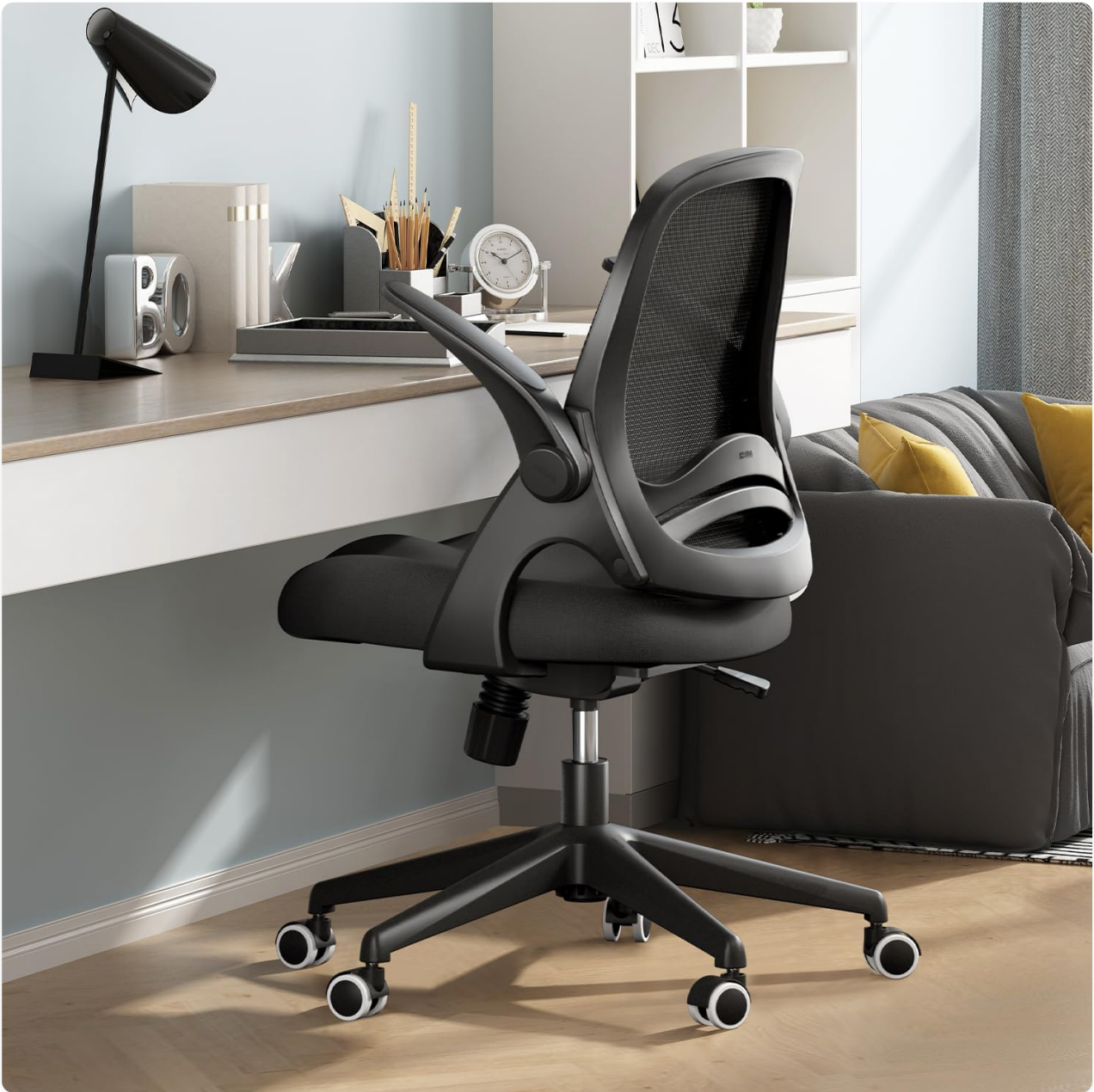
The Hbada J1 Office Desk Chair, featuring its sleek design and comfortable mesh back.