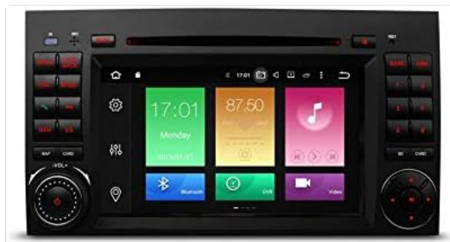
Figure 3: Main Interface. This image shows the front of the Avison 7-inch Android 8.1 Satellite Navigator. The large touchscreen display is active, showing the current time and date, along with intuitive icons for accessing various functions such as radio, music player, and video playback. The physical buttons on the sides of the unit are also visible, providing tactile control.

The unit powers on automatically with your vehicle's ignition and powers off when the ignition is turned off, thanks to Canbus integration.