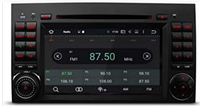
Figure 4: FM Radio Interface. This image illustrates the Avison unit's FM radio interface. The central display shows the current radio frequency, 87.50 MHz, with tuning controls. Below, several preset station buttons are visible, allowing for quick access to favorite radio channels.

Access the radio function from the main screen. You can tune to FM stations and save your favorite frequencies as presets.