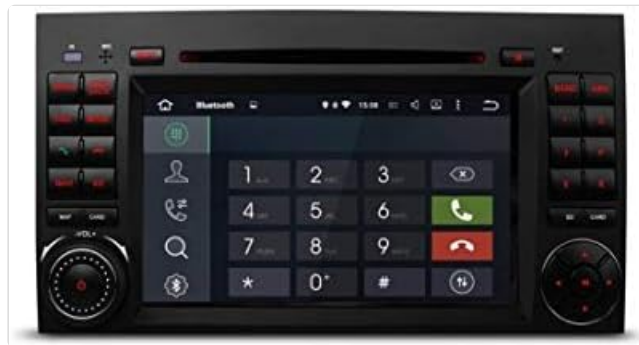
Figure 5: Bluetooth Dial Pad. This image shows the Avison unit's Bluetooth hands-free calling screen. A large numeric dial pad occupies the center of the display, enabling users to dial phone numbers directly from the unit. Icons for call history, contacts, and other phone functions are also present.

Pair your smartphone via Bluetooth to make and receive calls hands-free. You can download your contact list and call logs to the device.