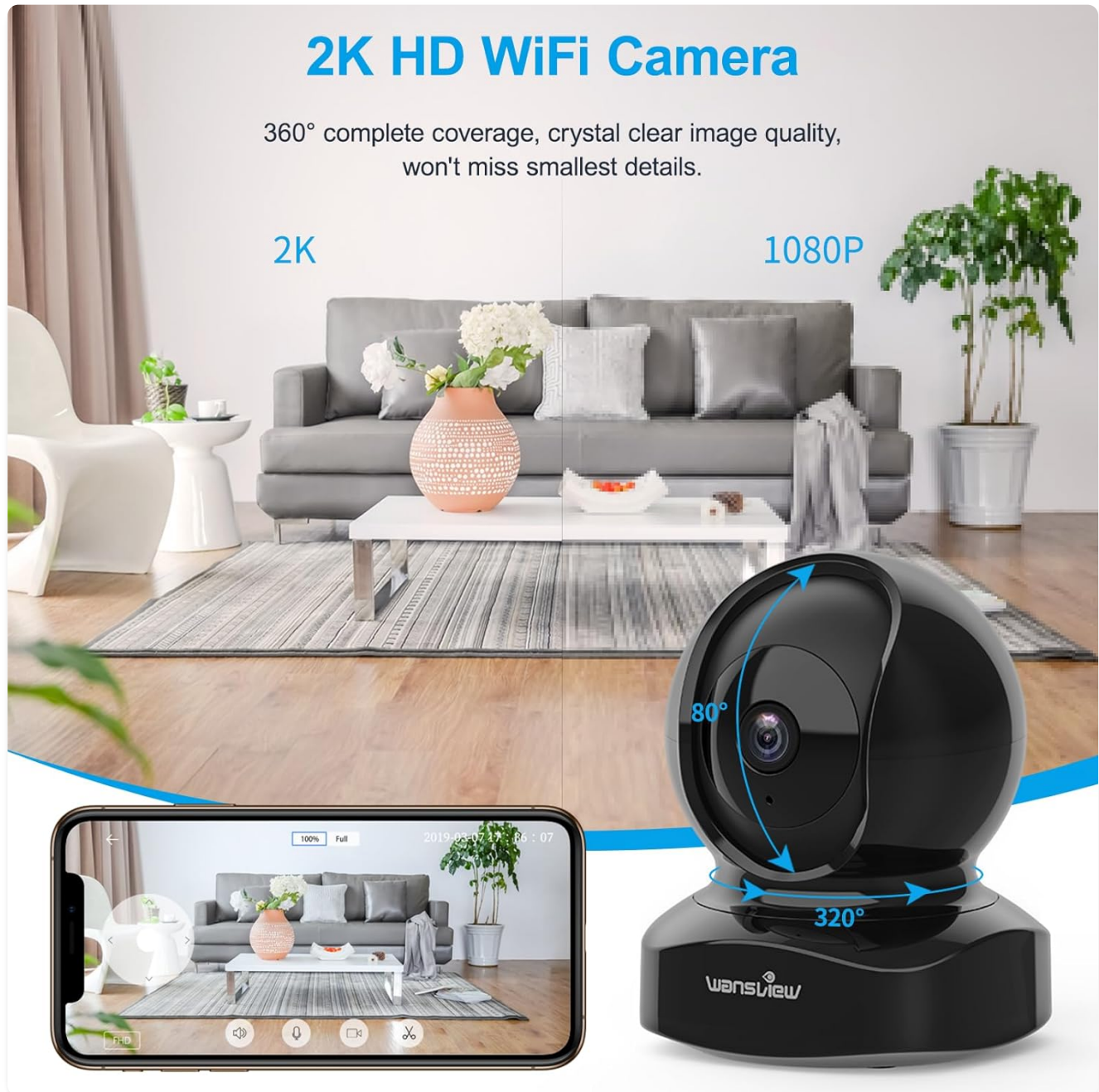
Figure 3: 2K HD WiFi Camera with Pan/Tilt capabilities

Once connected, open the Wansview Cloud app and select your camera to view the live feed. Use the on-screen controls to pan (320° horizontal) and tilt (80° vertical) the camera remotely, providing 360° coverage of your space.