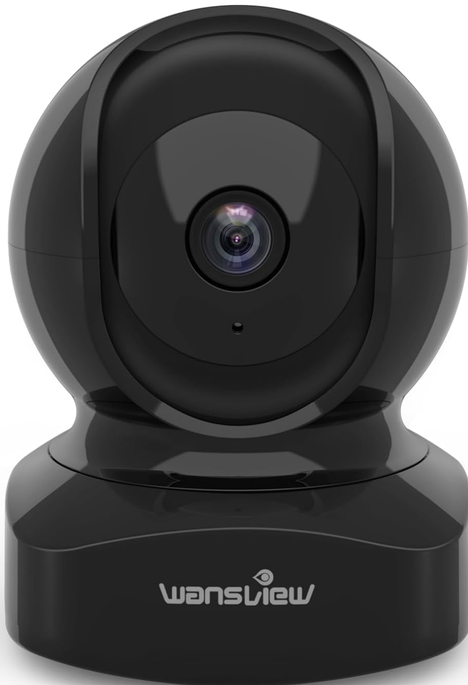
Figure 1: Wansview Q5 3MP Indoor Security Camera