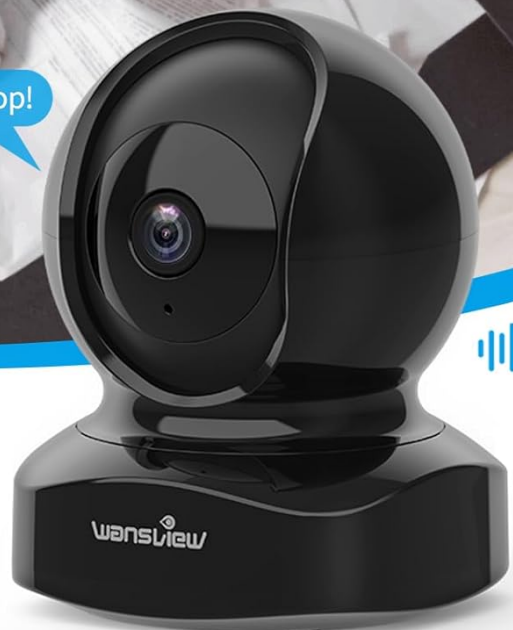
Figure 4: Two-Way Audio in action