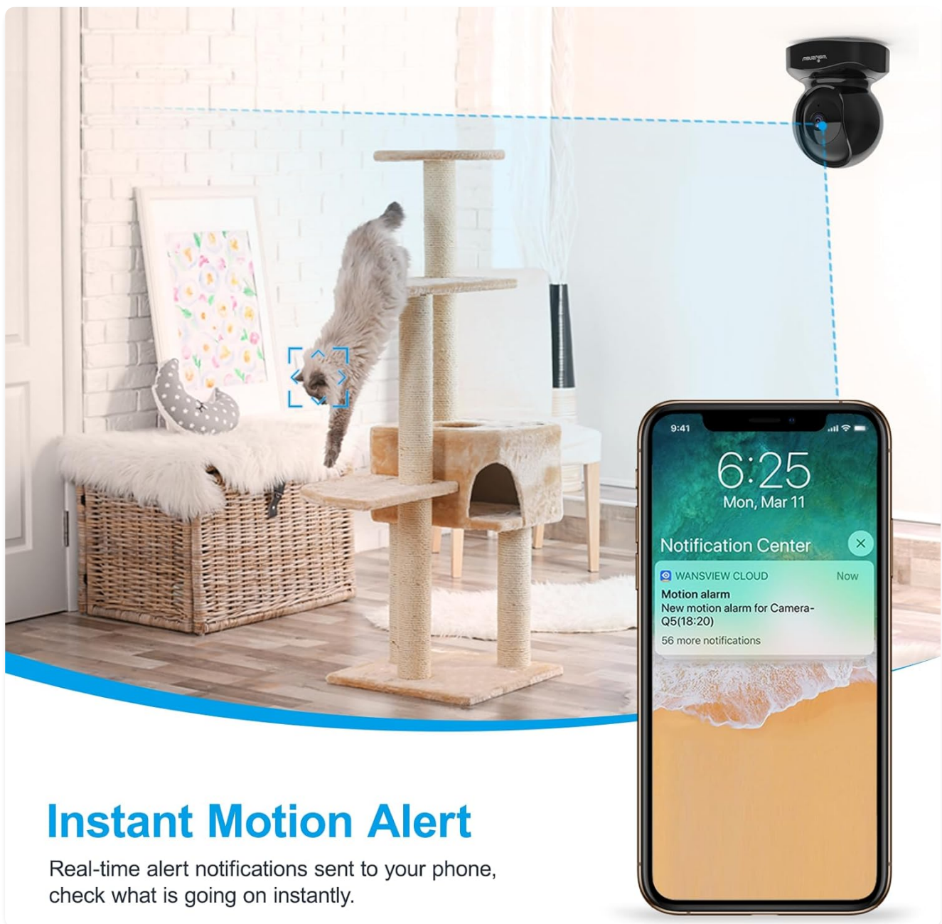
Figure 5: Instant Motion Alert notification