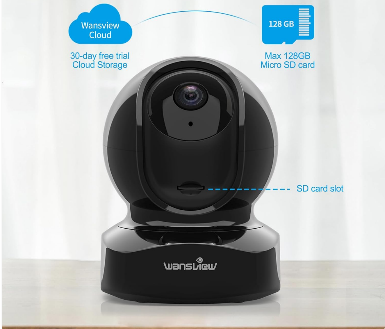
Figure 2: Camera with SD card slot location

Connect the power adapter to the camera and plug it into a power outlet. The camera will power on and begin its initialization sequence.