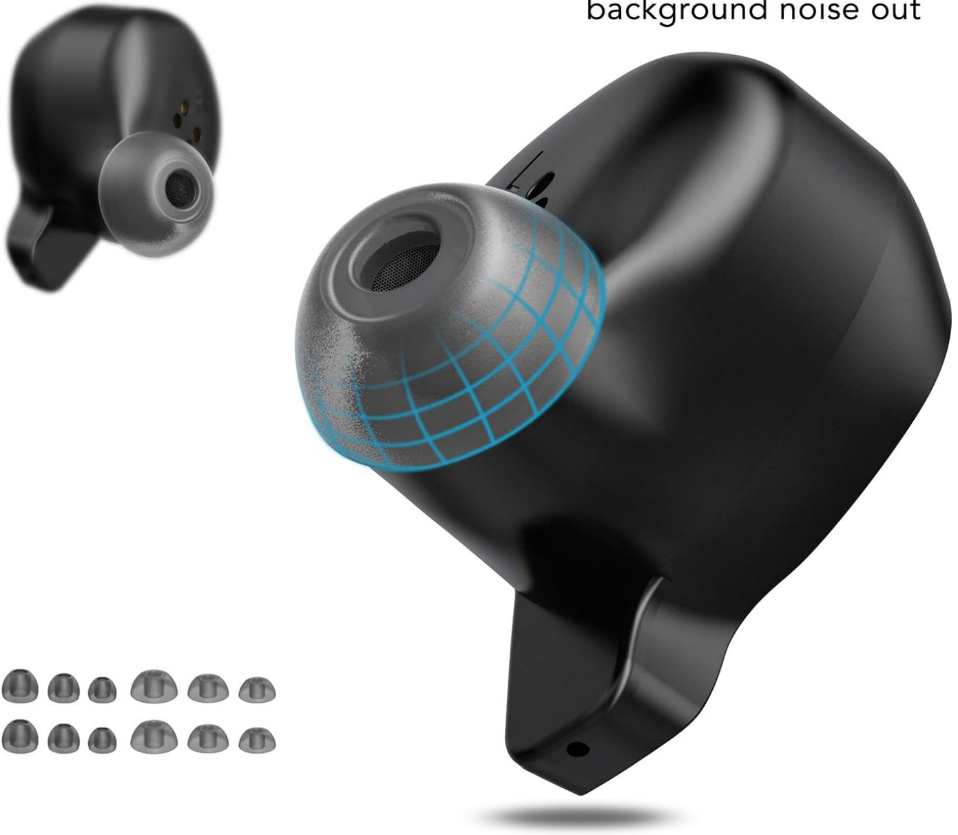
Image: Illustration of the different types and sizes of ear caps provided with the YATWIN Earbuds to ensure a comfortable and secure fit.

Fit Snug without falling out. Stay comfortable and relatively stealth in ears and keep background noise out