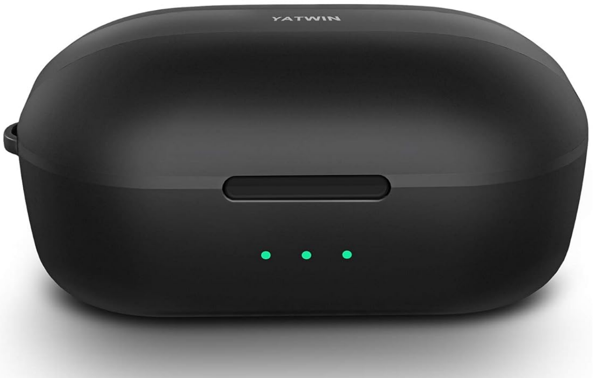
Image: Front view of the YATWIN Wireless Earbuds and their charging case, highlighting the IPX7 water resistance.

The YATWIN Wireless Earbuds feature a compact design with intuitive controls. The charging case provides additional battery life, ensuring your earbuds are always ready for use. Each earbud is equipped with an LED indicator and a multi-function button for control.