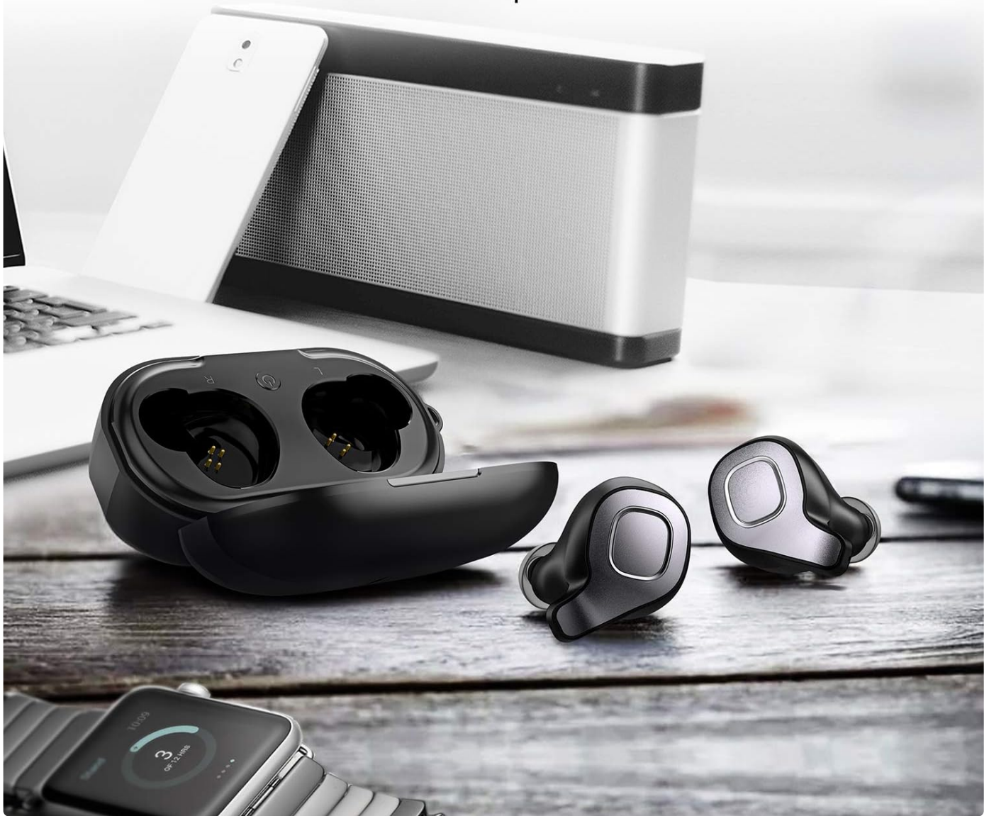
Image: YATWIN Earbuds placed in their charging case, demonstrating their portability and extended use.

With up to 7 hours of battery on a single charge, and up to 21 hours in total with the included pocket-friendly charging case, your listening needs are met from the start of the day, to its end.