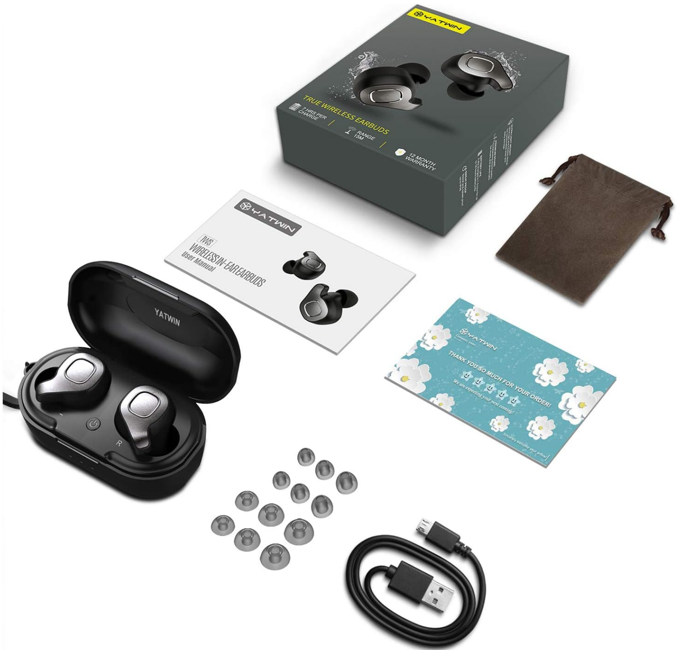
Image: All components included in the YATWIN Wireless Earbuds package.