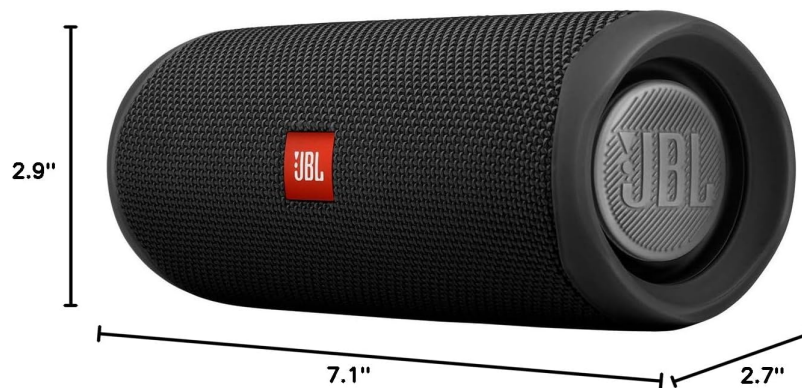
Image: Diagram showing the dimensions of the JBL Flip 5 speaker (7.1" x 2.7" x 2.9").