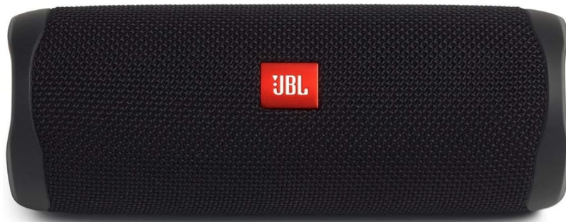
Image: Front view of the JBL Flip 5 portable Bluetooth speaker in black, showcasing its mesh grille and JBL logo.

The JBL Flip 5 is a powerful, lightweight, and waterproof portable Bluetooth speaker designed for on-the-go audio. It delivers signature JBL sound and offers extended playtime, making it suitable for various environments, rain or shine.