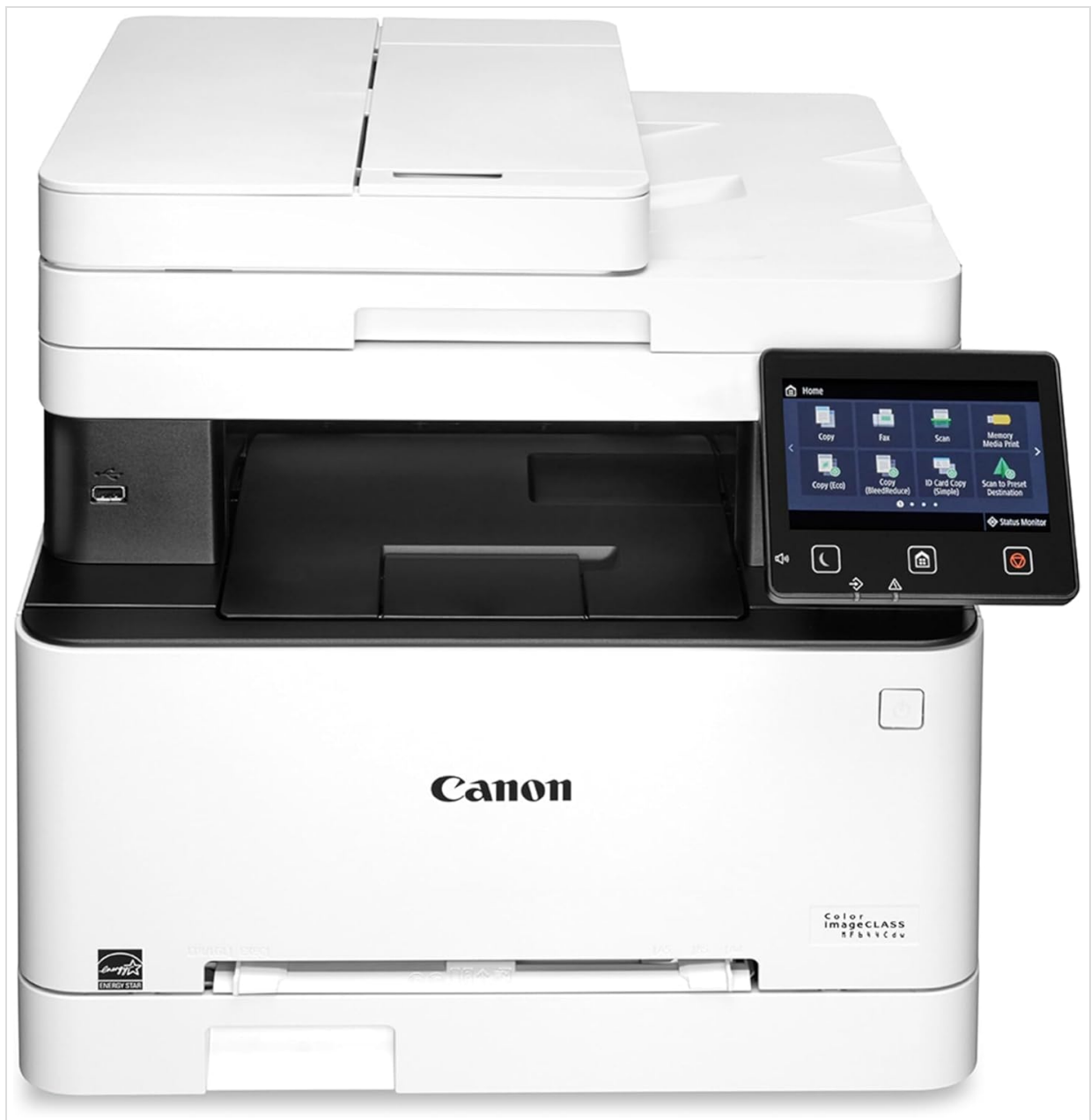
Front view of the Canon Color imageCLASS MF644Cdw printer, showcasing its compact design and touchscreen panel.