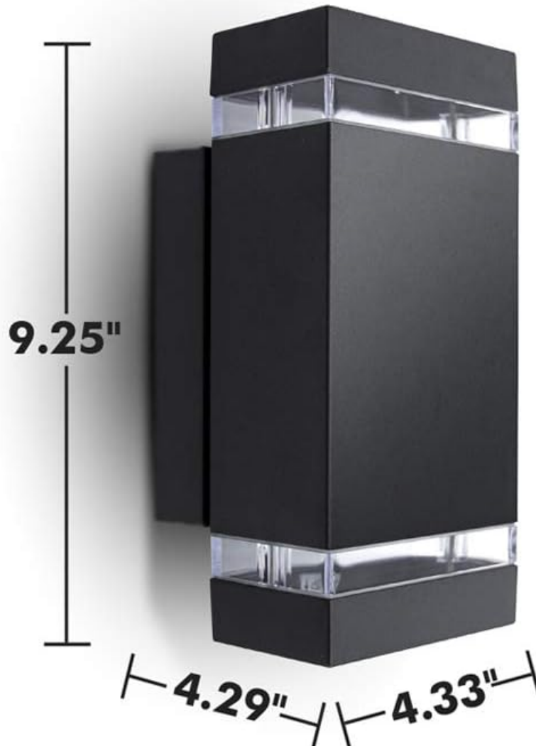
Figure 1: Product Dimensions. The fixture measures 9.25 inches in height, 4.33 inches in width, and 4.29 inches in depth.