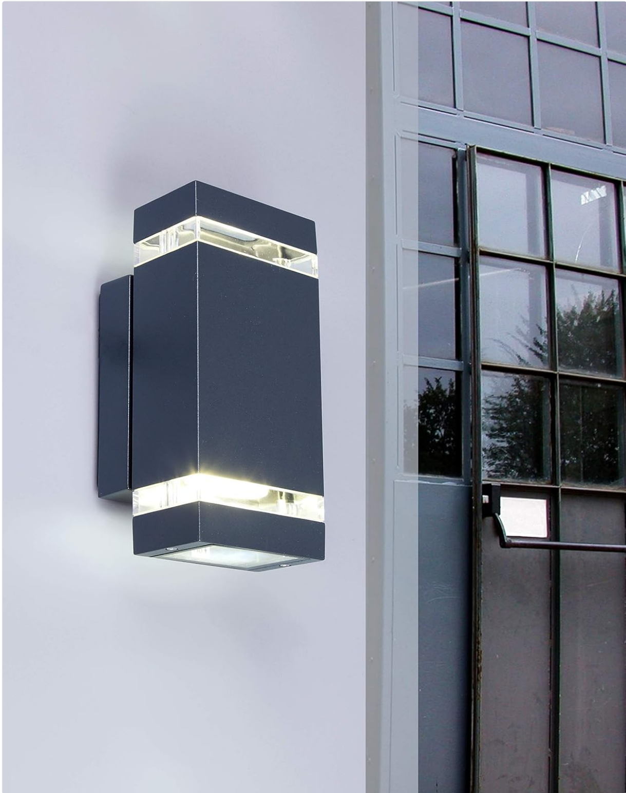
Figure 2: Installed LUTEC Focus 6050 LED Wall Light.