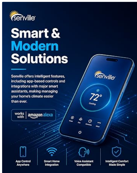
Image: The Senville app interface demonstrating smart home integration capabilities.