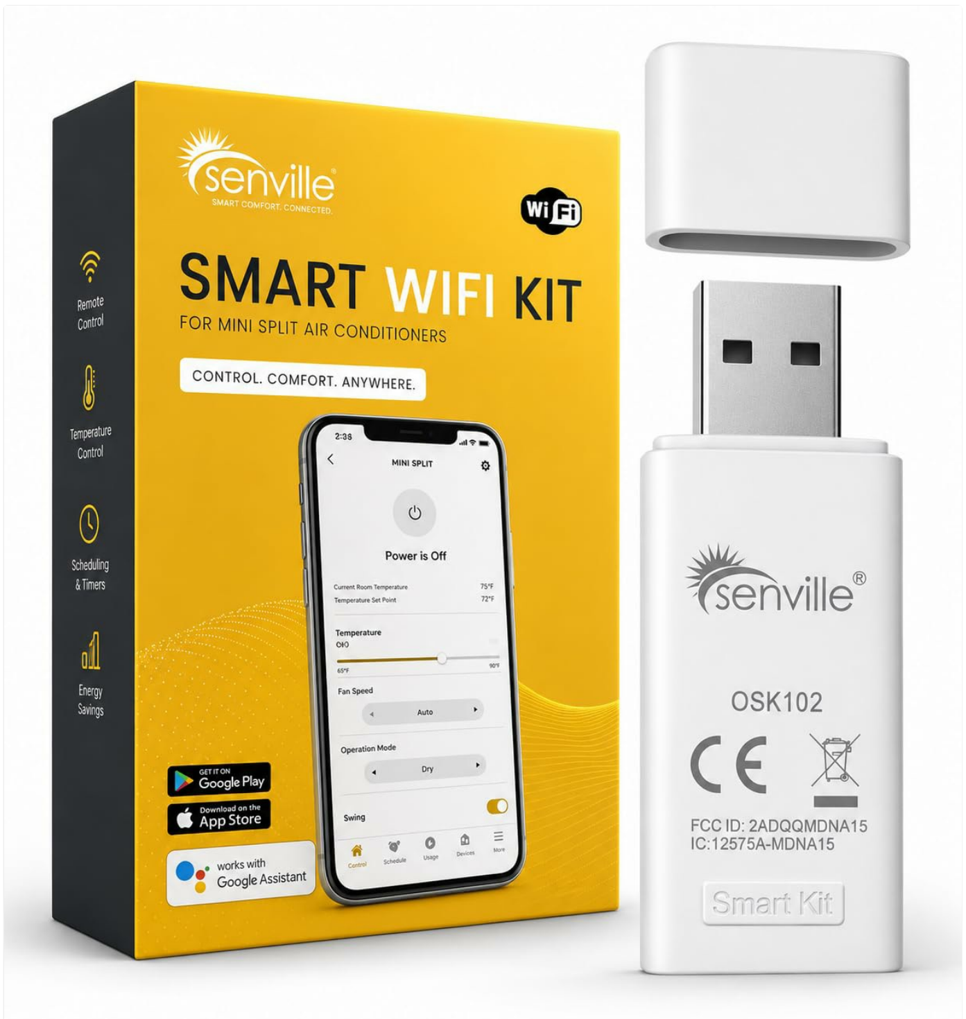
Image: Senville Smart WiFi Kit USB adapter.